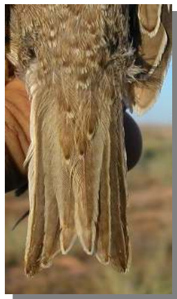
Calandra Lark. Tail pattern: left adult (07-VII); right juvenile (06-VII)