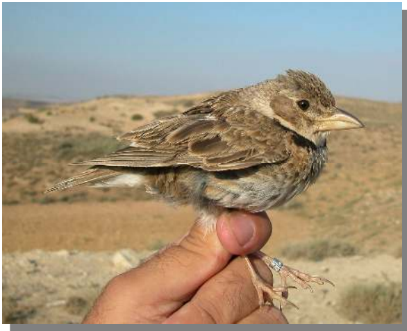
Calandra Lark. Adult (27-VII).