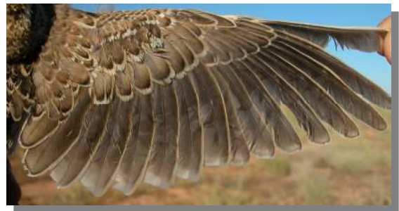
Calandra Lark. Juvenile: pattern of wing (06-VII)