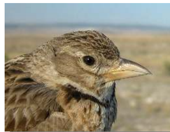
Calandra Lark. Ageing. Pattern of head: top adult; bottom juvenile.