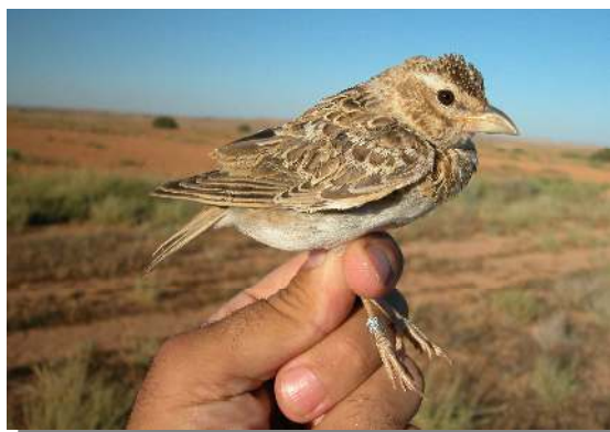
Calandra Lark. Juvenile (06-VII)