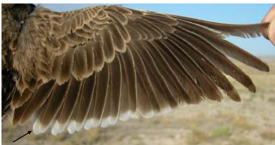
Calandra Lark. Pattern of wing and head.

After postbreeding/postjuvenile moults ageing is not possible using plumage pattern.