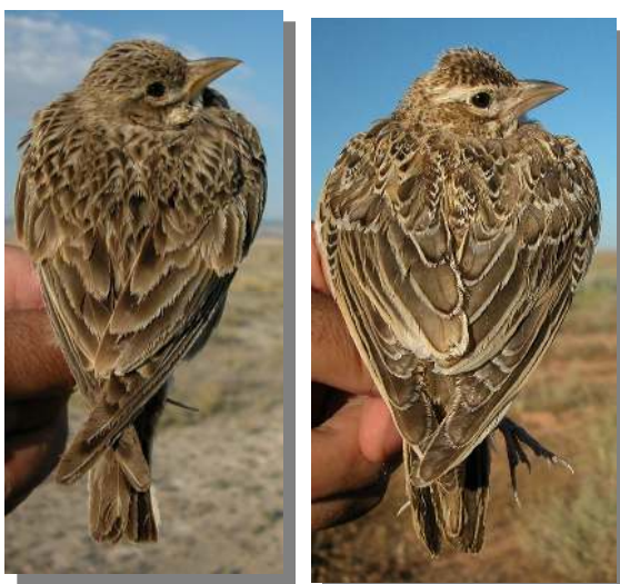
Calandra Lark. Ageing. Pattern of upperparts: left adult; right juvenile.