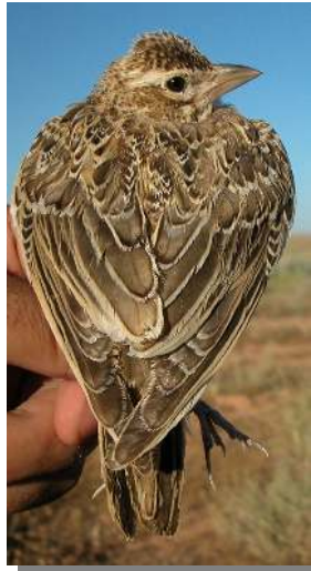
Calandra Lark. Upperpart pattern: left adult (07-VII); right juvenile (06-VII)