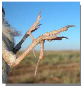
Calandra Lark. Legs colour: left adult (07-VII); right juvenile (06-VII)