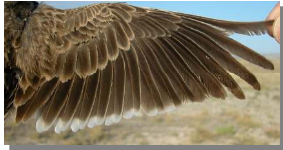
Calandra Lark. Adult: pattern of wing (07-VII).