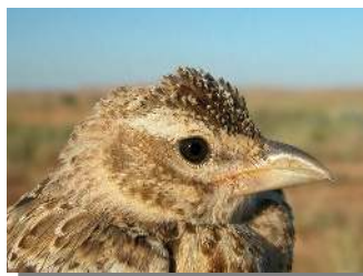
Calandra Lark. Head pattern: top adult (07-VII); bottom juvenile (06-VII)