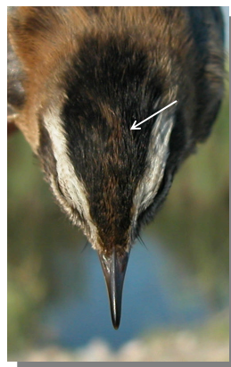
Moustached Warbler: whitish throat; pure white and wide supercilium; blackish lores; crown unstreaked blackish; unstreaked rump; short primary projection.