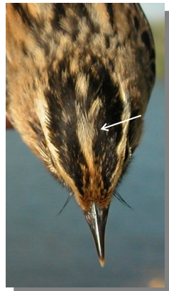
Aquatic Warbler: pale creamy throat; creamy supercilium; without dark lores; crown with a pale line in the centre; streaked rump; short primary projection.