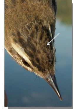
Sedge Warbler: pale creamy throat; creamy supercilium; brownish lores; crown streaked dark; unstreaked rump; long primary projection.