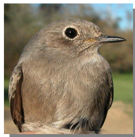
Black Redstart. Colour of plumage. Female/postjuvenile male: slate grey above and below, without buff tones; tertials with dark buff edges.