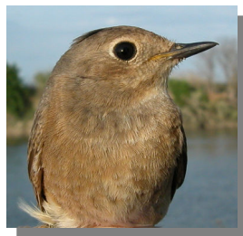
Common Redstart. Colour of plumage. Female: grey brown above and pale buff below; tertials with pale buff edges.