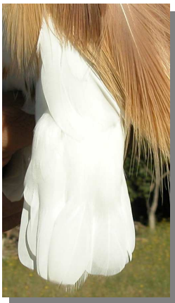
Squacco Heron. Adult: tail pattern (26- VII).