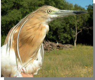
Squacco Heron. Adult: breast pattern (26- VII).