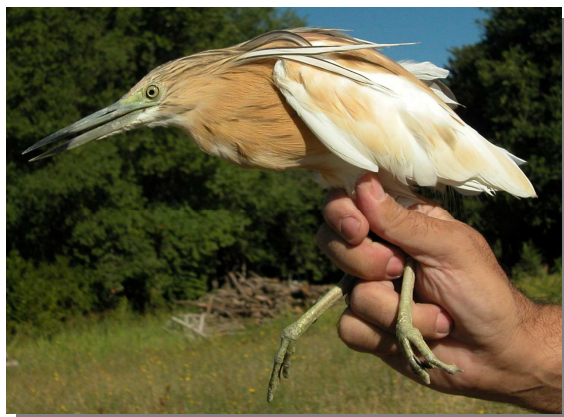
Squacco Heron. Adult (26-VII).