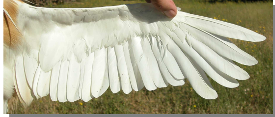
Squacco Heron. Adult: pattern of wing (26-VII).