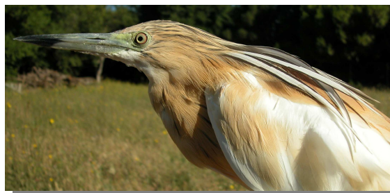
Squacco Heron. Adult: head pattern (26-VII).

Summer visitor, with very scarce breeding pairs in Sariñena and some places of the Ebro river.