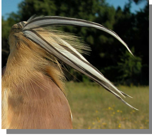
Squacco Heron. Adult: nape pattern (26- VII).