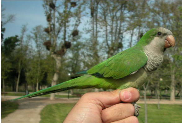
Monk Parakeet. Adult (21-IV).