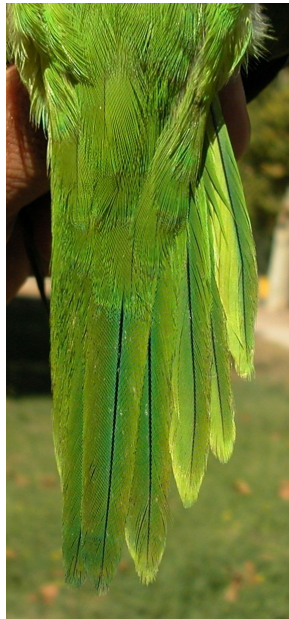
Monk Parakeet. Tail pattern: left adult (21-IV); right juvenile (08-VIII).