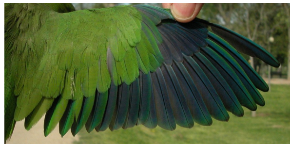
Monk Parakeet. Adult: pattern of wing (21-IV).