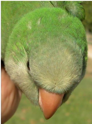
Monk Parakeet. Forehead pattern: top adult (21-IV); bottom juvenile (08-VIII).