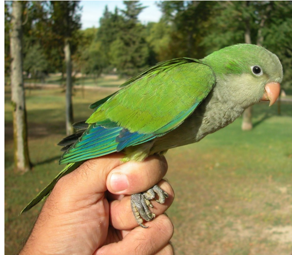
Monk Parakeet. Juvenile (08-VIII).