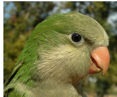
Monk Parakeet. Head pattern: top adult (21-IV); bottom juvenile (08-VIII).