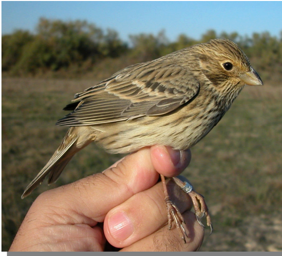
Corn Bunting. Adult (21-X).

16-19 cm. Brown and streaked plumage, with lighter underparts; no white on wings and tail; robust head and thick bill.