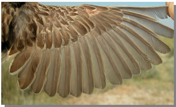
Corn Bunting. Juvenile: pattern of wing (05-VII).