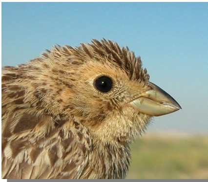
Corn Bunting. Head pattern: top adult (19-X); bottom juvenile (05-VII).