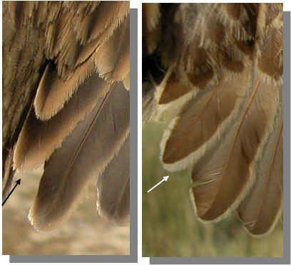
Corn Bunting. Ageing. Pattern of tertials: left adult; right juvenile.

After the postbreeding/postjuvenile moult, ageing is not possible using plumage characteristics.