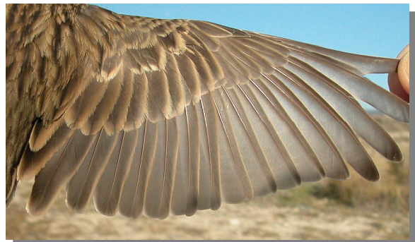
Corn Bunting. Adult: pattern of wing (13-I).