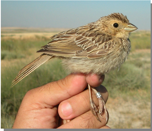
Corn Bunting. Juvenile (05-VII).