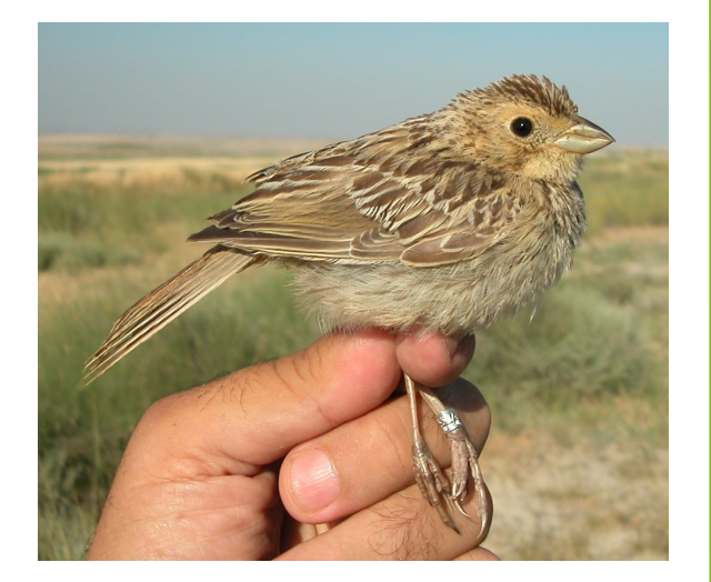
Corn Bunting. Juvenile (05-VII).