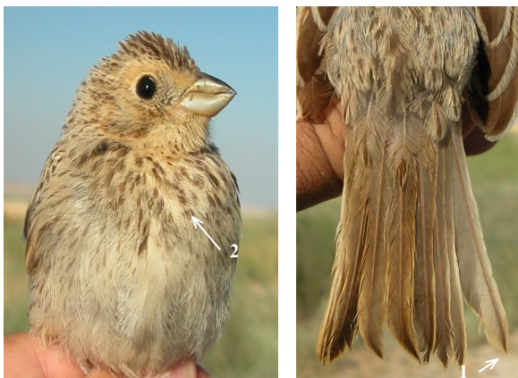
Corn Bunting: no pure white on tail feathers (1); breast slightly spotted (2).

- Rump and uppertail coverts rufous; head usually intense yellow ( CAUTION: not always); lesser coverts olive-green; 6th to 8th primaries emarginated: Yellowhammer ( Emberiza citrinella )