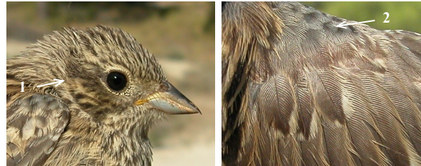
Rock Bunting: head without yellow or green tinge (1); lesser coverts bluish (2).