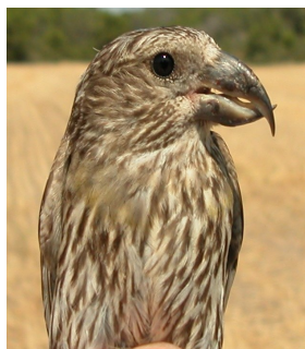
Red Crossbill. Breast pattern: top left 1st year male (19-XI); top right 2nd year female (13-V); left juvenile (17-VII).