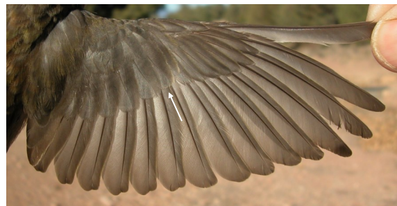
Red Crossbill. 1st year. Male: pattern of wing (19-XI).