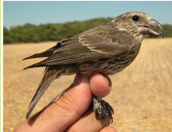
Red Crossbill. Juvenile (17-VII).