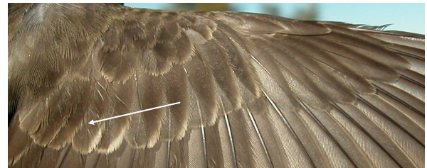
Red Crossbill. Ageing. Mould limit on wing coverts: top adult; bottom 1st year.