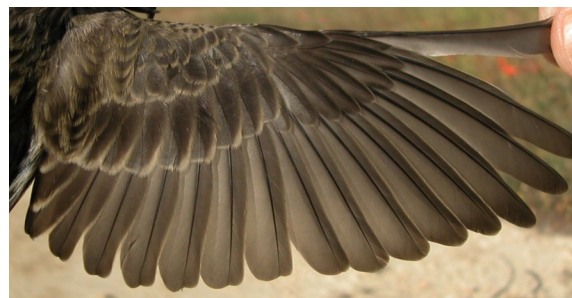
Red Crossbill. Juvenile: pattern of wing (24-V)