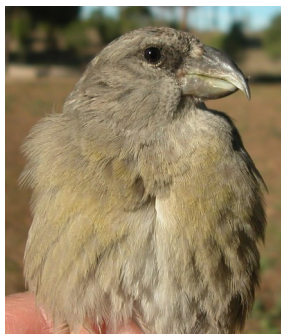
Red Crossbill. Adult. Breast pattern: left male (19-XI); right female (17-XII).