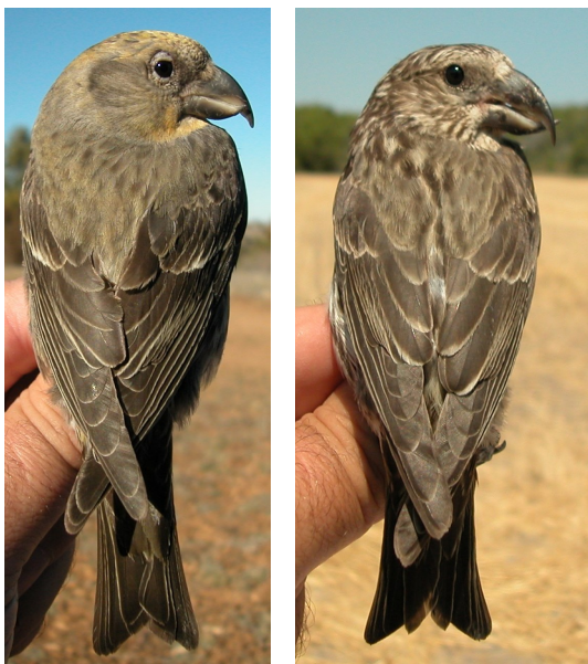
Red Crossbill. Ageing. Pattern of upperparts: left adult female; right juvenile.