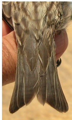
Red Crossbill. Tail pattern: top left 1st year male (19-XI); top right 2nd year female (13-V); left juvenile (17-VII).