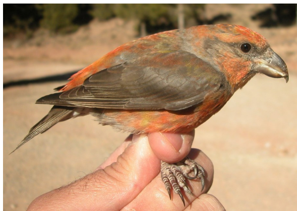
Red Crossbill. Adult. Male (19-XI).