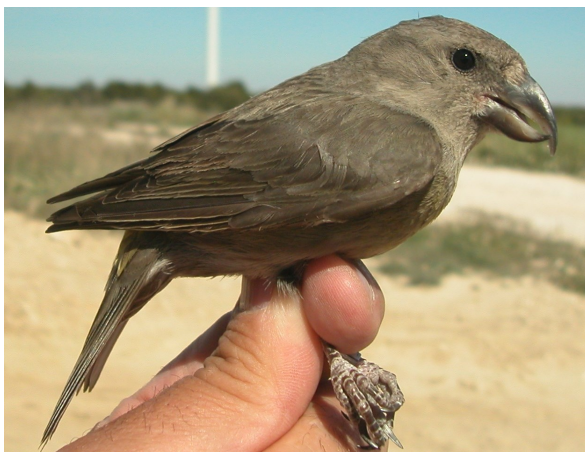
Red Crossbill. 2nd year. Female (13-V).