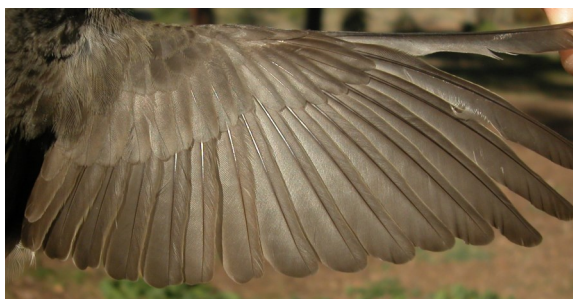
Red Crossbill. Adult. Female: pattern of wing (17-XII).