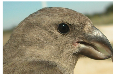
Red Crossbill. Head pattern: top 1st year male (19-XI); middle 2nd year female (13-V); bottom juvenile (17-VII).