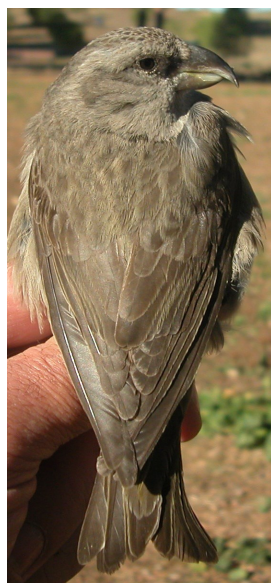
Red Crossbill. Adult. Upperparts pattern: left male (19-XI); right female (17-XII).