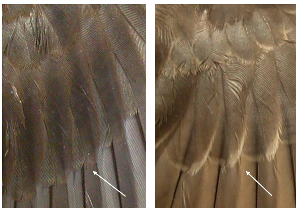
Red Crossbill. Ageing. Pattern of tips of greater coverts: left adult; right juvenile.