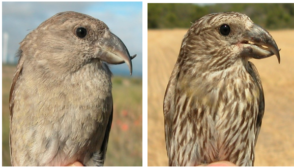
Red Crossbill. Ageing. Pattern of breast: left adult female; right juvenile.