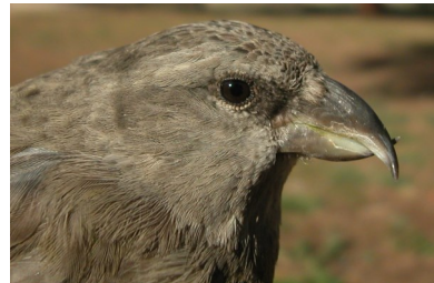
Red Crossbill. Adult. Head pattern: top male (19-XI); bottom female (17-XII).