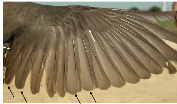
Red Crossbill. 2nd year. Female: pattern of wing (13-V).