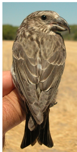
Red Crossbill. Upperparts pattern: top left 1st year male (19-XI); top right 2nd year female (13-V); left juvenile (17-VII).