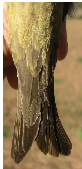
Red Crossbill. Adult. Tail pattern: left male (19-XI); right female (17-XII).