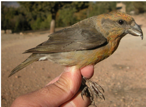
Red Crossbill. 1st year. Male (19-XI).