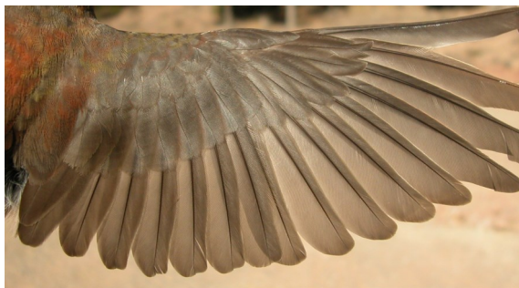
Red Crossbill. Adult. Male: pattern of wing (19-XI).