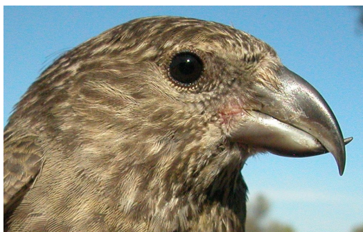
Red Crossbill. Pattern of bill.

16-17 cm. Strong head and curved bill. Male reddish; female yellowish green. Juveniles greyish with dark streaks.