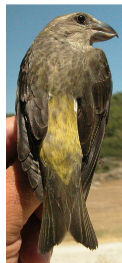
Red Crossbill. Sexing. Pattern of upperparts: left male; right female.