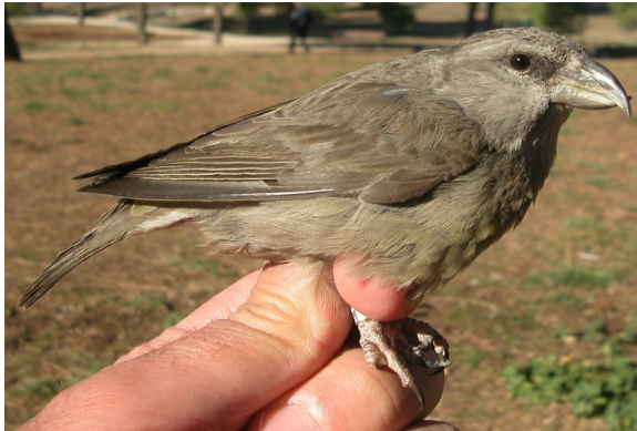
Red Crossbill. Adult. Female (17-XII).