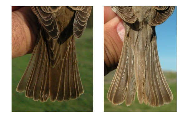
Tree Sparrow. Pattern and wear of tail: left in winter (25-X); right in spring (06-V).