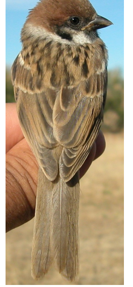
Tree Sparrow. Ageing. Wear of plumage: left adult; right juvenile.