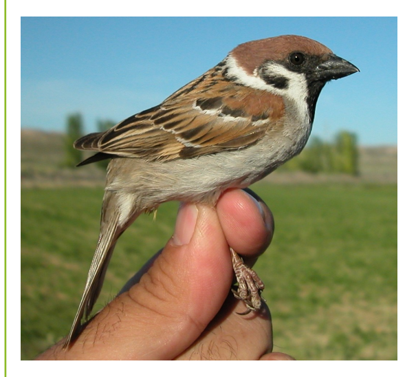
Tree Sparrow. Spring (06-V).