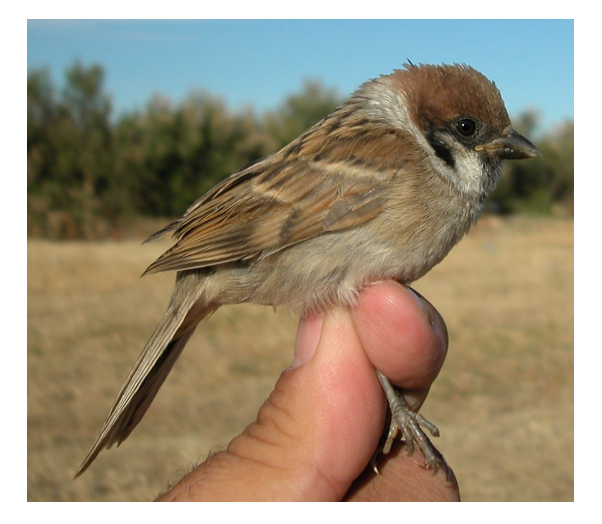
Tree Sparrow. Summer. Juvenile (18-VI).