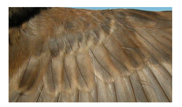
Tree Sparrow. Ageing. Pattern of median and greater coverts: top adult; bottom juvenile.