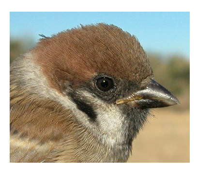
Tree Sparrow. Summer. Head pattern: top adult (03-VII); bottom juvenile (18-VI).