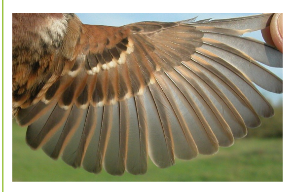
Tree Sparrow. Winter: pattern of wing (25-X).