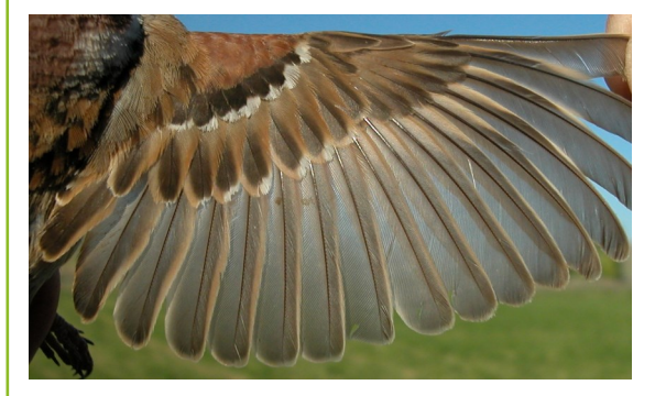
Tree Sparrow. Spring: pattern of wing (06-V).