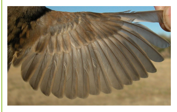
Tree Sparrow. Summer. Juvenile: pattern of wing (29-VII).