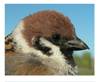
Tree Sparrow. Head pattern: top in winter (25-X); bottom in spring (06-V).