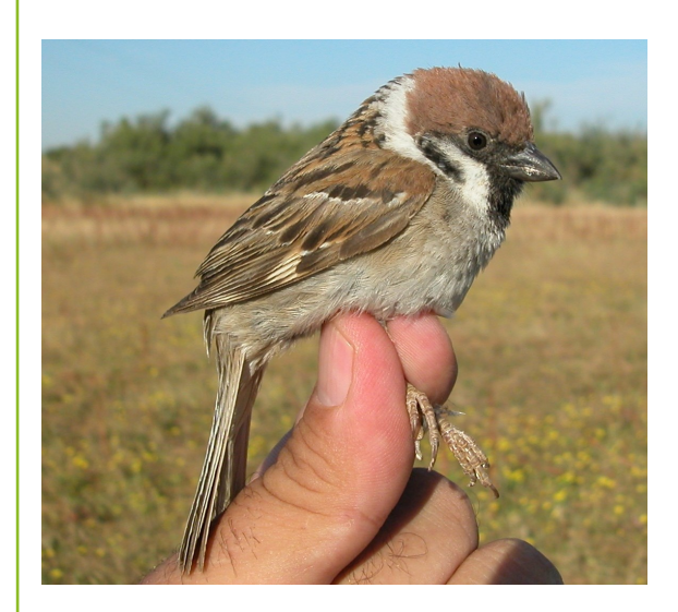
Tree Sparrow. Summer. Adult (03-VII).