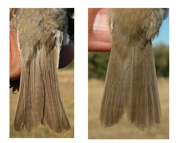
Tree Sparrow. Summer. Pattern and wear of tail: left adult (03-VII); right juvenile (18-VI).