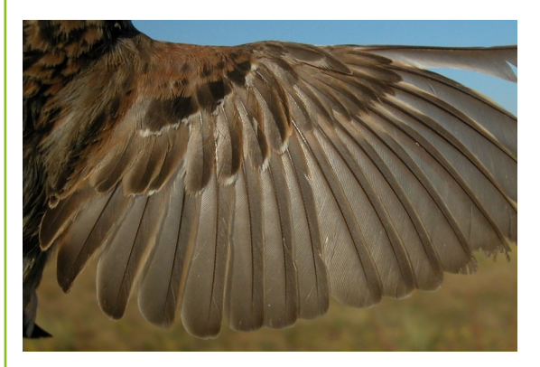
Tree Sparrow. Summer. Adult: pattern of wing (03-VII).