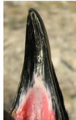
Raven. Inside of upper mandible: left young (29-V); right juvenile (28-VII).