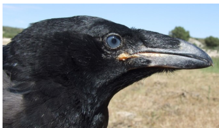
Raven. Iris colour: top juvenile (28-VII); bottom young (29-V).