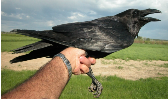
Raven. Adult. 5 de mayo.