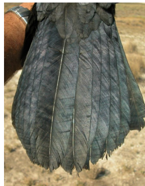
Raven. Tail wear: top left adult (05-V); top right 2nd year (26-III); left juvenile (28-VII).