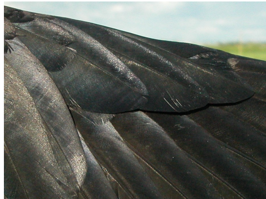
Raven. Adult: pattern of alula (05-V).