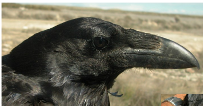
Raven. Pattern of bill and tail.

54-67 cm. Black plumage; wedge-shaped tail; black bill and legs.