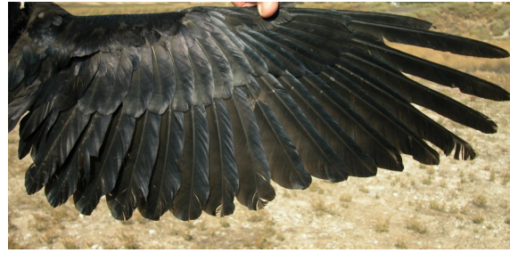
Raven. Juvenile: pattern of wing (28-VII).