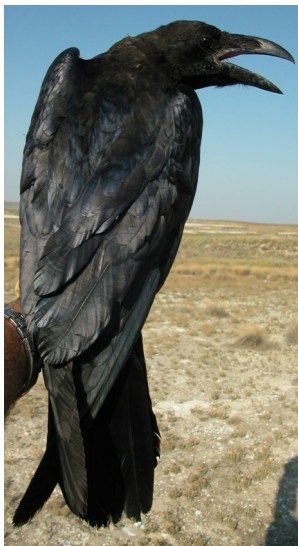
Raven. Upperpart pattern: top left adult (05-V); top right 2nd year (26-III); left juvenile (28-VII).