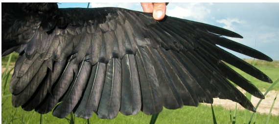
Raven. Adult: pattern of wing (05-V).