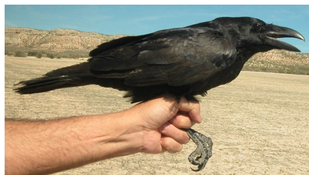
Raven. 2nd year (26-III)