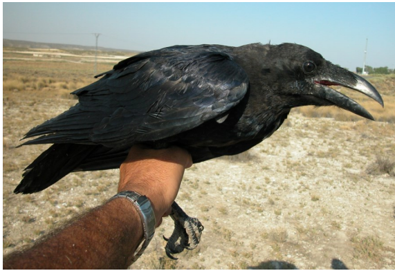
Raven. Juvenile (28-VII)