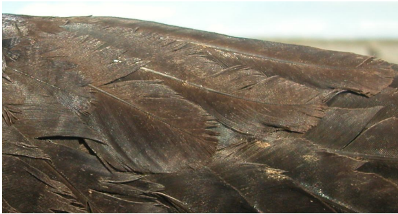
Raven. 2nd year: pattern of alula (26-III).