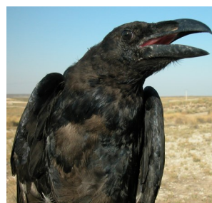
Raven. Breast pattern: top left adult (05-V); top right 2nd year (26-III); left juvenile (28-VII).