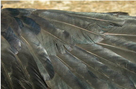
Raven. Juvenile: pattern of alula (28-VII).