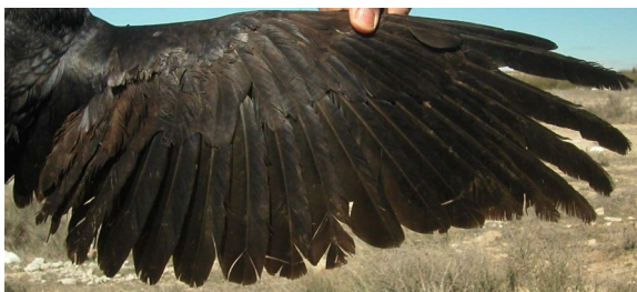
Raven. 2nd year: pattern of wing (26-III).