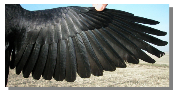
Carrion Crow. Adult: pattern of wing (20-X).