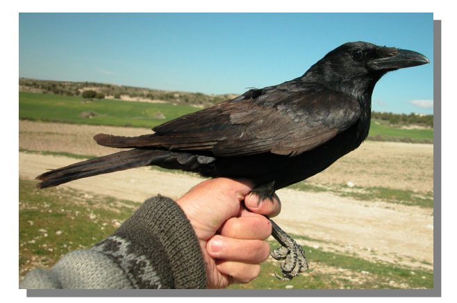
Carrion Crow. 2nd year (30-III)