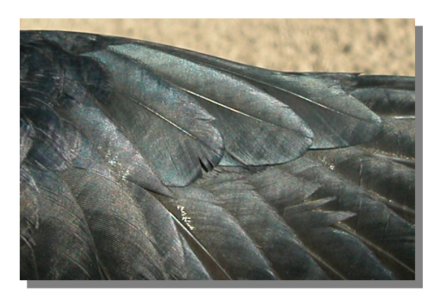
Carrion Crow. Adult: pattern of alula (20-X).