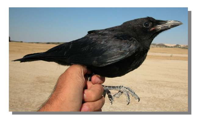
Carrion Crow. Juvenile (18-VI)