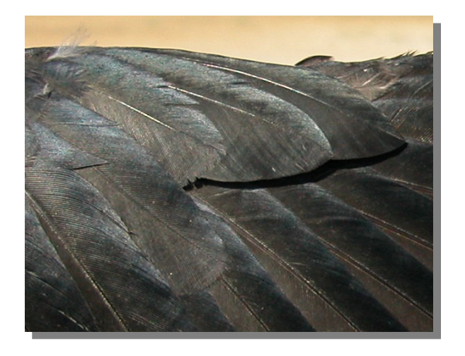
Carrion Crow. Juvenile: pattern of alula (18-VI).