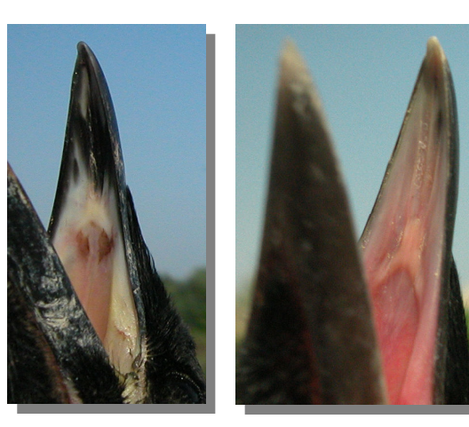
Carrion Crow. Inside of upper mandible: left juvenile (18-VI); right young (12-VI).