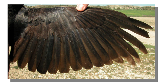
Carrion Crow. 2nd year: pattern of wing (30-III).