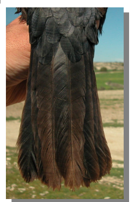
Carrion Crow. Tail pattern: top left adult (31-III); top right 2nd year (30-III); left juvenile (18-VI).