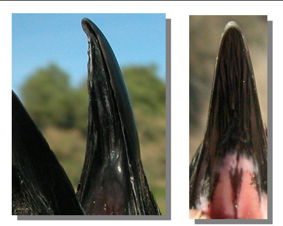
Carrion Crow. Inside of upper mandible: left adult (22-V); right 2nd year (18-II)