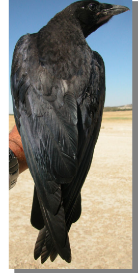
Carrion Crow. Upperpart pattern: top left adult (31-III); top right 2nd year (30-III); left juvenile (18-VI).