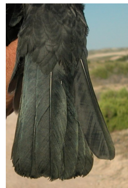
Jackdaw. Tail wear and pattern of the outermost tail feather: top left adult (28-V); top right 2nd year (11-III); left juvenile (28-VI).