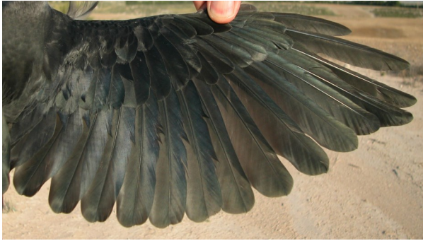
Jackdaw. Juvenile: pattern of wing (28-VI).