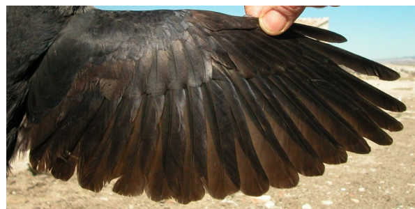
Jackdaw. 2nd year: pattern of wing (11-III).