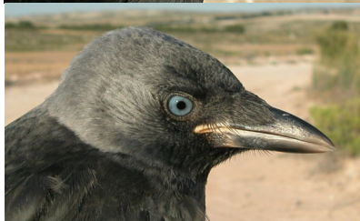
Jackdaw. Head pattern and iris colour: top adult (12-VI); middle 2nd year (11-III); bottom juvenile (28-VI)