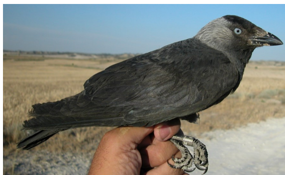
Jackdaw. Adult (28-V).