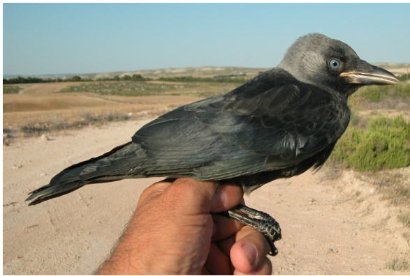
Jackdaw. Juvenile (28-VI).