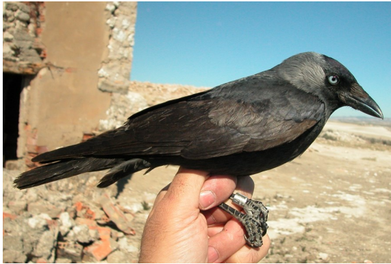
Jackdaw. 2nd year (11-III).