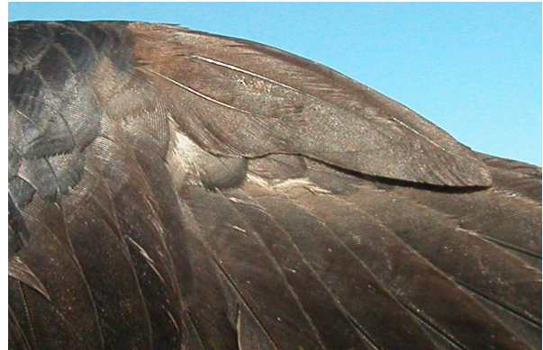
Jackdaw. 2nd year: pattern of alula (11-III).