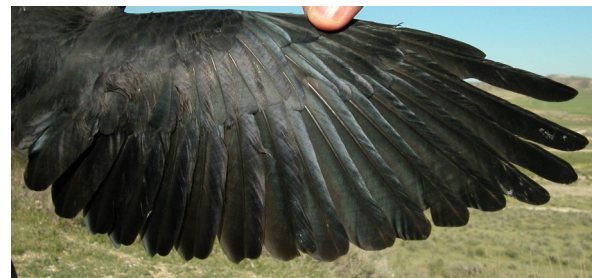
Jackdaw. Adult: pattern of wing (27-IV).