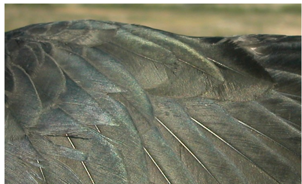
Jackdaw. Juvenile: pattern of alula (28-VI).