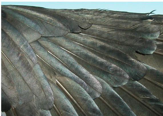
Jackdaw. Adult: pattern of alula (27-IV).