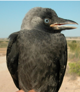
Jackdaw. Breast pattern: top adult (12-VI); middle 2nd year (11-III); bottom juvenile (28-VI)