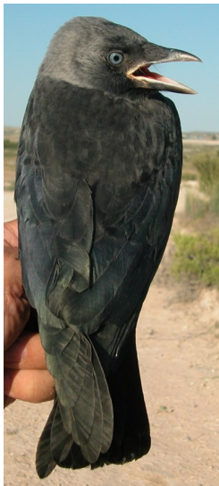
Jackdaw. Upperpart pattern: top left adult (28-V); top right 2nd year (11-III); left juvenile (28-VI)