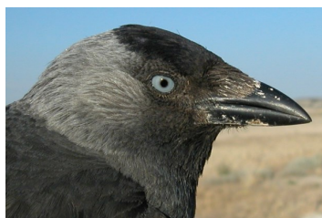
Jackdaw. Pattern of head and neck.

30-31 cm. Black plumage, with grey neck-side and nape; black bill and legs.