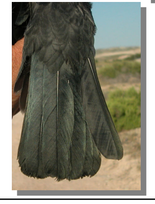
Jackdaw. Tail wear and pattern of the outermost tail feather: top left adult (28-V); top right 2nd year (11-III); left juvenile (28-VI).