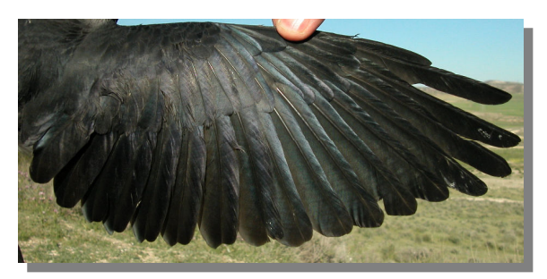
Jackdaw. Adult: pattern of wing (27-IV).