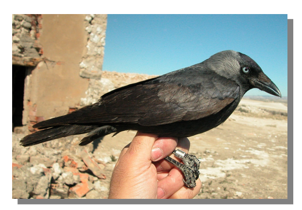
Jackdaw. 2nd year (11-III).