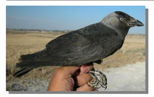
Jackdaw. Adult (28-V).