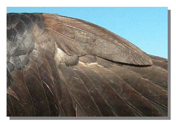
Jackdaw. 2nd year: pattern of alula (11-III).