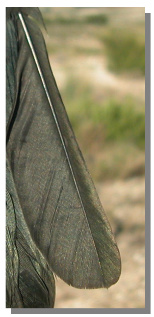
Jackdaw. Ageing. Pattern of tip of the outermost tail feather: left adult; right juvenile.