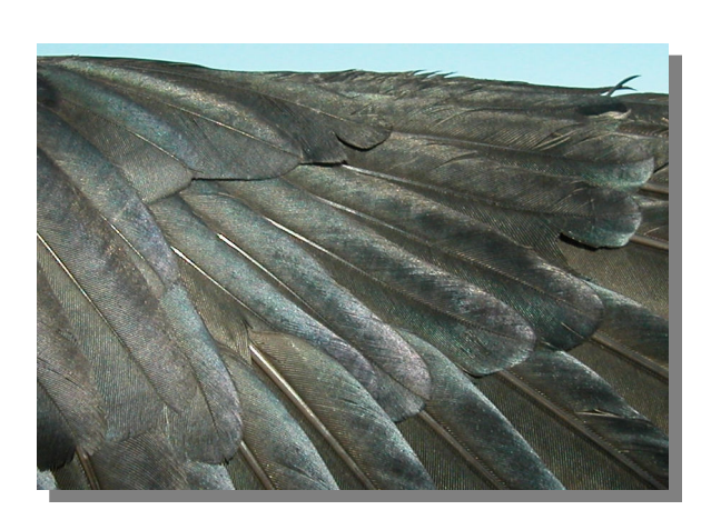
Jackdaw. Adult: pattern of alula (27-IV).