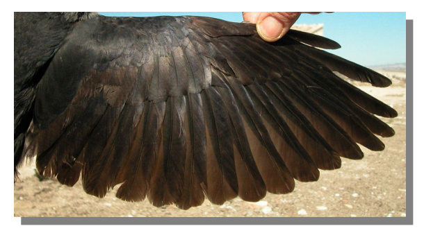
Jackdaw. 2nd year: pattern of wing (11-III).