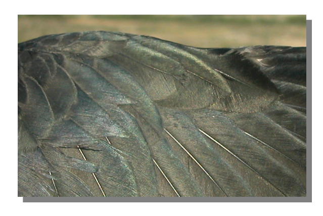
Jackdaw. Juvenile: pattern of alula (28-VI).