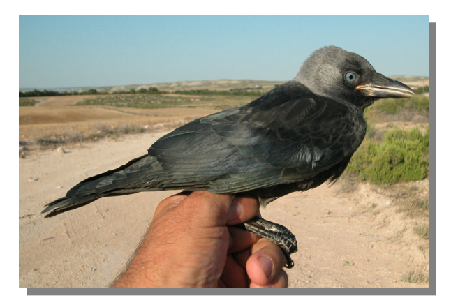
Jackdaw. Juvenile (28-VI).