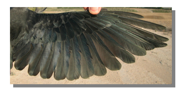
Jackdaw. Juvenile: pattern of wing (28-VI).