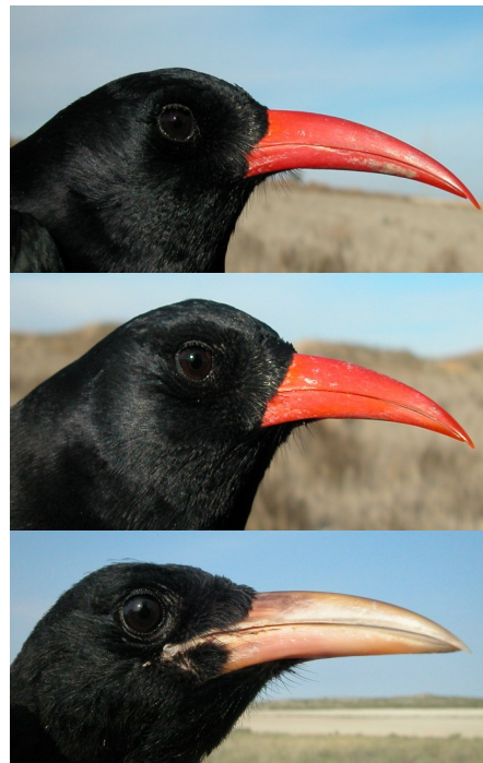
Red-billed Cough. Length and colour of bill: top adult male (06-I); middle adult female (06-I); bottom juvenile (18-VI)