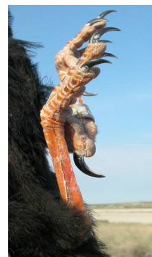
Red-billed Chough. Legs colour: left adult (06-I); right juvenile (18-VI).