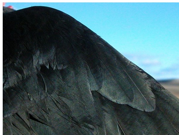
Red-billed Chough. Adult: pattern of alula (18-II).