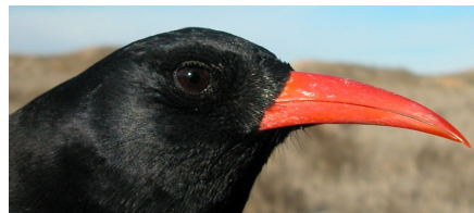
Red-billed Chough. Sexing. Adult. Length of bill: top male; bottom female.