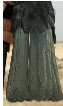
Red-billed Chough. Tail wear: top left adult (18-II); top right 2nd year (06-I); left juvenile (18-VI).