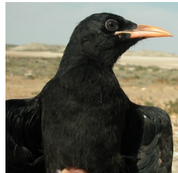
Red-billed Chough. Breast pattern: top left adult (06-I); top right 2nd year (06-I); left juvenile (18-VI).