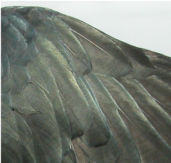
Red-billed Chough. Juvenile: pattern of alula (18-VI).