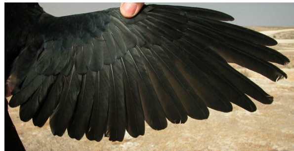
Red-billed Chough. Juvenile: pattern of wing (18-VI).