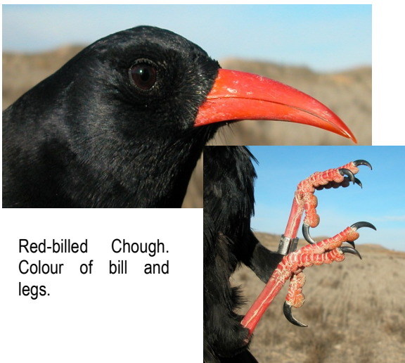
Red-billed Chough. Colour of bill and legs.

36-42 cm. Glossy black plumage; pointed and decurved bill; red bill and legs.