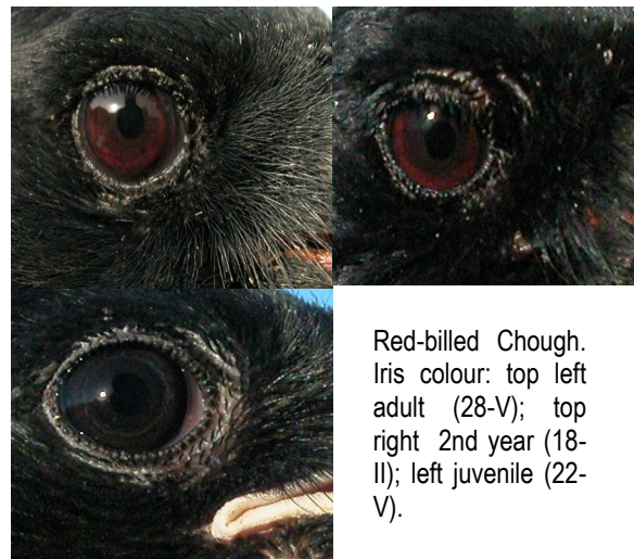
Red-billed Cough. Iris colour: top left adult (28-V); top right 2nd year (18-II); left juvenile (22-V).