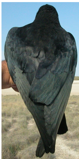
Red-billed Chough. Upperpart pattern: top left adult (06-I); top right 2nd year (06-I); left juvenile (18-VI).