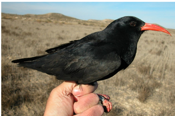
Red-billed Cough. 2nd year (06-I).