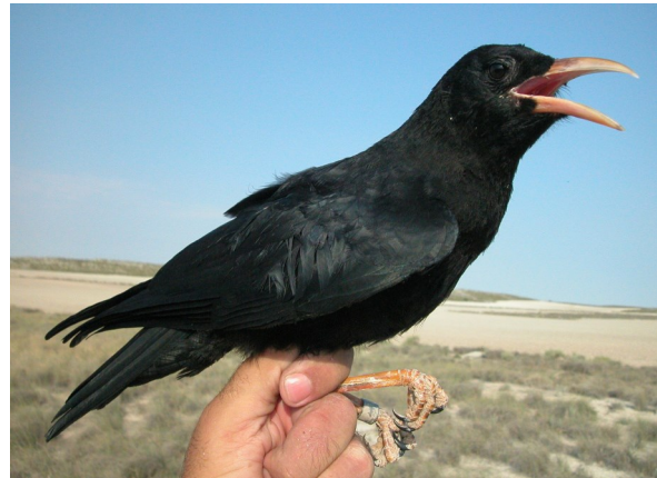
Red-billed Cough. Juvenile (18-VI).