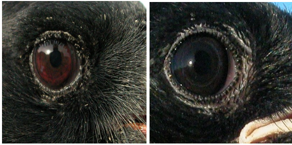
Red-billed Cough. Ageing. Colour of iris: left adult; right juvenile.