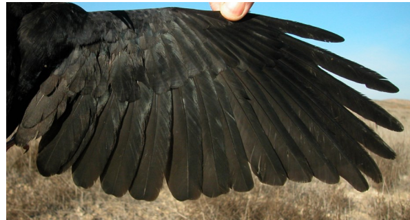
Red-billed Chough. 2nd year: pattern of wing (18-II).