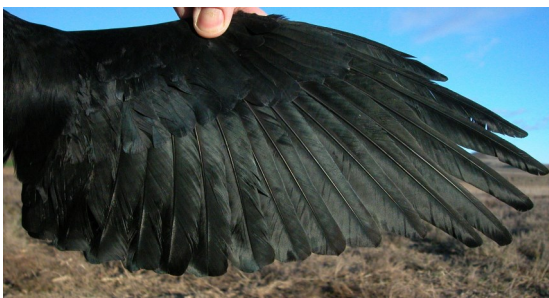
Red-billed Chough. Adult: pattern of wing (18-II).