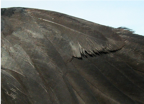
Red-billed Chough. 2nd year: pattern of alula (18-II).