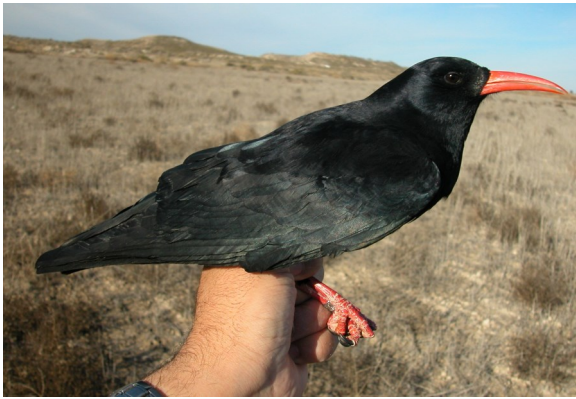
Red-billed Chough. Adult (06-l).