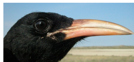
Red-billed Chough. Ageing. Colour of bill: top adult; bottom juvenile.