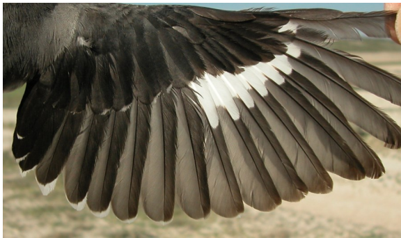
Southern Grey Shrike. Spring. Adult. Female: pattern of wing (22-V).