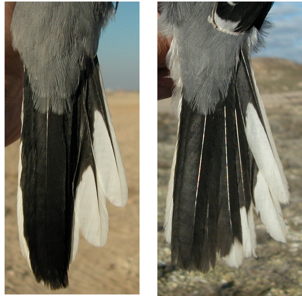
Southern Grey Shrike. Winter. 1st year. Tail pattern: left male (23-XII); right female (04-XII).