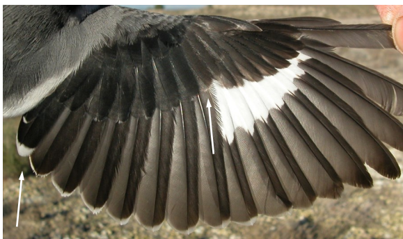
Southern Grey Shrike. Winter. 1st year. Female: pattern of wing (04-XII).