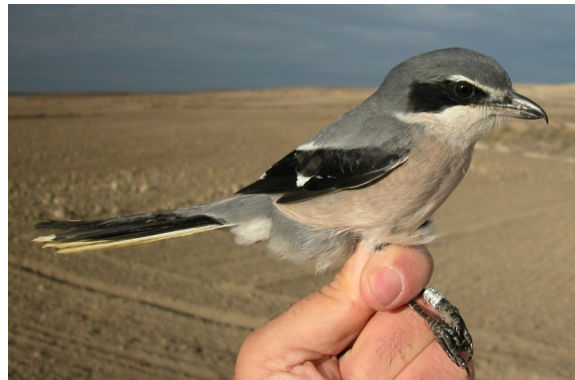
Southern Grey Shrike. Winter. Adult. Female (05-XII).