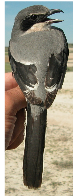
Southern Grey Shrike. Spring. Adult. Upperpart pattern: left male (22-V); right female (22-V).