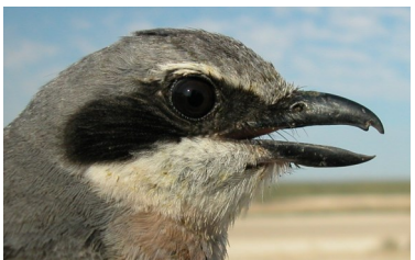
Southern Grey Shrike. Spring. Head pattern: top 2nd year male (04-VI); middle 2nd year female (07-V); bottom juvenile (20-VIII).