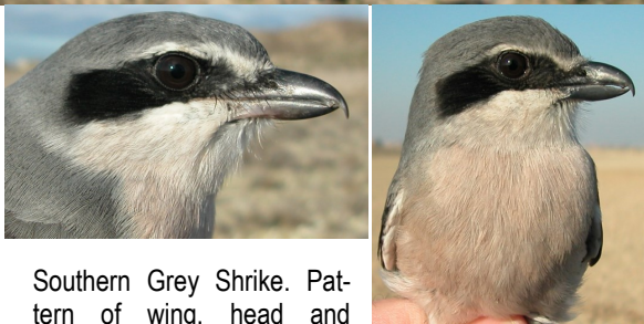
Southern Grey Shrike. Pattern of wing, head and breast.