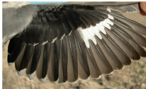
Southern Grey Shrike. Winter. Adult. Male: pattern of wing (23-XII).