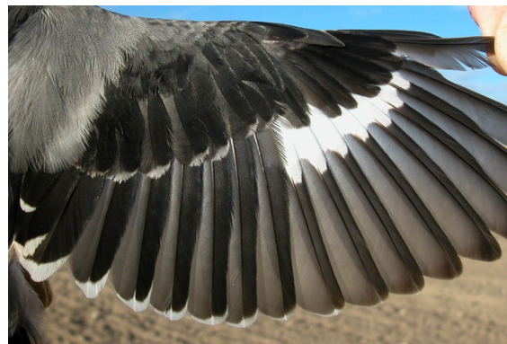
Southern Grey Shrike. Winter. Adult. Female: pattern of wing (25-XI).