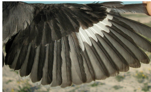
Southern Grey Shrike. Spring. Adult. Male: pattern of wing (22-V).