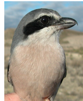
Southern Grey Shrike. Winter. 1st year. Breast pattern: left male (25-XI); right female (04-XII).