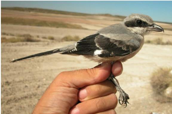
Southern Grey Shrike. Spring. Juvenile (20-VIII)