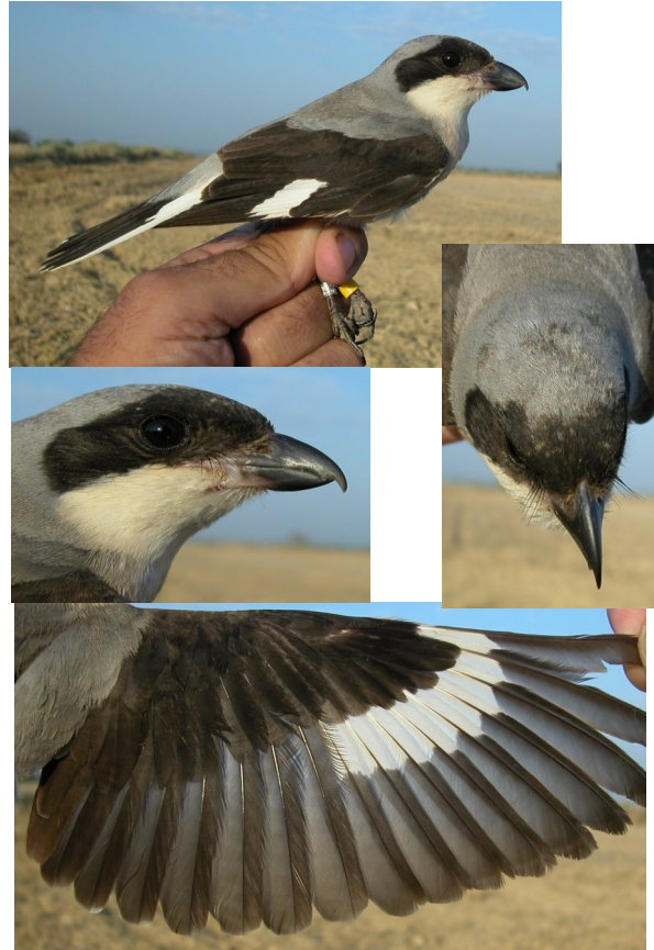
Lesser Grey Shrike: pattern of head, crown and wing

Lesser Grey Shrike is similar, but with smaller size; bigger white patch on wing; without white supercilium and broader black band on forehead.