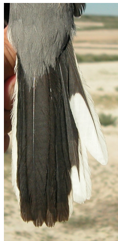
Southern Grey Shrike. Spring. Adult. Tail pattern: left male (22-V); right female (22-V).