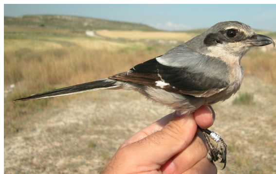
Southern Grey Shrike. Spring. 2nd year. Female (07-V)