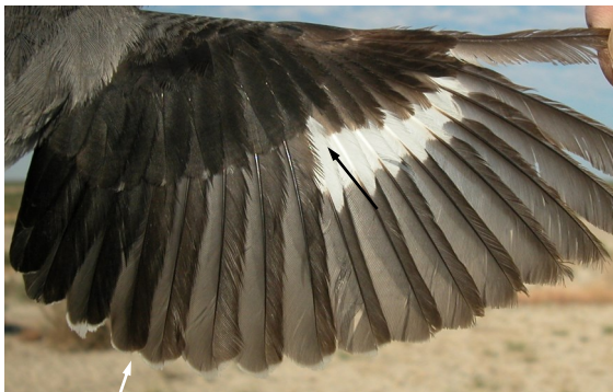
Southern Grey Shrike. Spring. 2nd year. Male: pattern of wing (04-VI).