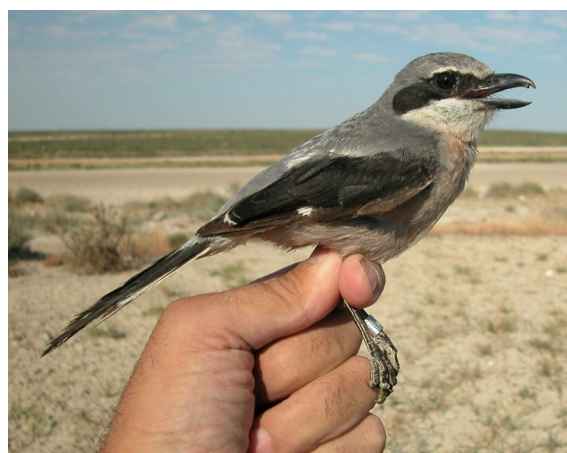
Southern Grey Shrike. Spring. 2nd year. Male (04-VI)