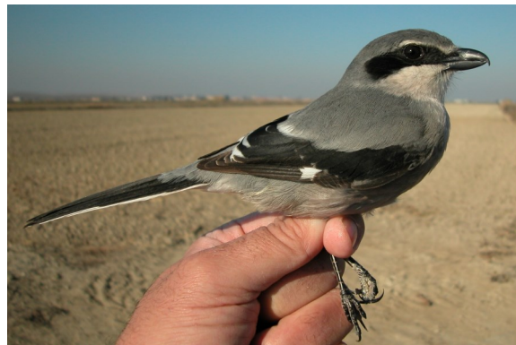
Southern Grey Shrike. Winter. 1st year. Male (25-XI).