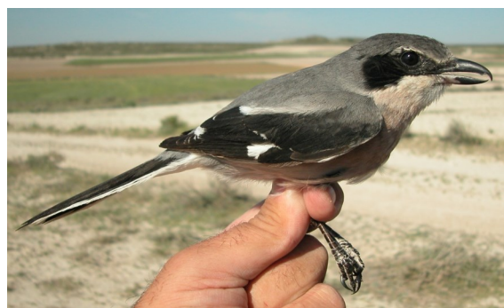
Southern Grey Shrike. Spring. Adult. Female (22-V)

■ Summer visitor ■ Resident ■ Wintering ■ On passage