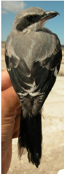
Southern Grey Shrike. Spring. Upperpart pattern: top left 2nd year male (04-VI); top right 2nd year female (07-V); left juvenile (20-VIII).