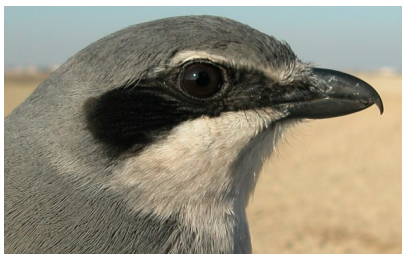
Southern Grey Shrike. Winter. 1st year. Head pattern: top male (25-XI); bottom female (04-XII).