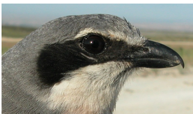
Southern Grey Shrike. Spring. Adult. Head pattern: top male (22-V); bottom female (22-V).