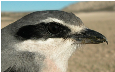
Southern Grey Shrike. Winter. Adult. Head pattern: top male (23-XII); bottom female (05-XII).