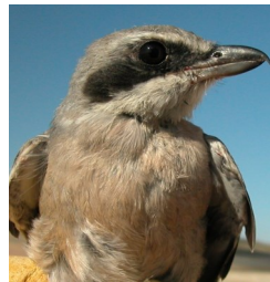
Southern Grey Shrike. Spring. Breast pattern: top left 2nd year male (04-VI); top right 2nd year female (07-V); left juvenile (20-VIII).