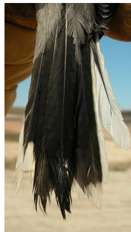
Southern Grey Shrike. Spring. Tail pattern: top left 2nd year male (04-VI); top right 2nd year female (07-V); left juvenile (20-VIII).