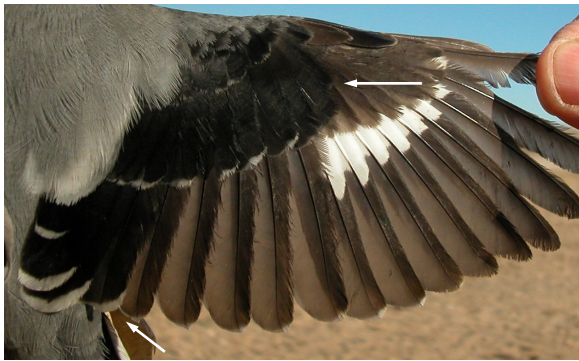
Southern Grey Shrike. Winter. 1st year. Male: pattern of wing (25-XI).