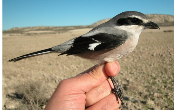
Southern Grey Shrike. Winter. Adult. Male (23-XII).