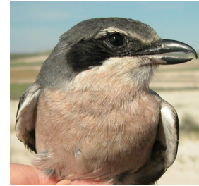
Southern Grey Shrike. Spring. Adult. Breast pattern: left male (22-V); right female (22-V).