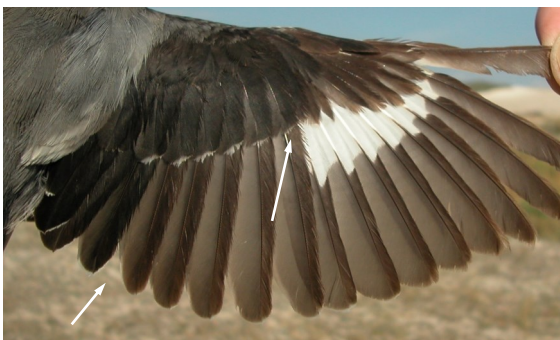
Southern Grey Shrike. Spring. 2nd year. Female: pattern of wing (07-V).