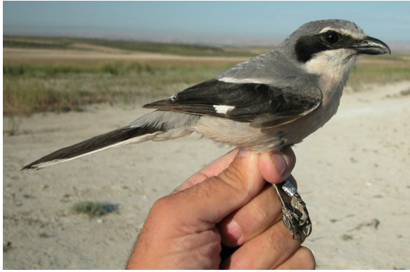
Southern Grey Shrike. Spring. Adult. Male (22-V).