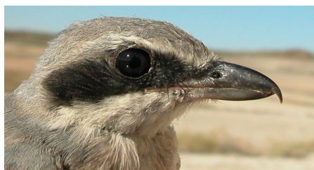
Southern Grey Shrike. Ageing. Pattern of head: top adult male; bottom juvenile.