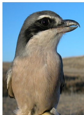
Southern Grey Shrike. Winter. Adult. Breast pattern: left male (23-XII); right female (05-XII).