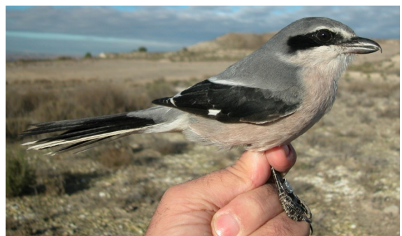
Southern Grey Shrike. Winter. 1st year. Female (04-XII).