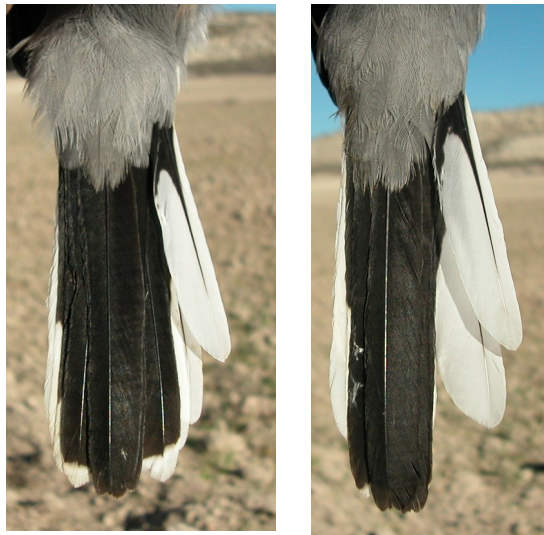
Southern Grey Shrike. Winter. Adult. Tail pattern: left male (23-XII); right female (05-XII).