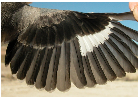
Southern Grey Shrike. Spring. Juvenile: pattern of wing (20-VIII).