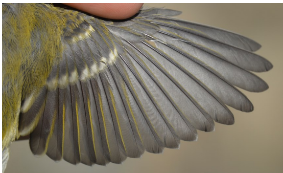
Yellow-browed Warbler. Autumn. Adult: pattern of wing (11-X)