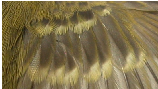
Yellow-browed Warbler. Autumn. Ageing. Pattern of wing coverts: top adult; bottom 1st year.