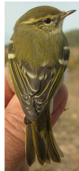
Yellow-browed Warbler. Autumn. Ageing. Upperpart pattern: left adult; right 1st year