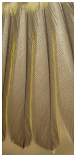
Yellow-browed Warbler. Autumn. Ageing. Pattern of secondaries: left adult; right 1st year.