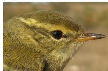
Yellow-browed Warbler. Autumn. Head pattern: top adult (11-X); bottom 1st year (28-X).