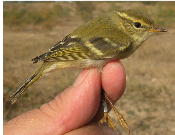
Yellow-browed Warbler. Autumn. 1st year (28-X).