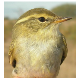
Yellow-browed Warbler. Autumn. Breast pattern: left adult (18-I); right 1st year (28-X).