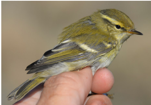
Yellow-browed Warbler. Autumn. Adult (11-X)