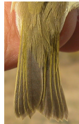
Yellow-browed Warbler. Autumn. Ageing. Tail pattern: left adult; right 1st year.