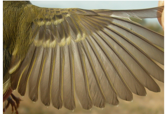
Yellow-browed Warbler. Autumn. 1st year: pattern of wing (28-X).