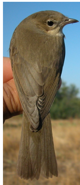
Garden Warbler. Pattern and wear of upperparts: top left in spring (18-V); top right adult in autumn (31-VIII); left juvenile (13-VIII).