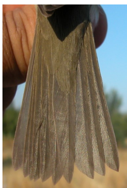
Garden Warbler. Tail pattern: top left in spring (02-V); top right adult in autumn (31-VIII); left juvenile (13-VIII).