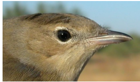
Garden Warbler. Head pattern and iris colour: top left in spring (02-V); top right adult in autumn (31-VIII); left juvenile (13-VIII).