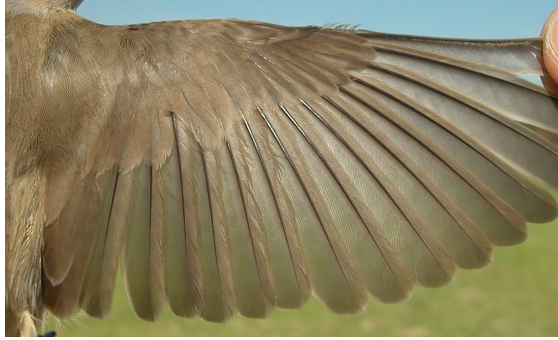
Garden Warbler. Spring: pattern of wing (02-V).