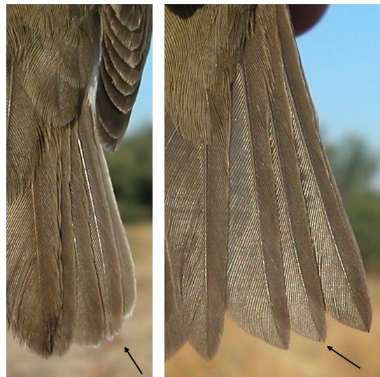
Garden Warbler. Autumn. Ageing. Pattern of tips of tail feathers: left adult; right juvenile.

In spring , after prebreeding moult, ageing is not possible using plumage pattern.