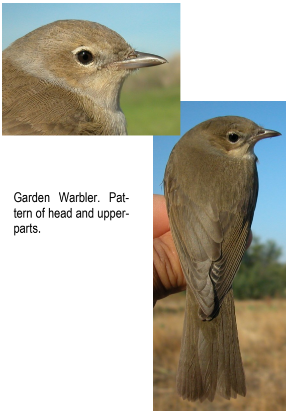
Garden Warbler. Pattern of head and upperparts.

13-14 cm. Species with no obvious features, with plumage olive-brown on upperparts and paler on underparts.