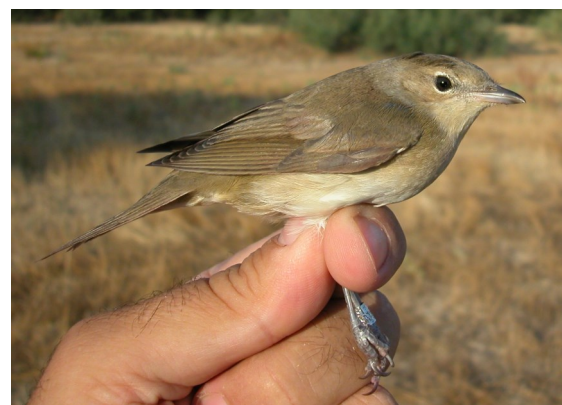
Garden Warbler. Autumn. Juvenile (13-VIII).