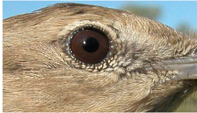
Garden Warbler. Autumn. Ageing. Colour of iris: top adult; bottom juvenile.