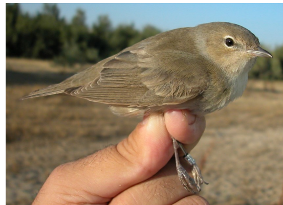
Garden Warbler. Autumn. Adult (31-VIII)

Partial postbreeding and postjuvenile moults, from June to September, including body feathers and a few wing coverts; a few adults start moult of some flight and tail feathers in breeding areas and generally arrest before autumn migration. Both age classes have a complete prebreeding moult in their wintering quarters.