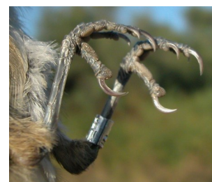
Garden Warbler. Autumn. Legs pattern: left adult (22-V); right juvenile (22-VII).