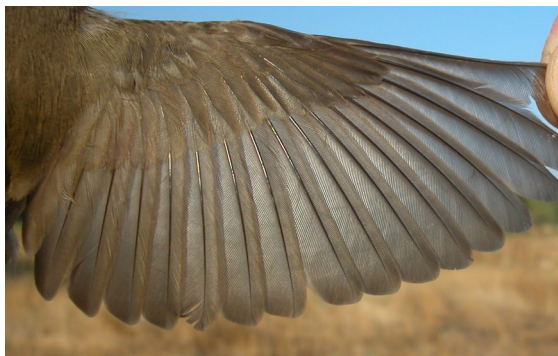
Garden Warbler. Autumn. Juvenile: pattern of wing (13-VIII).