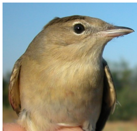
Garden Warbler. Breast pattern: top left in spring (02-V); top right adult in autumn (31-VIII); left juvenile (13-VIII).