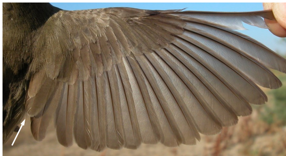
Garden Warbler. Autumn. Adult: pattern of wing (31-VIII).