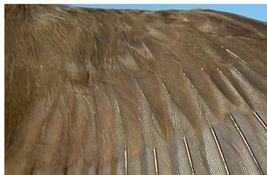
Garden Warbler. Autumn. Ageing. Wear of greater coverts: top adult; bottom juvenile.