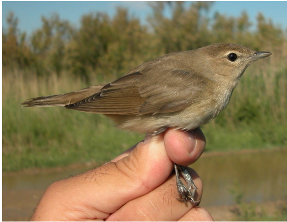
Garden Warbler. Spring (18-V).