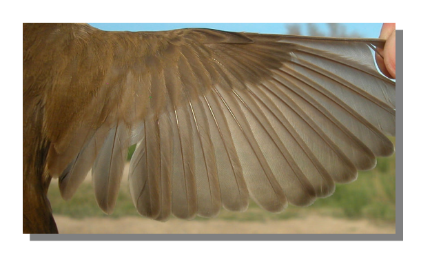
Great Reed Warbler. Spring: pattern of wing (26-IV).