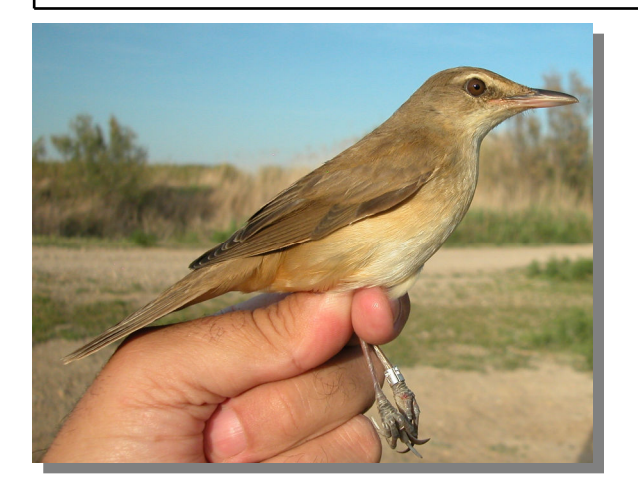
Great Reed Warbler. Spring (26-IV).