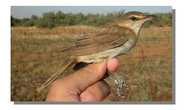
Great Reed Warbler. Autumn. Adult (27-VIII).