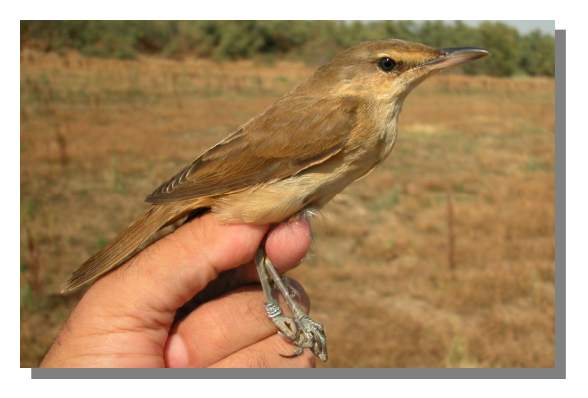
Great Reed Warbler. Autumn. Juvenile (27-VIII).