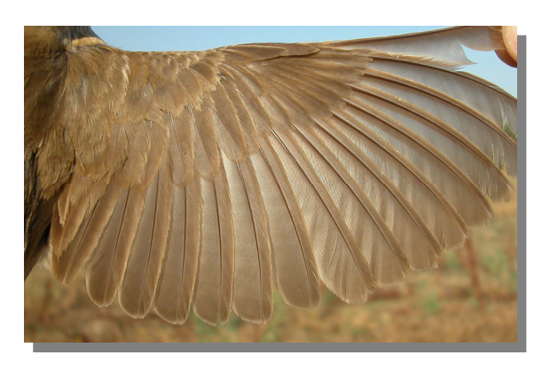
Great Reed Warbler. Autumn. Adult: pattern of wing (27-VIII).