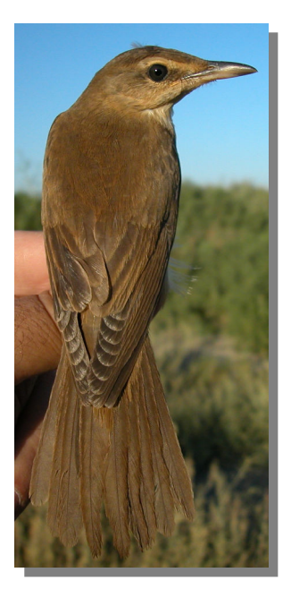
Great Reed Warbler. Upperpart pattern: top left in spring (26-IV); top rigt adult in autumn (27-VIII); left juvenile (31-VIII).