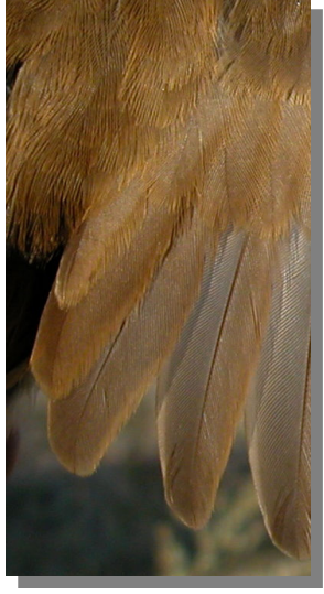
Great Reed Warbler. Ageing. Wear of tertials: left adult; right juvenile.