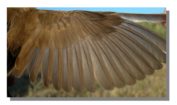
Great Reed Warbler. Autumn. Juvenile: pattern of wing (31-VIII).