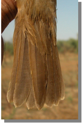
Great Reed Warbler. Tail wear: top left in spring (25-IV); top rigt adult in autumn (27-VIII); left juvenile (27-VIII).