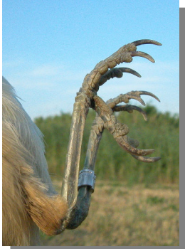
Great Reed Warbler. Legs colour: left adult (28-IV); right juvenile (15-VII).