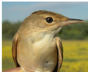
Reed Warbler. Breast pattern: top left in spring (22-IV); top right adult in autumn (28-VIII); left juvenile (25-VII).