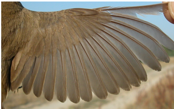
Reed Warbler. Autumn. Adult: pattern of wing (28-VIII).