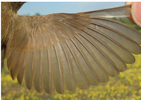
Reed Warbler. Autumn. Juvenile: pattern of wing (25-VII).