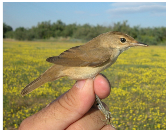
Reed Warbler. Autumn. Juvenile (25-VII).