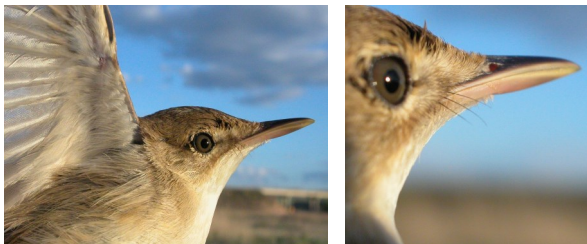
Reed Warbler. Pattern of underwing coverts and bristles near the base of bill.

13-14 cm. Brown plumage, with rufous tinge on rump; whitish underparts with pale throat; brown tail; rusty underwing coverts; pale brown legs; with bristles near the base of bill.