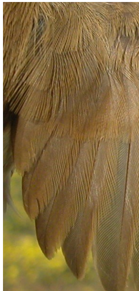
Reed Warbler. Ageing. Wear of tertials: left adult; right juvenile.