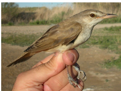
Great Reed Warbler.

Similar to Great Reed Warbler , which is bigger (16-20 mm). Savi's Warbler lacks bristles near the base of bill. Melodious Warbler has yellow underwing coverts.