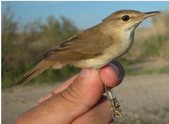
Reed Warbler. Spring (26-IV).