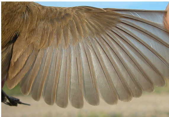
Reed Warbler. Spring: pattern of wing (26-IV).