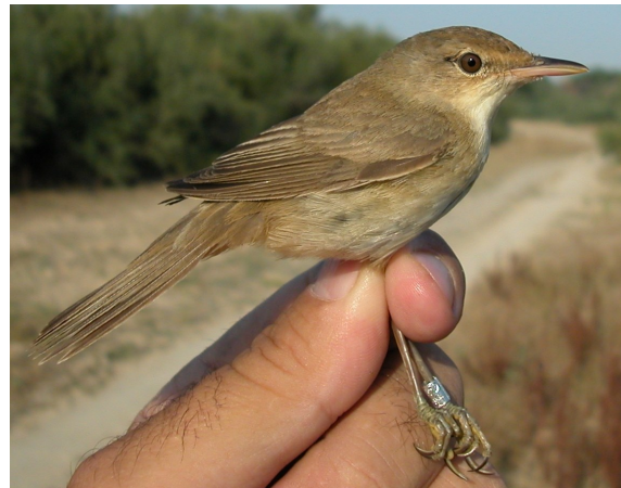
Reed Warbler. Autumn. Adult (28-VIII).