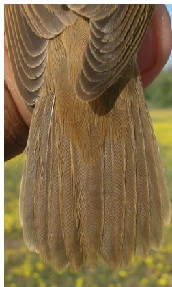
Reed Warbler. Tail wear: top left in spring (26-IV); top right adult in autumn (28-VIII); left juvenile (25-VII).