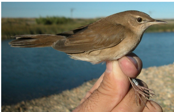
Savi's Warbler. Autumn. Adult with suspended moult (18-IX)