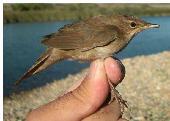
Savi's Warbler. Autumn. 1st year with suspended moult (24-VIII).