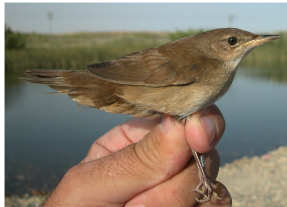
Savi's Warbler. Autumn. 1st year no moulted (06-IX).

Complete postbreeding moult, which can be completed in breeding areas, suspended before migration and finished in wintering quarters or started after migration. Postjuvenile moult either non-existent or variably extensive and then may involve some outer primaries, tertials and greater coverts. Both age classes have in winter a very variable prebreeding moult which can be partial leaving some primaries and primary coverts unmoulted, complete or suspended to be finished during spring migration.