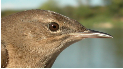
Savi's Warbler. Autumn. Pattern of head, gape flange and iris colour: top adult (05-IX); middle adult (18-IX); bottom 1st year (06-IX).