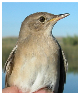
Savi's Warbler. Autumn. 1st year. Breast pattern: left no moulted (06-IX); right with suspended moult (24-VIII).