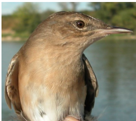
Savi's Warbler. Autumn. Adult. Breast pattern: top left no moulted (07-VII); top right with suspended moult (06-IX); left with completed moult (05-IX).