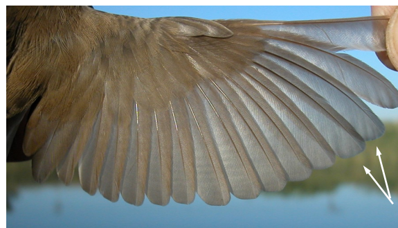
Savi's Warbler. Autumn. 1st year with suspended moult: pattern of wing (24-VIII).