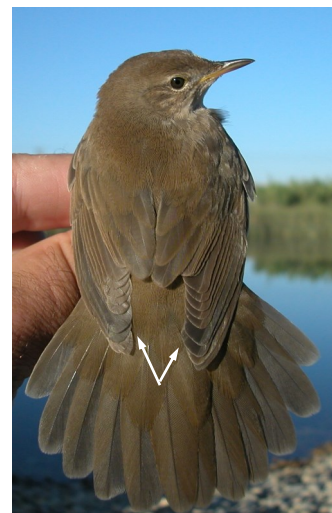
Savi's Warbler. Autumn. 1st year. Upperpart pattern: left no moulted (06-IX); right with suspended moult (24-VIII).