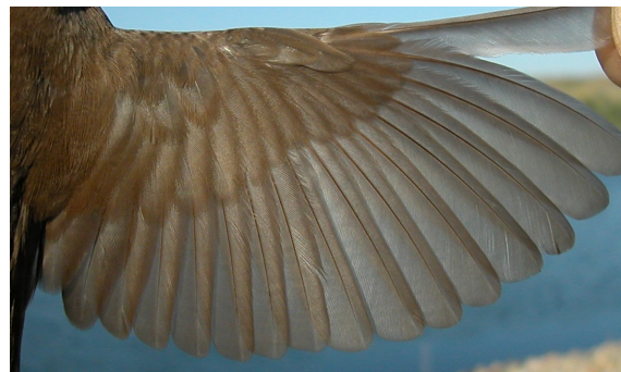
Savi's Warbler. Autumn. 1st year no moulted: pattern of wing (06-IX).