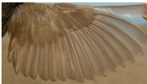
Savi's Warbler. Autumn. Adult no moulted: pattern of wing (07-VII)