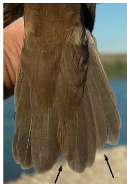
Savi's Warbler. Autumn. 1st year. Tail pattern: left no moulted (06-IX); right with suspended moult (24-VIII).