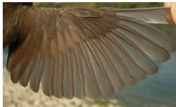
Savi's Warbler. Autumn. Adult with completed moult: pattern of wing (05-IX)