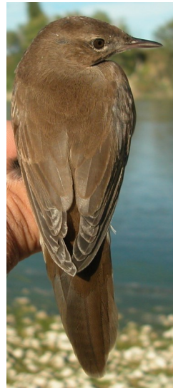
Savi's Warbler. Autumn. Adult. Upperparts pattern: top left no moulted (07-VII); top right with suspended moult (06-IX); left with completed moult (05-IX).