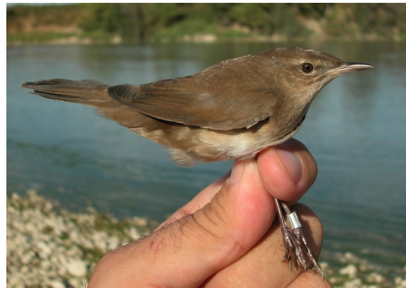
Savi's Warbler. Autumn. Adult with completed moult (05-IX).