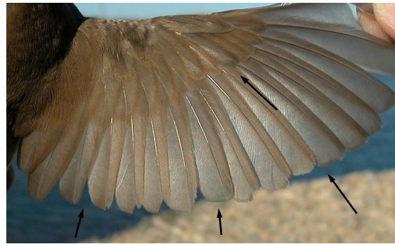
Savi's Warbler. Autumn. Adult with suspended moult: pattern of wing (18-IX)