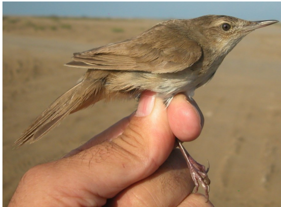
Savi's Warbler. Autumn. Adult no moulted (07-VII)