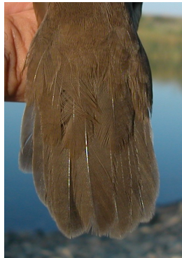
Savi's Warbler. Autumn. Adult. Tail pattern: top left no moulted (07-VII); top right with suspended moult (06-IX); left with completed moult (05-IX).