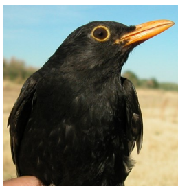
Blackbird. Male: plumage entirely uniform black; yellow eye ring.