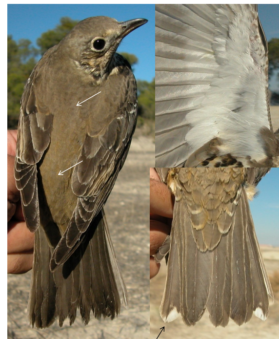
Mistle Thrush: white underwing coverts; outer tail feathers with white tips; brown upperparts.