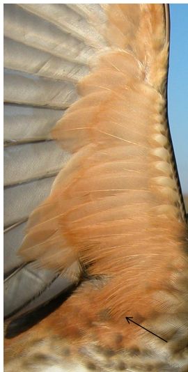
Redwing: with reddish underwing coverts and flanks; well marked supercilium.