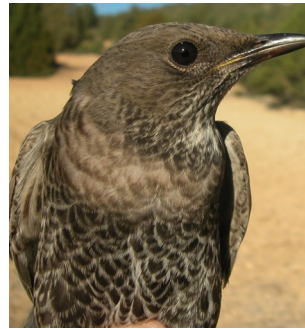
Ring Ouzel: with a pale patch on breast; feathers edged white.