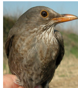
Blackbird. Female: without a pale patch on breast; brownish plumage with little apparent mottling.