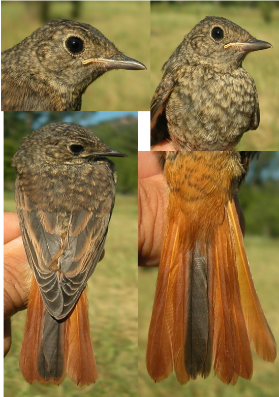
Common Redstart: with spotted plumage; red tail with dark central feathers.