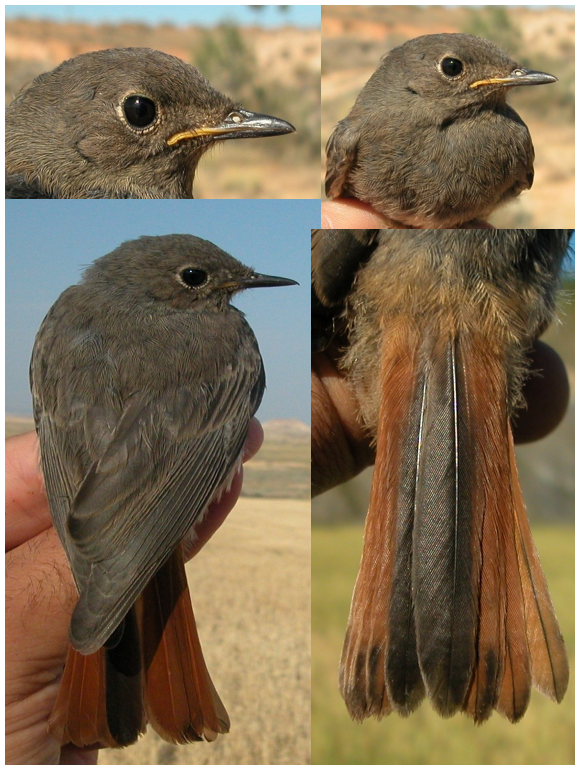
Black Redstart: with plain colour; unspotted plumage; red tail with dark central feathers.