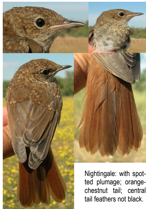
Nightingale: with spotted plumage; orange-chestnut tail; central tail feathers not black.