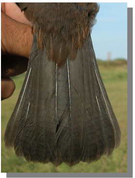
Blackbird. Summer. Juvenile. Tail pattern: left male (17-VI); right female (17-VI).