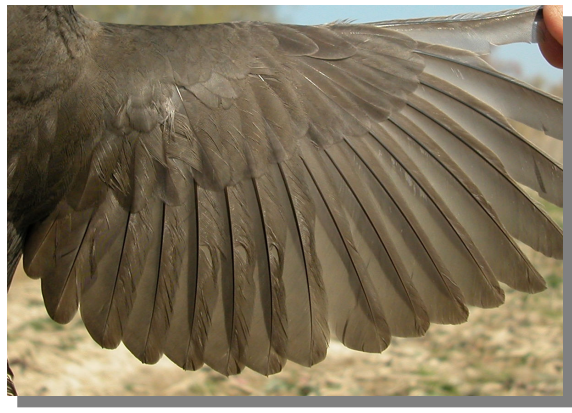
Blackbird. Female: pattern of breast, tail and wing.