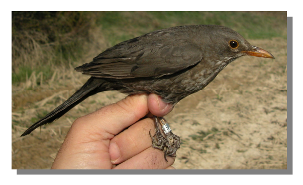
Blackbird. Summer. Adult. Female (09-V).