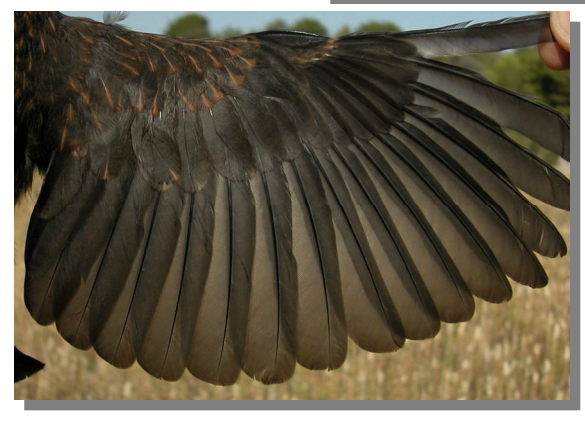
Blackbird. Juvenile: pattern of breast, tail and wing.