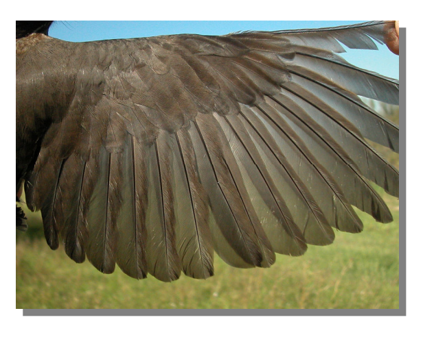
Blackbird. Winter. Adult. Female: pattern of wing (13-X).