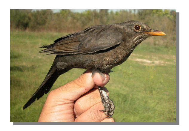
Blackbird. Winter. Adult. Female (13-X).