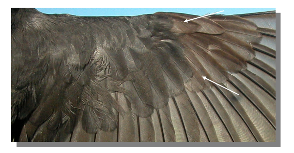
Blackbird. Male. Ageing. Moult limit on wing coverts: top adult; bottom 1st year.