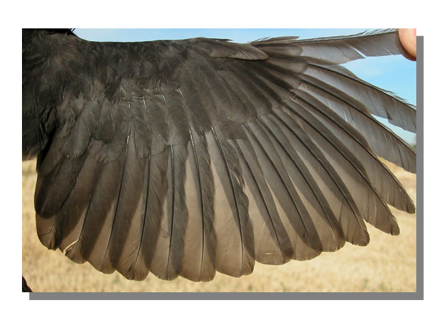
Blackbird. Summer. Adult. Male: pattern of wing (06 -VI).