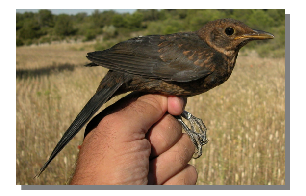
Blackbird. Summer. Juvenile. Male (17-VI).