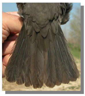
Blackbird. Summer. Adult. Tail pattern: left male (27 -V); right female (09-V).