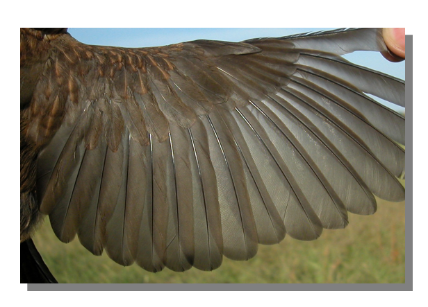
Blackbird. Summer. Juvenile. Female: pattern of wing (17-VI).