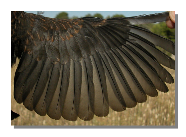
Blackbird. Summer. Juvenile. Male: pattern of wing (17-VI).