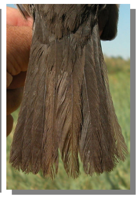
Blackbird. Summer. 2nd year. Tail pattern: left male (27-V); right female (17-VI).