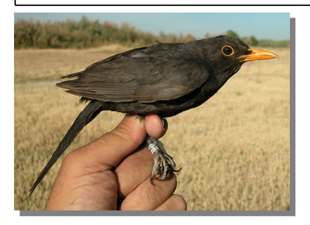
Blackbird. Summer. 2nd year. Male (27-V).