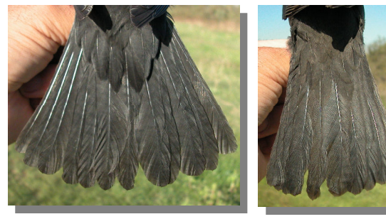
Blackbird. Winter. Adult. Tail pattern: left male (13-X); right female (13-X).