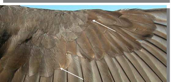
Blackbird. Female. Ageing. Moult limit on wing coverts: top adult; bottom 1st year.