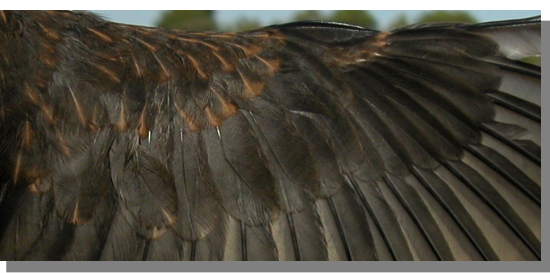
Blackbird. Ageing. Pattern of wing coverts: top adult female; bottom juvenile.