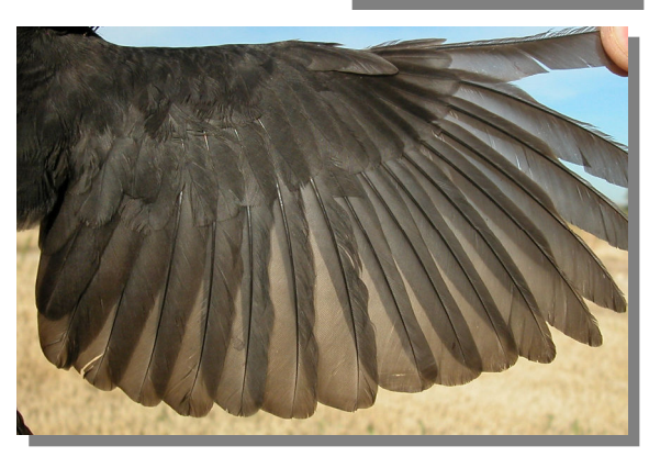
Blackbird. Male: pattern of breast, tail and wing.