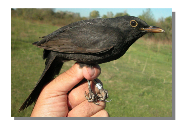
Blackbird. Winter. 1st year. Male (13-X).