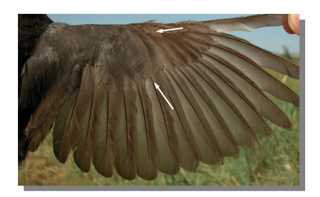
Blackbird. Summer. 2nd year. Female: pattern of wing (17-VI).