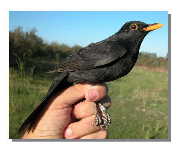
Blackbird. Winter. Adult. Male (13-X).