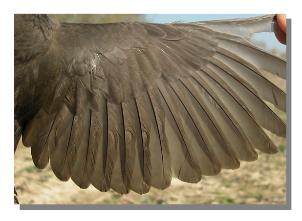
Blackbird. Summer. Adult. Female: pattern of wing (09-V).