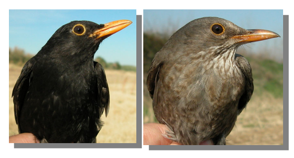
Blackbird. Summer. Adult. Breast pattern: left male (27-V); right female (09-V).