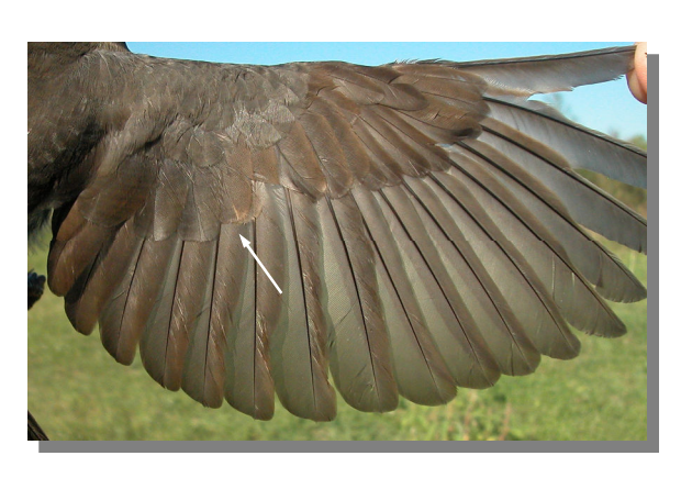
Blackbird. Winter. 1st year. Female: pattern of wing (13-X).