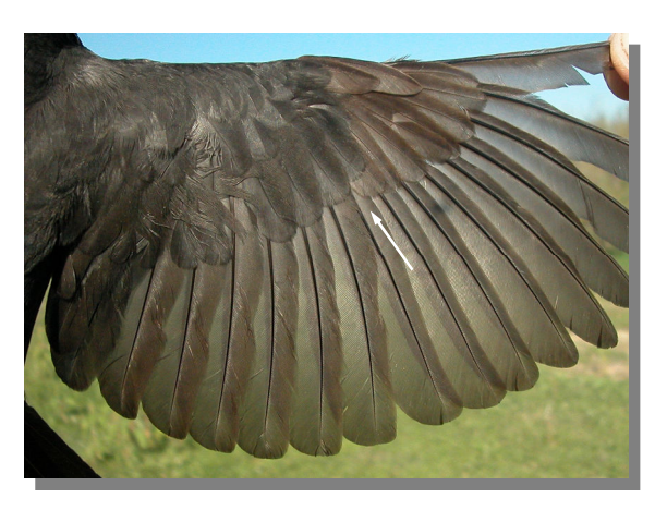
Blackbird. Winter. 1st year. Male: pattern of wing (13-X).