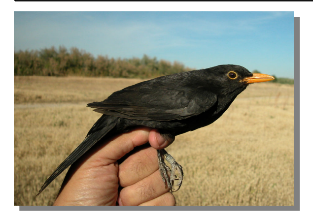
Blackbird. Summer. Adult. Male (27-V).