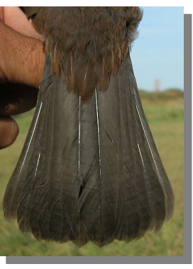
Blackbird. Juvenile. Sexing. Pattern of tail: left male; right female.