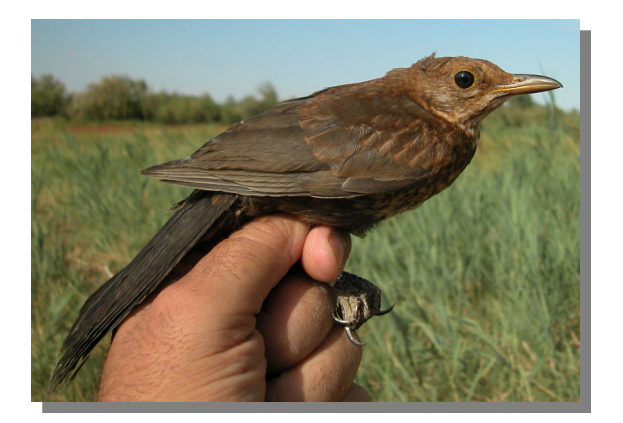
Blackbird. Summer. Juvenile. Female (17-VI).