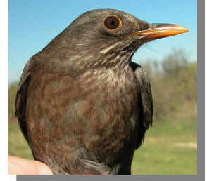
Blackbird. Winter. Adult. Breast pattern: left male (13-X); right female (13-X).