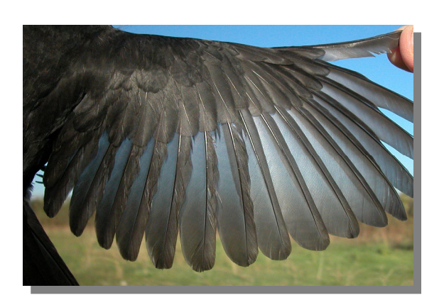
Blackbird. Winter. Adult. Male: pattern of wing (13-X).