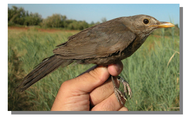
Blackbird. Summer. 2nd year. Female (17-VI).