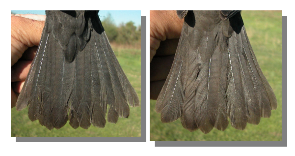
Blackbird. Winter. 1st year. Tail pattern: left male (13-X); right female (13-X).