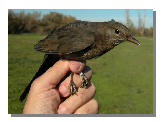
Blackbird. Winter. 1st year. Female (13-X).