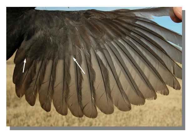
Blackbird. Summer. 2nd year. Male: pattern of wing (27-V).