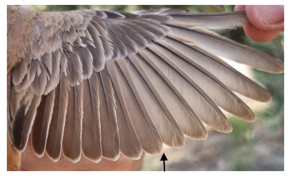
Rufous-tailed Scrub-robin. 2nd year. Wing pattern (09-VII).