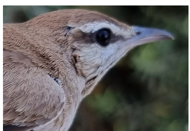
Rufous-tailed Scrub-robin. Head pattern: top adult (09-VII); middle 2nd year (09-VII), bottom juvenile (31-VIII).