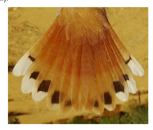
Rufous-tailed Scrub-robin. Juvenile. Tail pattern (31-