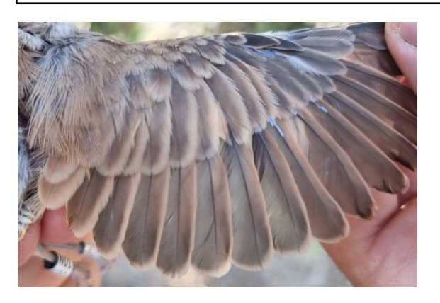
Rufous-tailed Scrub-robin. Juvenile. Wing pattern (09 -VII).