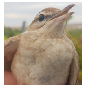
Rufous-tailed Scrub-robin. Breast pattern: left adult (09-VII); right juvenile (31-VIII).