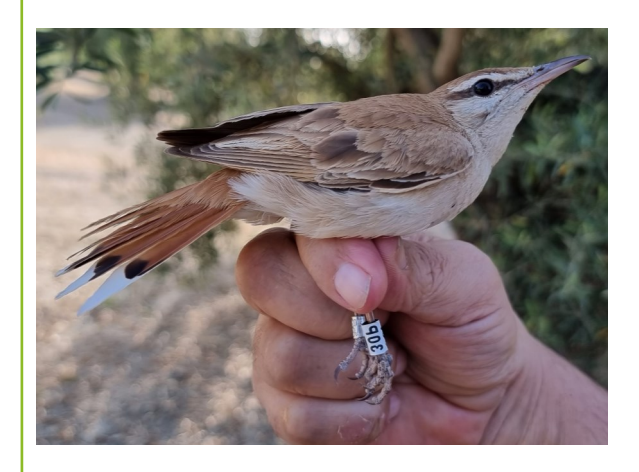
Rufous-tailed Scrub-robin. 2nd year (09-VII).

Complete postbreeding moult usually started on breeding grounds and suspended or started after arrival on wintering sites. Partial postjuvenile moult including body feathers, some or all tertials, none or some inner flight feathers, none or all tail feathers (rarely changed the central pair) and most or all wing coverts; usually started on wintering sites.