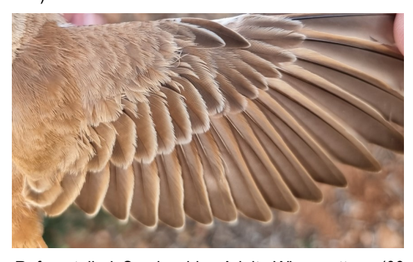
Rufous-tailed Scrub-robin. Adult. Wing pattern (09-VII).