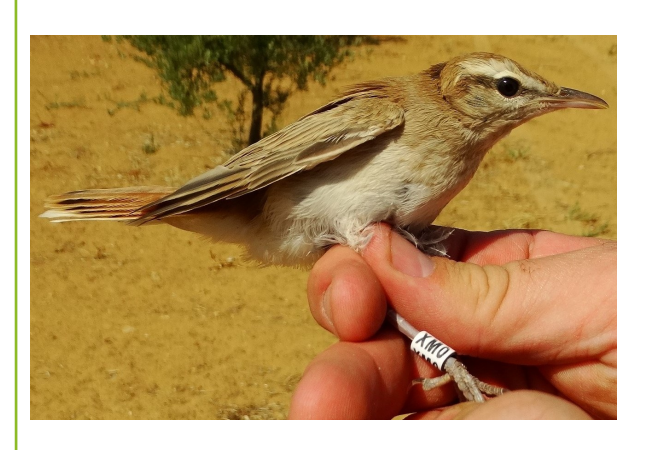
Rufous-tailed Scrub-robin. Juvenile (31-VIII).