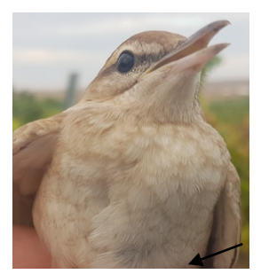
Rufous-tailed Scrub-robin. Ageing. Breast pattern: left adulto; right juvenile.