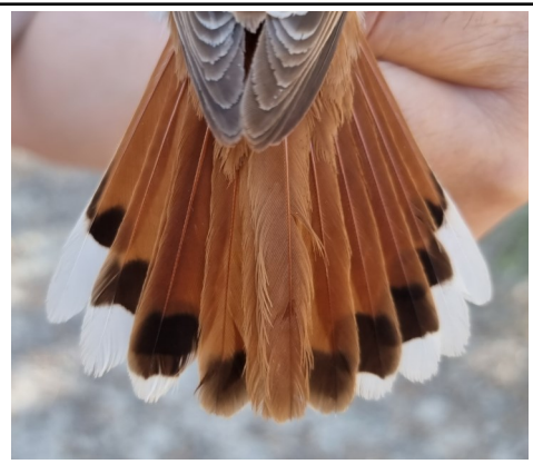
Rufous-tailed Scrub-robin. 2nd year. Tail pattern (09-VII).