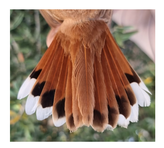
Rufous-tailed Scrub-robin. Adult. Tail pattern (09-VII).