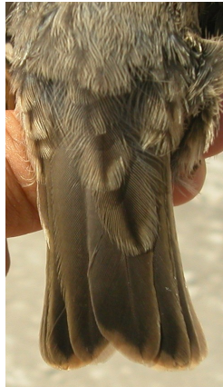
Alpine Accentor. Tail pattern: top left adult (22-II); top right 2nd year (06-II); left juvenile (05-VII).