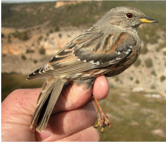
Alpine Accentor. Adult (22-II).