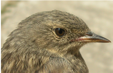
Alpine Accentor. Ageing. Pattern of head and colour of iris: top adult; bottom juvenile