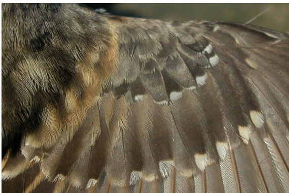
Alpine Accentor. Ageing. Pattern of greater coverts: top adult; bottom 2nd year