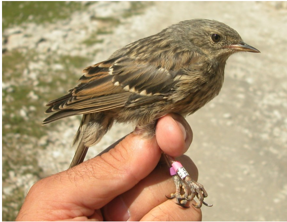
Alpine Accentor. Juvenile (05-VII).