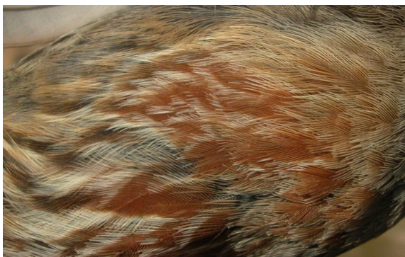
Alpine Accentor. Adult: pattern of flank (22-II)