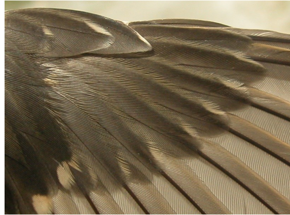
Alpine Accentor. Juvenile: pattern of primary coverts (05-VII).