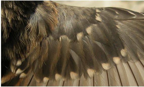
Alpine Accentor. Juvenile: pattern of greater coverts (05-VII).