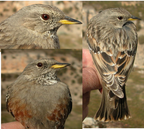
Alpine Accentor. Pattern of head, breast and upperparts.

16-18 cm. Grey upperparts with brown spots; greyish underparts with chestnut flanks; white throat with brown bars; wings with dark coverts tipped white; brown tail with white tips.