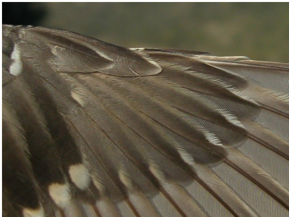
Alpine Accentor. 2nd year: pattern of primary coverts (06-II).