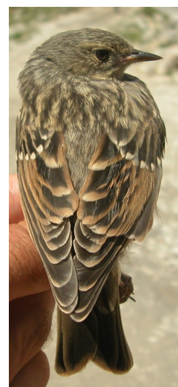
Alpine Accentor. Pattern of upperparts: top left adult (22-II); top right 2nd year (06-II); left juvenile (05-VII).