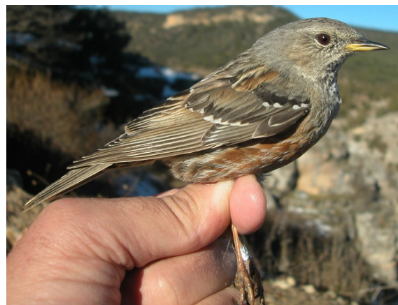
Alpine Accentor. 2nd year (06-II).