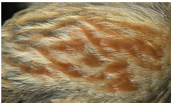
Alpine Accentor. 2nd year: pattern of flank (06-II)