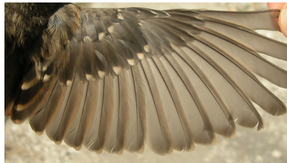
Alpine Accentor. Juvenile: pattern of wing (05-VII).