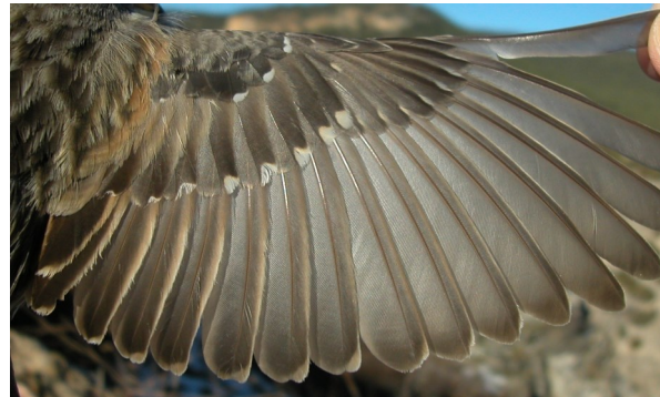
Alpine Accentor. 2nd year: pattern of wing (06-II).