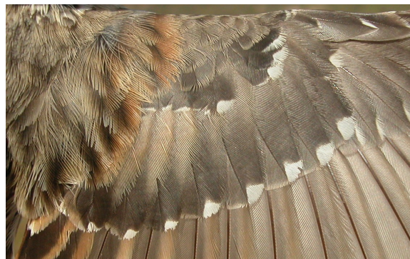
Alpine Accentor. Adult: pattern of greater coverts (22-II).