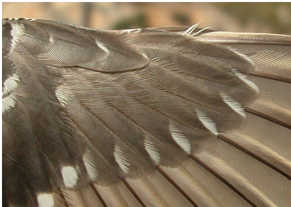
Alpine Accentor. Adult: pattern of primary coverts(22-II).