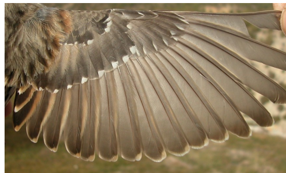
Alpine Accentor. Adult: pattern of wing (22-II).