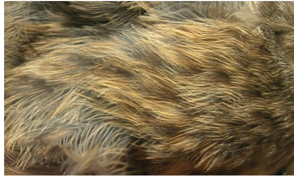
Alpine Accentor. Juvenile: pattern of flank (05-VII)