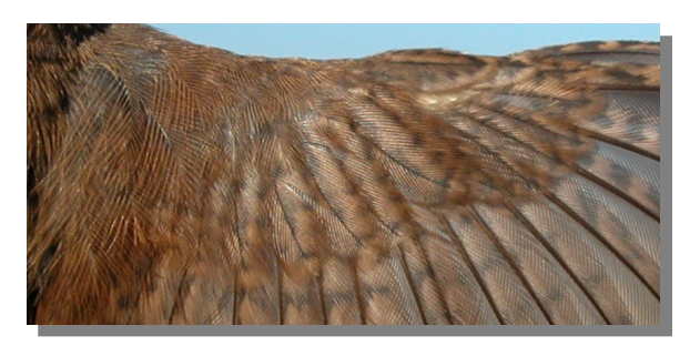
Wren. Juvenile: pattern of wing coverts (15-VI)