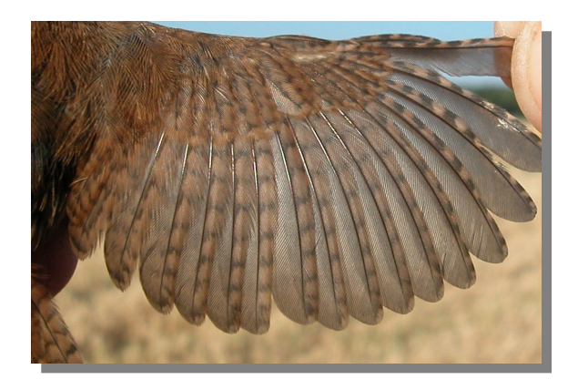
Wren. Juvenile: pattern of wing (15-VI).