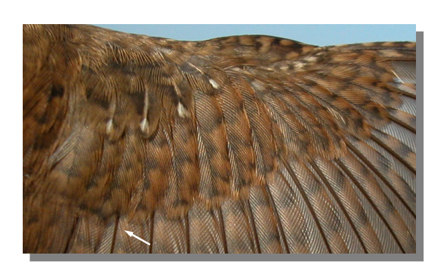
Wren. 1st year: pattern of wing coverts (10-XI)