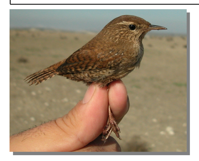
Wren. Adult (10-XI).

EURASIAN WREN ( Troglodytes troglodytes )