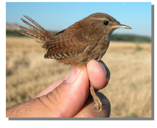
Wren. Juvenile (15-VI).