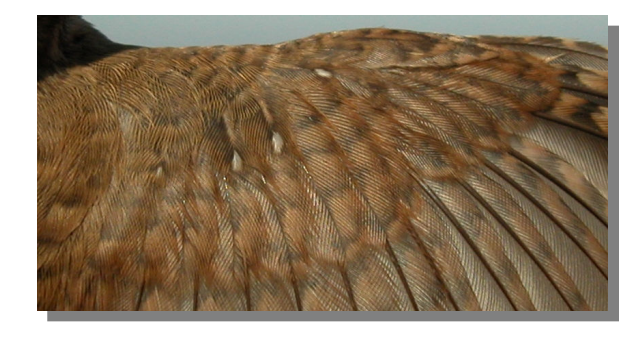
Wren. Adult: pattern of wing coverts (24-XII).