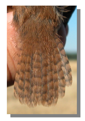
Wren. Tail pattern: top left adult (10-XI); top right 1st year (10-XI); left juvenile (15-VI).