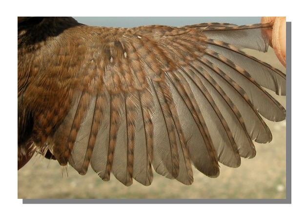
Wren. Adult: pattern of wing (24-XII).