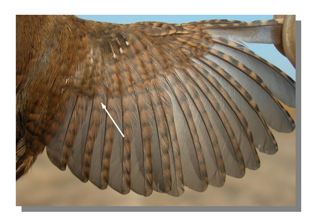
Wren. 1st year: pattern of wing (10-XI)