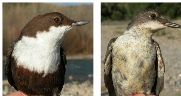
Dipper. Ageing. Pattern of breast: left adult; right juvenile.