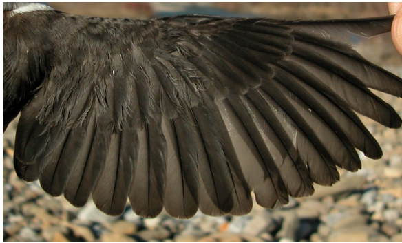
Dipper. Adult: pattern of wing (27-XII).