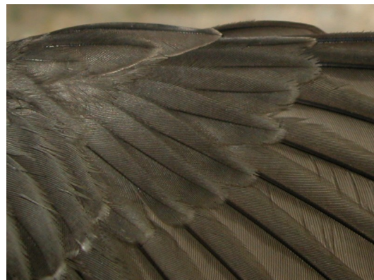
Dipper. Juvenile: pattern of primary coverts (12-VII).