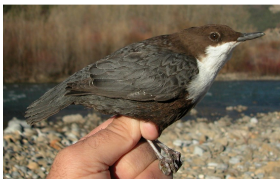
Dipper. 1st year (27-XII).