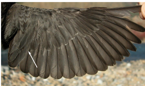
Dipper. 1st year: pattern of wing (27-XII).