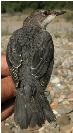
Dipper. Upperpart pattern: top left adult (27-XII); top right 1st year (27-XII); left juvenile (12-VII).