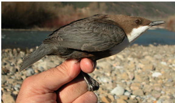
Dipper. Adult (8-1).