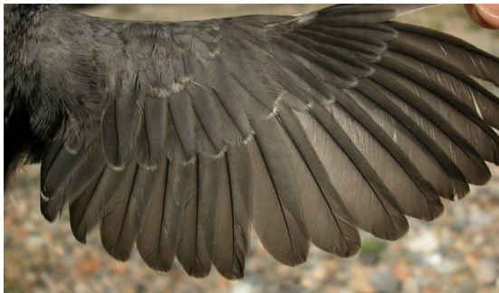
Dipper. Juvenile: pattern of wing (12-VII).