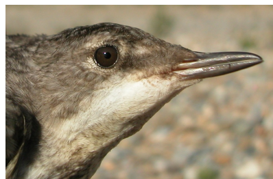
Dipper. Ageing. Pattern of head and iris colour: top adult; bottom juvenile.