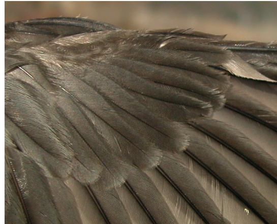
Dipper. Adult: pattern of primary coverts (08-I).