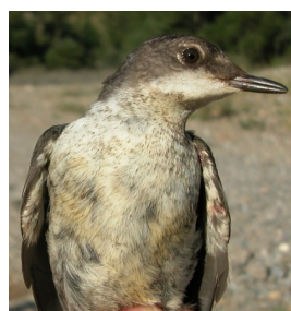
Dipper. Breast pattern: top left adult (27-XII); top right 1st year (27-XII); left juvenile (12-VII).