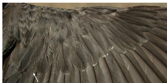
Dipper. Ageing. Moult limit on wing coverts: top adult; bottom 1st year.