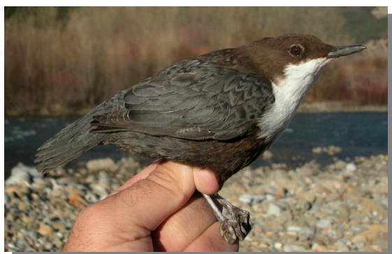
Dipper. 1st year (27-XII).

Dipper. Head pattern and iris colour: top adult (27-XII); middle 1st year (27-XII); bottom juvenile (12-VII).