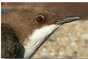
Dipper. Adult. Pattern of head and upperparts.

16-19 cm. Adult with dark grey upperparts; red-brown head and belly; white breast and throat. Juvenile dull grey.