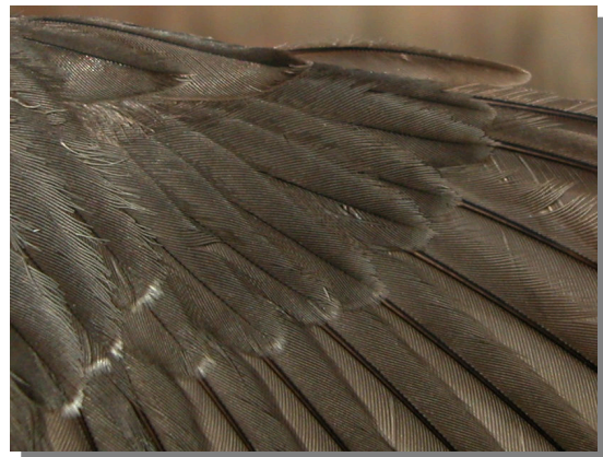
Dipper. 1st year: pattern of primary coverts (27-XII).