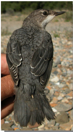
Dipper. Upperpart pattern: top left adult (27-XII); top right 1st year (27-XII); left juvenile (12-VII).