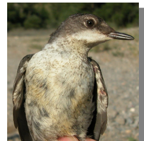
Dipper. Ageing. Pattern of breast: left adult; right juvenile.