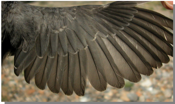
Dipper. Juvenile: pattern of wing (12-VII).