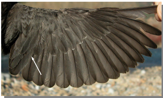
Dipper. 1st year: pattern of wing (27-XII).