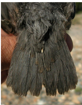
Dipper. Tail pattern: top left adult (27-XII); top right 1st year (27-XII); left juvenile (12-VII).