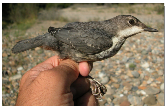
Dipper. Juvenile (12-VII).

Dipper. Breast pattern: top left adult (27-XII); top right 1st year (27-XII); left juvenile (12-VII).