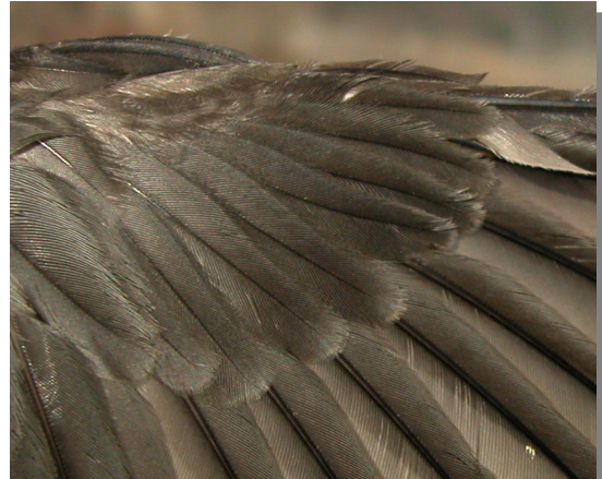
Dipper. Adult: pattern of primary coverts (08-I).