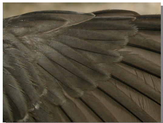
Dipper. Juvenile: pattern of primary coverts (12-VII).