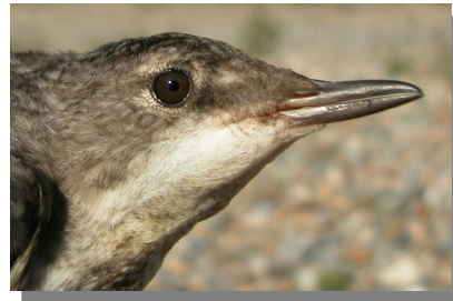
Dipper. Ageing. Pattern of head and iris colour: top adult; bottom juvenile.