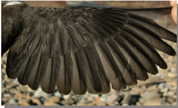
Dipper. Adult: pattern of wing (27-XII).