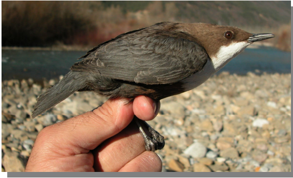
Dipper. Adult (8-I).