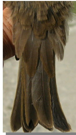
Water Pipit. Spring. Tail pattern: top left adult (04-IV); top right 2nd year (04-IV); left juvenile (05- VII).