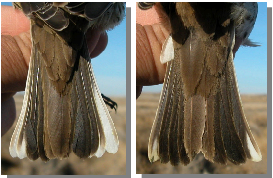
Water Pipit. Winter. Pattern and wear of tail: left adult (25-XII); right 1st year (25-XII).