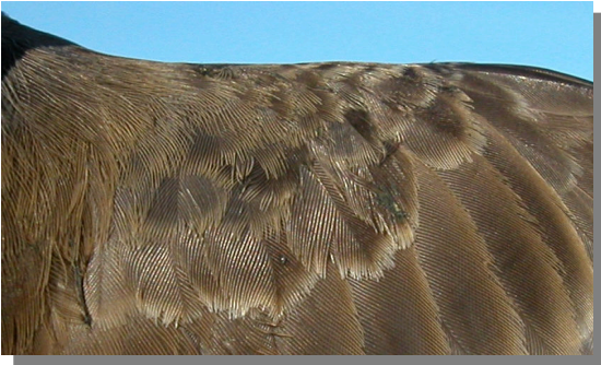
Water Pipit. Winter. 1st year: pattern of median coverts (25-XII).