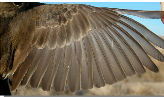
Water Pipit. Winter. 1st year: pattern of wing (25-XII).