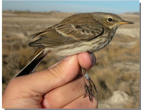
Water Pipit. Winter. Adult (25-XII).