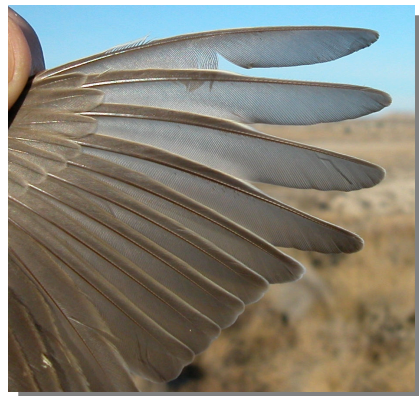
Water Pipit. Winter. Pattern of primaries: top adult (25-XII); bottom 1st year (25-XII).