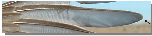
Water Pipit. Ageing. Pattern of tips of primaries: top adult; bottom 1st year.