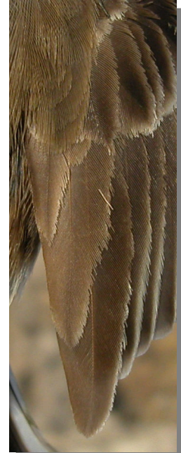
Water Pipit. Winter. Wear of tertials: left adult (25-XII); right 1st year (25-XII).