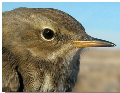
Water Pipit. Winter. Head pattern: top adult (25-XII); bottom 1st year (25-XII).