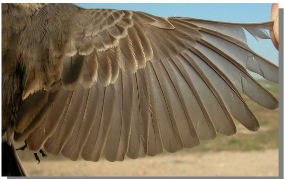
Water Pipit. Spring. Adult: pattern of wing (05-IV).