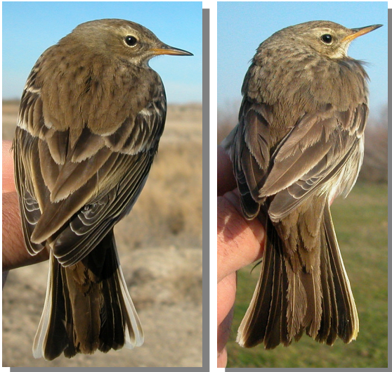
Water Pipit. Winter. Upperparts pattern: left adult (25-XII); right 2nd year (06-II).