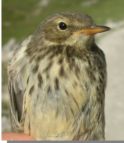
Water Pipit. Spring. Breast pattern: top left adult (04-IV); top right 2nd year (04-IV); left juvenile (05-VII).