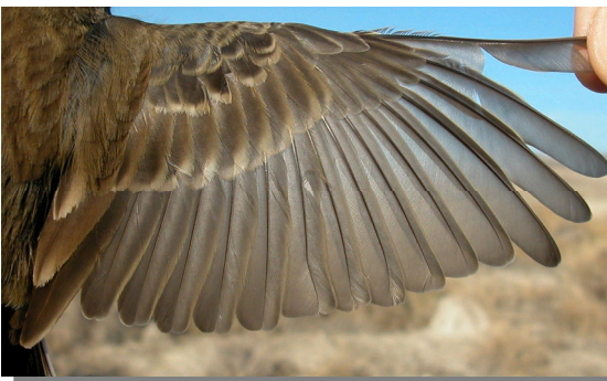
Water Pipit. Winter. Adult: pattern of wing (25-XII).