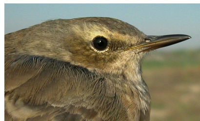
Water Pipit. Spring. Head pattern: top adult (04-IV); middle 2nd year (04-IV); bottom juvenile (05-VII).