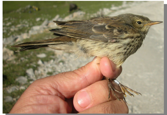
Water Pipit. Spring. Juvenile (05-VII).

Resident, with contribution of wintering European birds. Breeds in high areas from the Pyrenees and Moncayo.