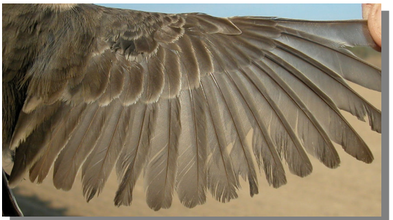
Water Pipit. Spring. 2nd year: pattern of wing (04-IV).