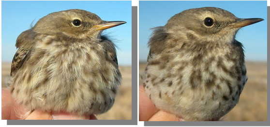
Water Pipit. Winter. Breast pattern: left adult (25-XII); right 1st year (25-XII).