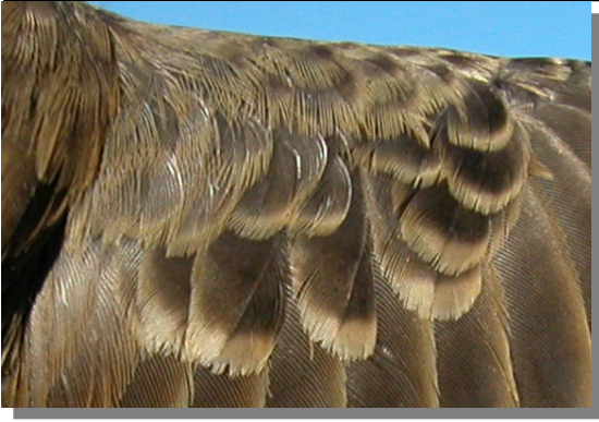
Water Pipit. Winter. Adult: pattern of median coverts (25-XII).