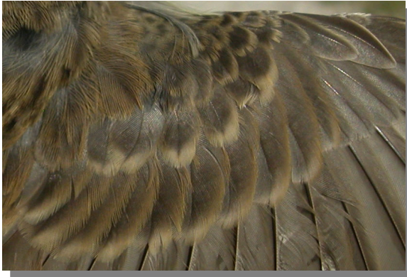
Water Pipit. Spring. Juvenile: pattern of wing coverts (05-VII).