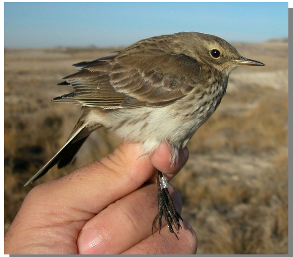
Water Pipit. Winter. 1st year (25-XII).