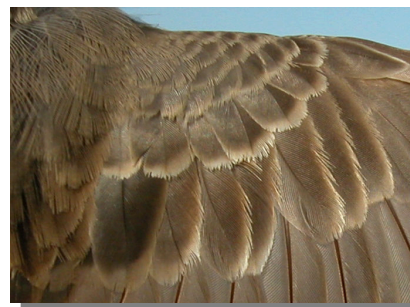
Water Pipit. Spring. Ageing. Pat- tern of wing coverts: top adult; bottom 1st year.