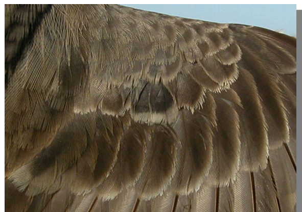
Water Pipit. Spring. 2nd year: pattern of wing coverts (04-IV).