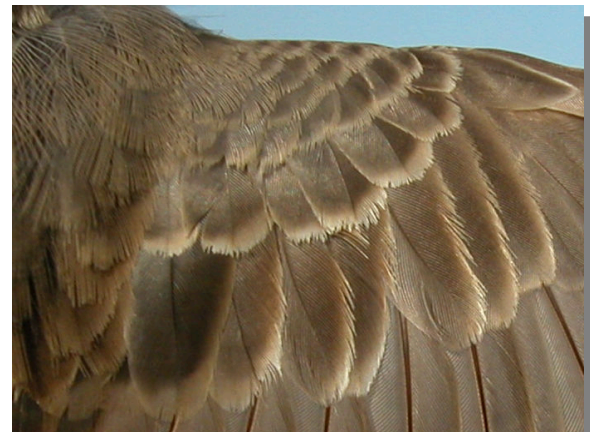
Water Pipit. Spring. Adult: pattern of wing coverts (05-IV).