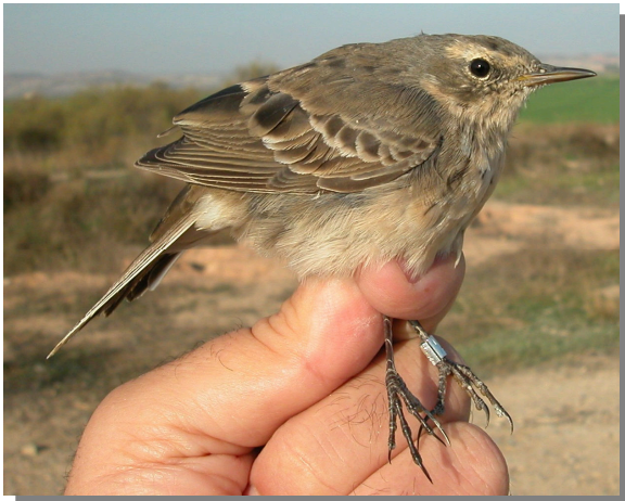
Water Pipit. Spring. Adult (04-IV).