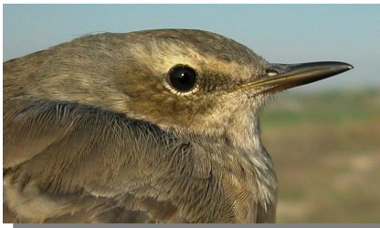
Water Pipit. Spring. Sexing. Pattern of head: top male; bot- tom female.