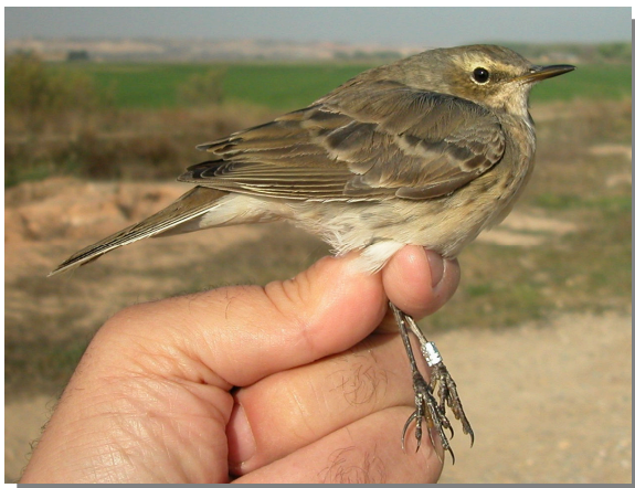
Water Pipit. Spring. 2nd year (04-IV).