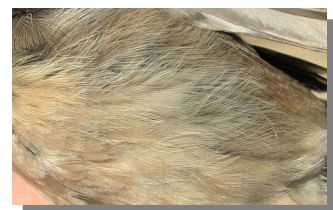
Water Pipit. Spring. Pattern of head, breast, legs and flank.