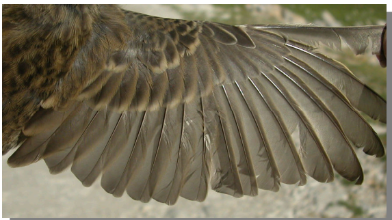
Water Pipit. Spring. Juvenile: pattern of wing (05-VII).