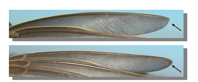
Meadow Pipit. Ageing. Pattern of tip of the 9th primary: top adult; bottom 1st year.

Wintering species, widely distributed throughout the Region in open landscapes.