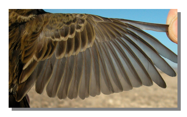
Meadow Pipit. Adult: pattern of wing (28-XII).