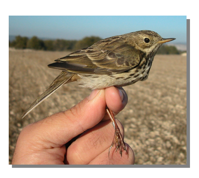
Meadow Pipit. 1st year (28-XII).