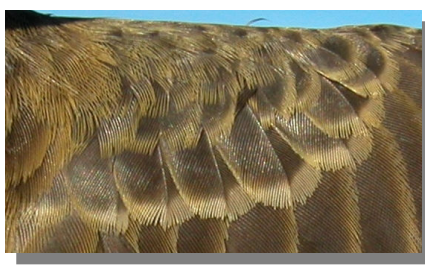
Meadow Pipit. Ageing. Pattern of median and lesser wing coverts: top adult; bottom 1st year.