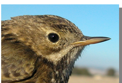
Meadow Pipit. Head pattern: top adult (28-XII); bottom 1st year (28-XII).