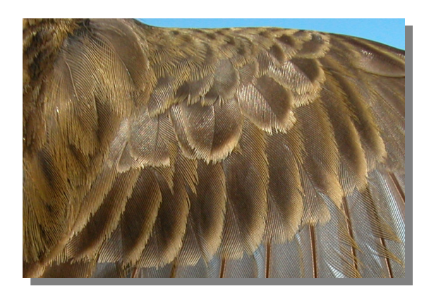
Meadow Pipit. 1st year: pattern of wing coverts (28-XII).