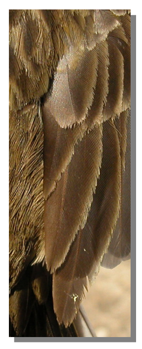
Meadow Pipit. Pattern of tertials: left adult (28-XII); right 1st year (28-XII).