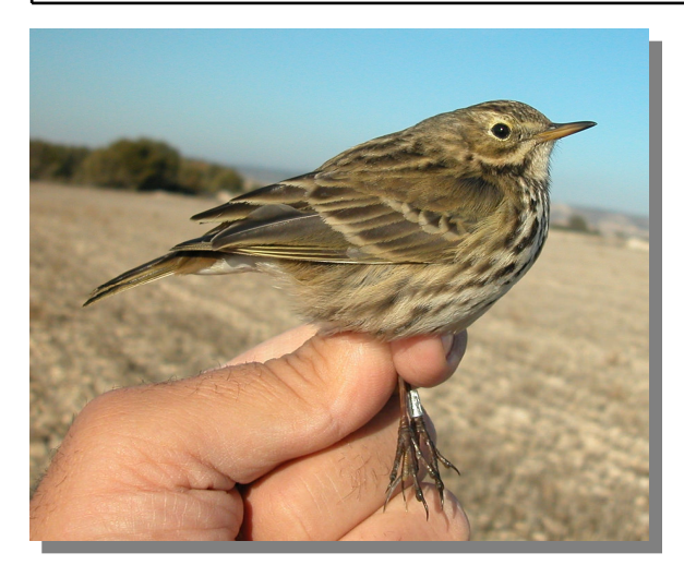
Meadow Pipit. Adult (28-XII).