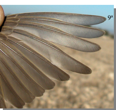
Meadow Pipit. Pattern of primaries: top adult (28-XII); bottom 1st year (28-XII).