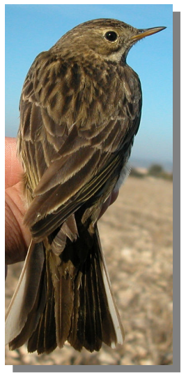
Meadow Pipit. Upperparts pattern: left adult (28-XII); right 1st year (28-XII).