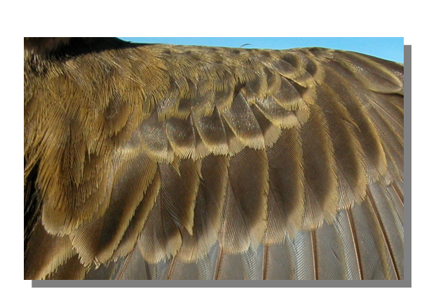
Meadow Pipit. Adult: pattern of wing coverts (28-XII).