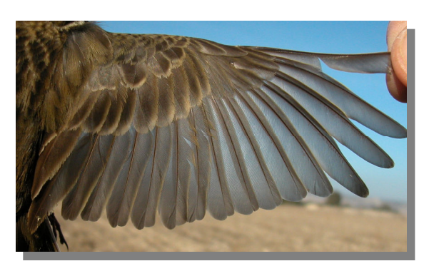
Meadow Pipit. 1st year: pattern of wing (28-XII).