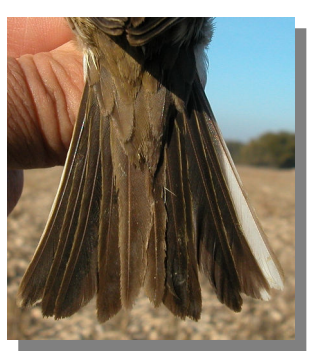
Meadow Pipit. Tail wear: left adult (28-XII); right 1st year (28-XII).