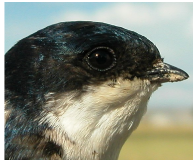
House Martin. Ageing. Pattern of head and bill: top adult; bottom juvenile.

In spring , after postbreeding/postjuvenile moults, ageing is not possible using plumage pattern.