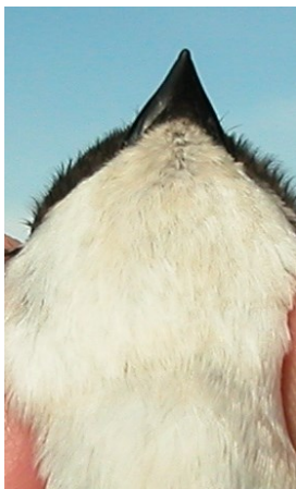
House Martin. Adult. Throat pattern: top left male (30-V); top right female (04-VI); left female with male-like morph (04-VI).