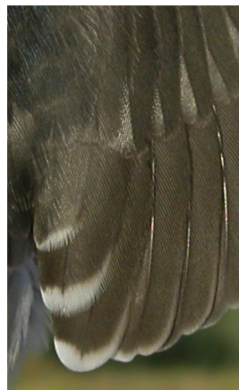
House Martin. Pattern of tertials: left adult (30-V); right juvenile (21-VIII).