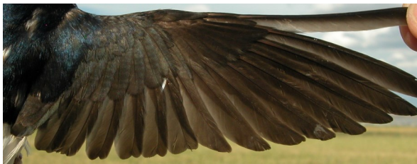
House Martin. Adult. Male: pattern of wing (30-V).