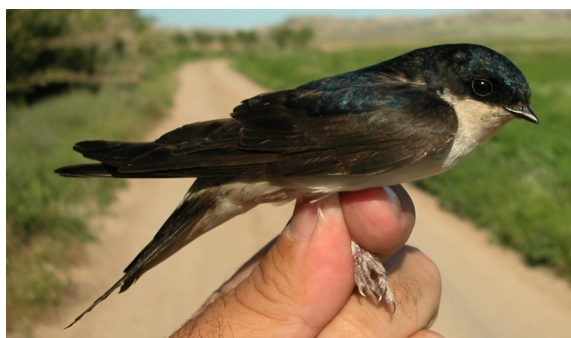
House Martin. Adult. Female (04-VI).