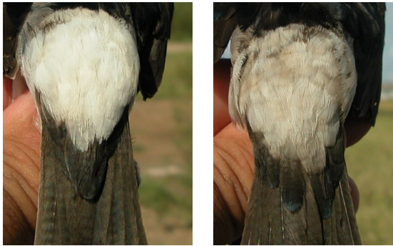
House Martin. Sexing. Pattern of rump: left male; right female.