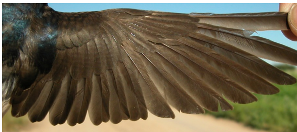
House Martin. Adult. Female: pattern of wing (04-VI).