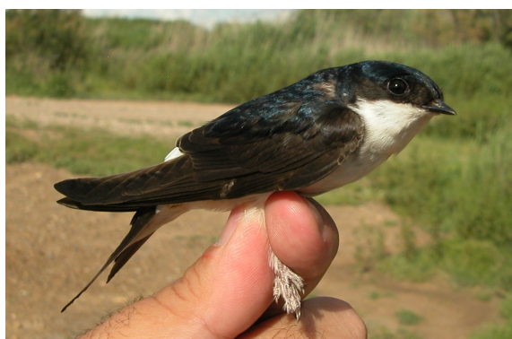
House Martin. Adult. Female with male-like morph (04-VI).