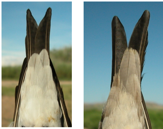
House Martin. Sexing. Pattern of undertail coverts: left male; right female.