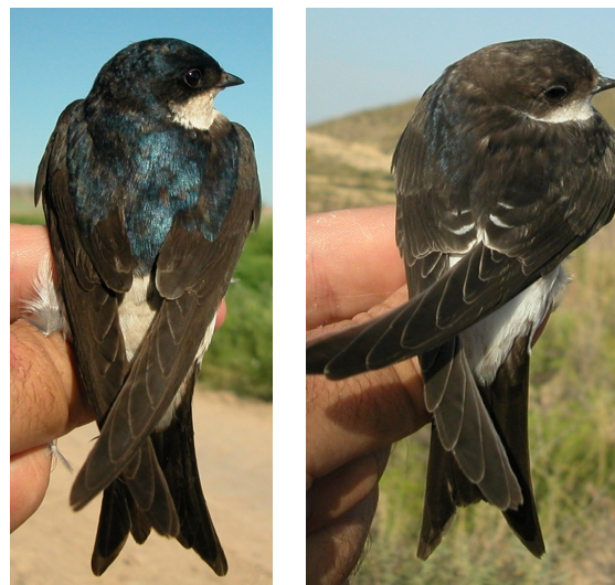
House Martin. Ageing. Pattern of upperparts: left adult; right juvenile.