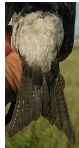
House Martin. Rump pattern: left adult male (30-V); right adult female (04-VI).