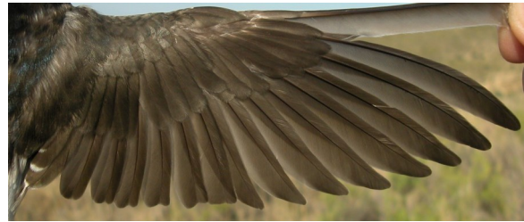
House Martin. Juvenile: pattern of wing (21-VIII).