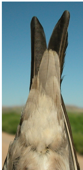
House Martin. Pattern of undertail coverts: left adult male (30-V); right adult female (04-VI).