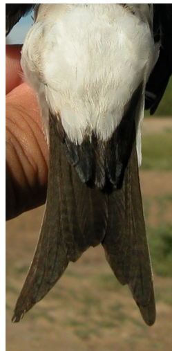
House Martin. Pattern of head, rump and legs.