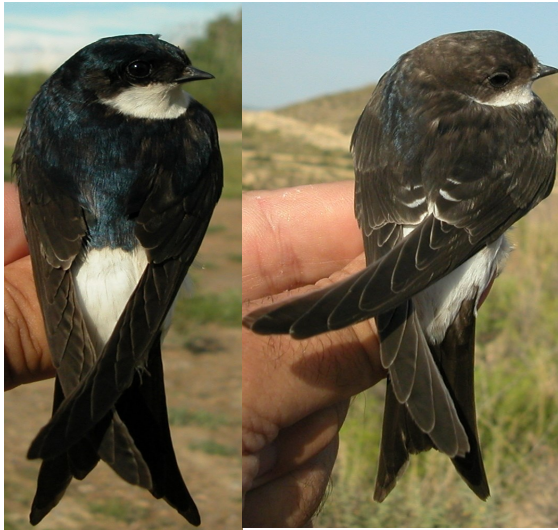
House Martin. Upperpart pattern: left adult female with male-like morph (04-VI); right juvenile (21-VIII).