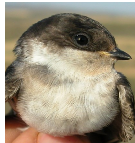
House Martin. Breast pattern: top left adult male (30-V); top right adult female (04-VI); left adult female with male-like morph (04-VI); bottom juvenile (21-VIII).