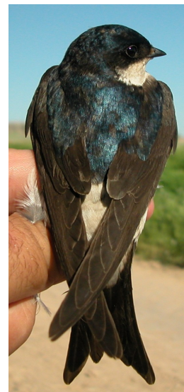
House Martin. Upperpart pattern: left adult male (30-V); right adult female (04-VI).