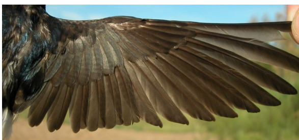
House Martin. Adult. Female with male-like morph: pattern of wing (04-VI).