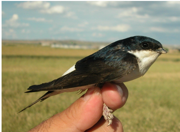
House Martin. Adult. Male (30-V).