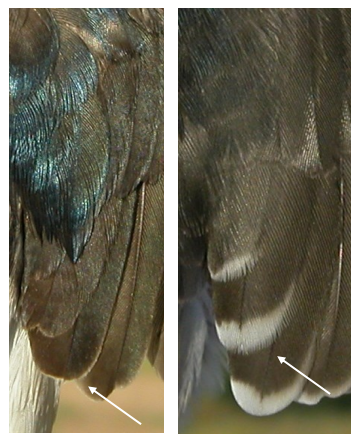
House Martin. Ageing. Pattern of tertials: left adult; right juvenile.