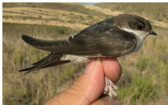
House Martin. Juvenile (21-VIII).