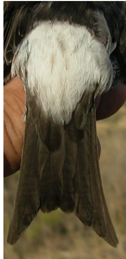
House Martin. Rump pattern: left adult female with male-like morph (04-VI); right juvenile (21-VIII).