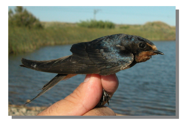
Barn Swallow. Autumn. 1st year (24-VIII).