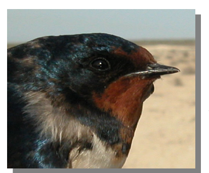
Barn Swallow. Spring. Head pattern: top adult male (29-III); middle adult female (29 -III); bottom juvenile (26-VI).