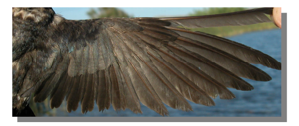
Barn Swallow. Autumn. Adult. Female: pattern of wing (24-VIII).

Barn Swallow. Autumn. Adult. Male: pattern of wing (24-VIII).