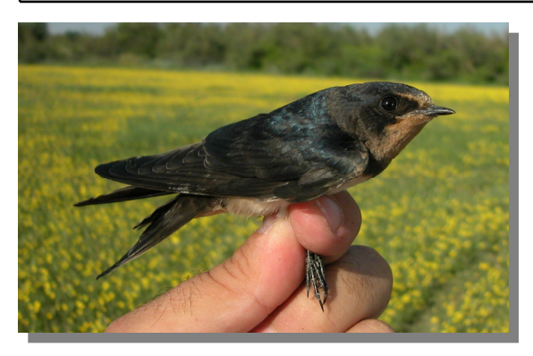
Barn Swallow. Spring. Juvenile (26-VI).