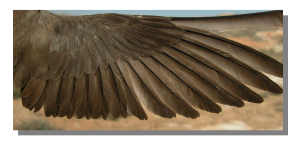
Crag Martin. Spring. 2nd year without juvenile pale patches: pattern of wing (20-III).