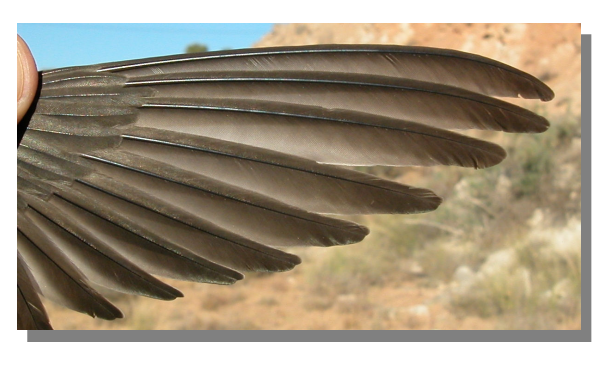
Crag Martin. Spring. Juvenile: pattern and wear of primaries (18-VII).