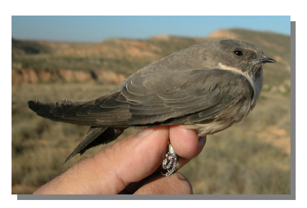
Crag Martin. Autumn. Adult (25-X).