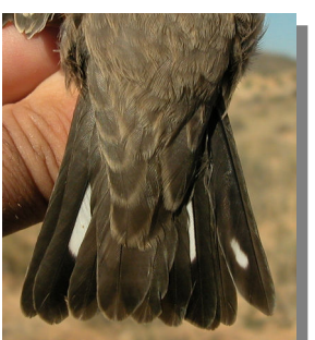
Crag Martin. Spring. Tail wear and pattern of the outermost tail feather: top left adult (20-III); top right 2nd year (20-III); left juvenile (18-VII).