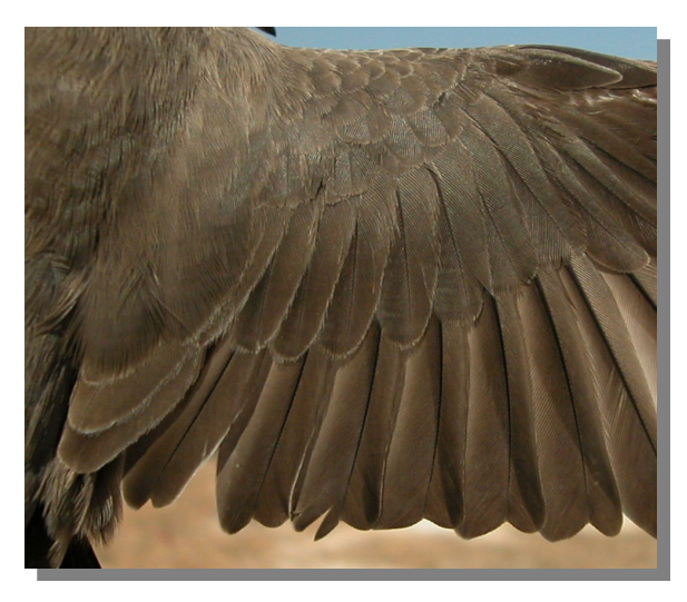
Crag Martin. Spring. 2nd year with juvenile pale patches: pattern and wear of secondaries (20-III)