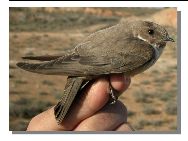
Crag Martin. Spring. Adult (20-III).