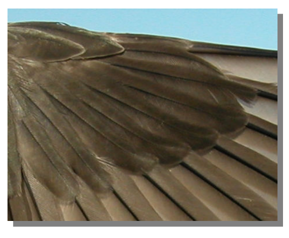
Crag Martin. Spring. Juvenile: pattern and wear of primary coverts (18-VII).