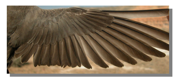
Crag Martin. Spring. 2nd year with juvenile pale patches: pattern of wing (20-III).