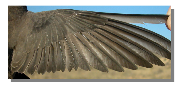
Crag Martin. Autumn. Adult: pattern of wing (25-X).