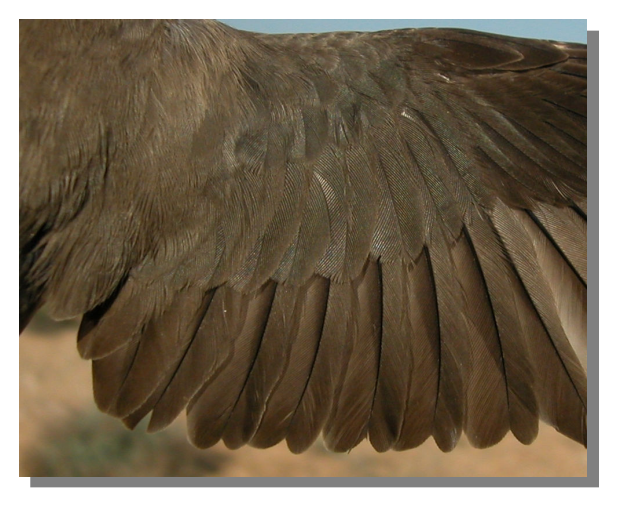
Crag Martin. Spring. 2nd year without juvenile pale patches: pattern and wear of secondaries (20-III)