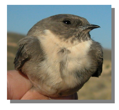
Crag Martin. Autumn. Breast pattern: top adult (25-X); bottom 1st year (25-X).