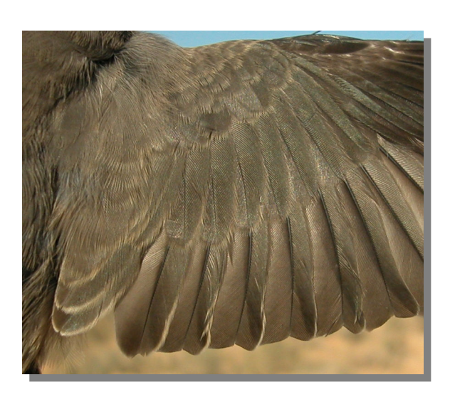
Crag Martin. Autumn. 1st year: pattern and wear of secondaries (25-X).