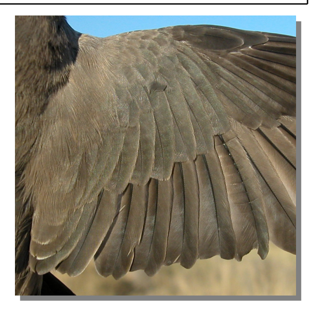
Crag Martin. Autumn. Adult: pattern and wear of secondaries (25-X).