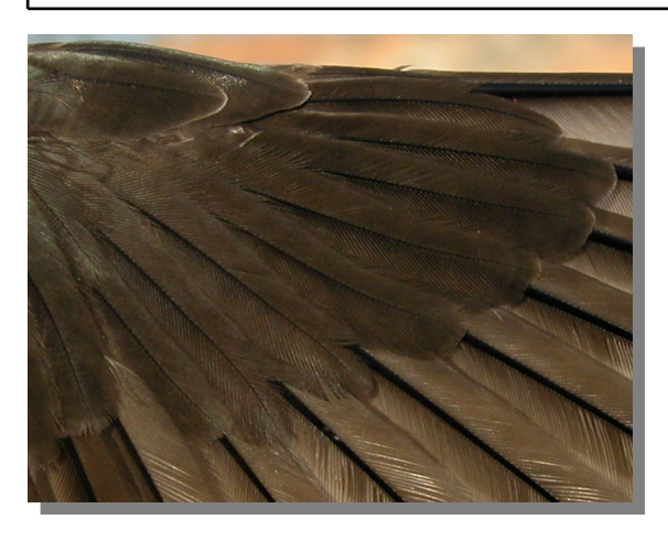
Crag Martin. Spring. Adult: pattern and wear of primary coverts (20-III).