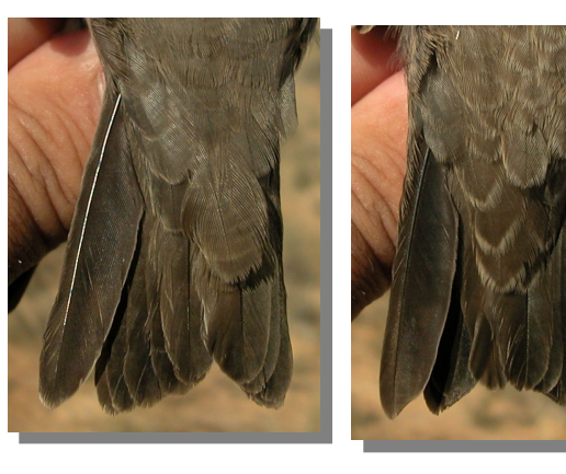
Crag Martin. Autumn. Pattern of the outermost tail feather: left adult (25-X); right 1st year (25-X).