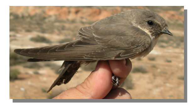
Crag Martin. Spring. 2nd year (20-III).

Summer visitor, breeds on cliff faces or buildings in mountainous areas.