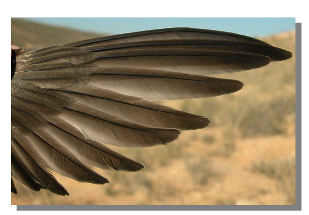
Crag Martin. Autumn. 1st year: pattern and wear of primaries (25-X).