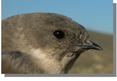
Crag Martin. Autumn. Head pattern: top adult (25-X); bottom 1st year (25-X).