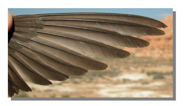
Crag Martin. Spring. 2nd year: pattern and wear of primaries (20-III).