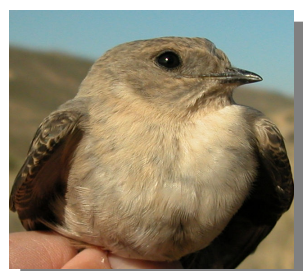
Crag Martin. Spring. Breast pattern: top left adult (20-III); top right 2nd year (20-III); left juvenile (18-VII).