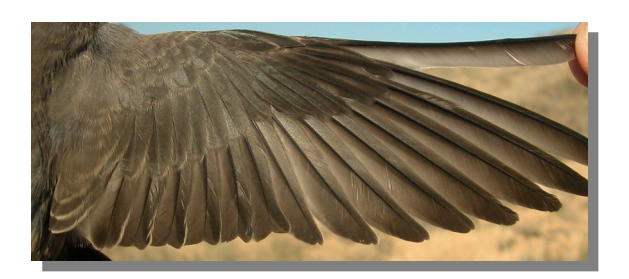
Crag Martin. Autumn. 1st year: pattern of wing (25-X).