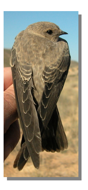
Crag Martin. Ageing. Pattern of upperparts: left adult; right juvenile.