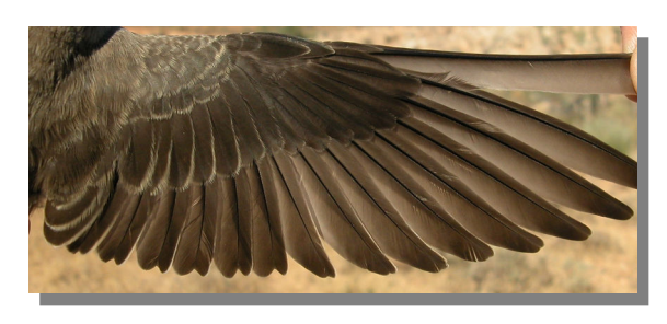
Crag Martin. Spring. Juvenile: pattern of wing (18-VII).