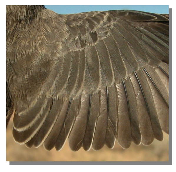
Crag Martin. Spring. Juvenile: pattern and wear of secondaries (18-VII).