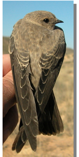
Crag Martin. Spring. Upperpart pattern: top left adult (20-III); top right 2nd year (20-III); left juvenile (18-VII).