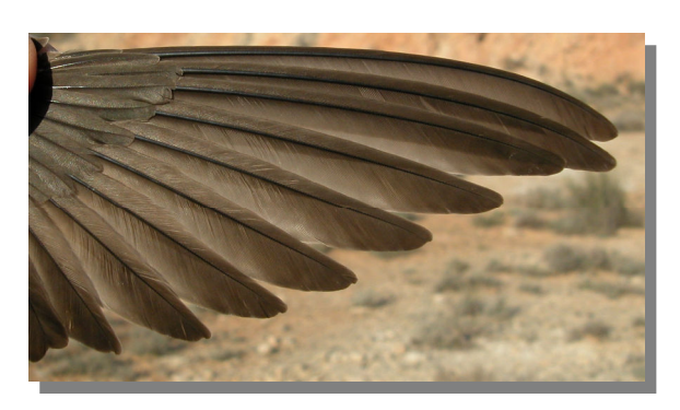
Crag Martin. Spring. Adult: pattern and wear of primaries (20-III).