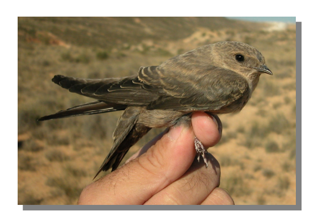
Crag Martin. Spring. Juvenile (18-VII).