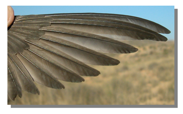
Crag Martin. Autumn. Adult: pattern and wear of primaries (25-X).