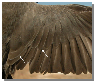
Crag Martin. Ageing. Pattern of greater coverts and tertials: top adult; middle 2nd year; bottom juvenile.