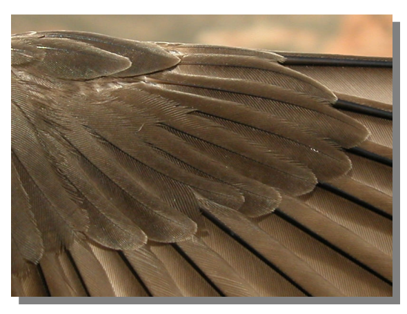
Crag Martin. Spring. 2nd year: pattern and wear of primary coverts (20-III).