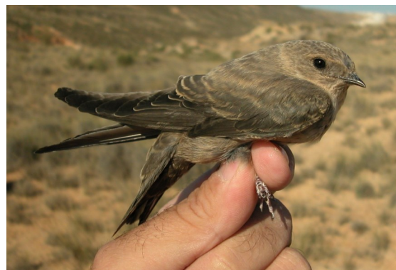
Crag Martin. Spring. Juvenile (18-VII).