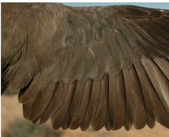
Crag Martin. Spring. 2nd year without juvenile pale patches : pattern and wear of secondaries (20-III)