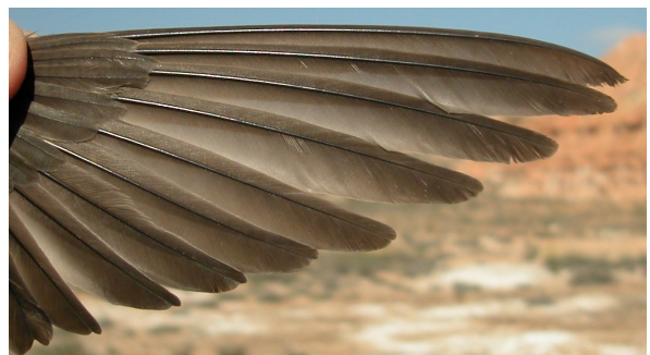
Crag Martin. Spring. 2nd year: pattern and wear of primaries (20-III).