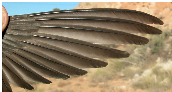
Crag Martin. Spring. Juvenile: pattern and wear of primaries (18-VII).