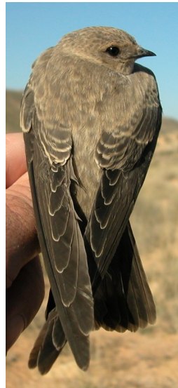
Crag Martin. Spring. Upperpart pattern: top left adult (20-III); top right 2nd year (20-III); left juvenile (18-VII).