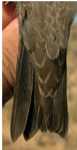
Crag Martin. Autumn. Pattern of the outermost tail feather: left adult (25-X); right 1st year (25-X).