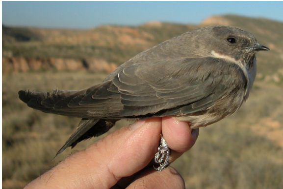
Crag Martin. Autumn. Adult (25-X).