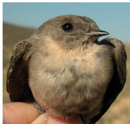
Crag Martin. Autumn. Breast pattern: top adult (25-X); bottom 1st year (25-X).