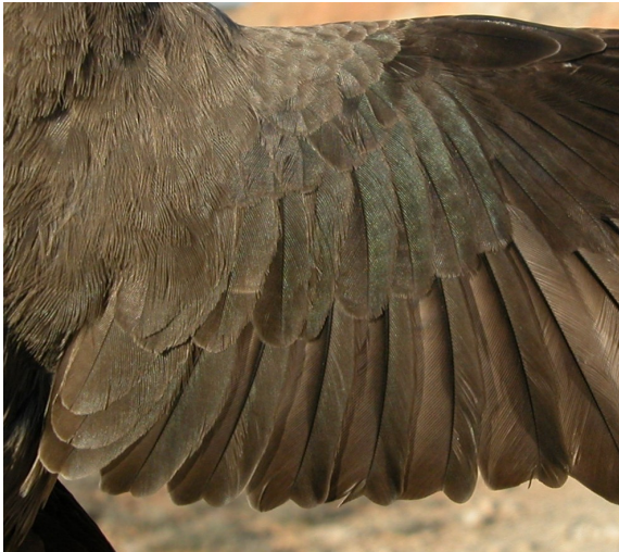
Crag Martin. Spring. Adult: pattern and wear of secondaries (20-III).