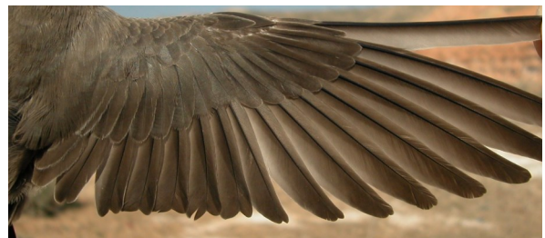
Crag Martin. Spring. 2nd year with juvenile pale patches: pattern of wing (20-III).