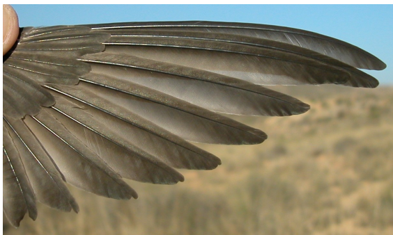
Crag Martin. Autumn. Adult: pattern and wear of primaries (25-X).