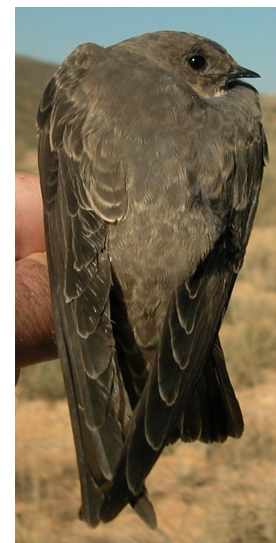
Crag Martin. Autumn. Upperpart pattern: left adult (25-X); right 1st year (25-X).