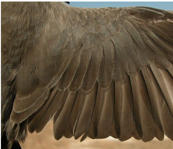
Crag Martin. Spring. 2nd year with juvenile pale patches : pattern and wear of secondaries (20-III)