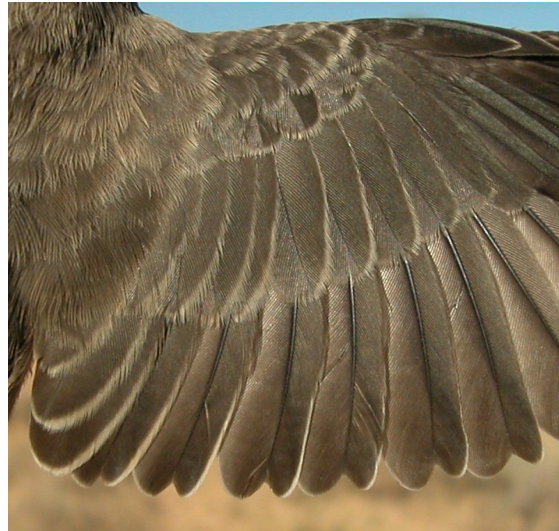
Crag Martin. Spring. Juvenile: pattern and wear of secondaries (18-VII).