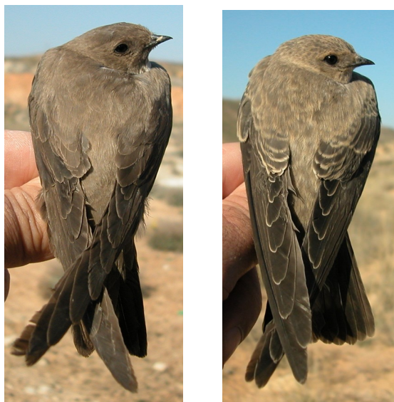
Crag Martin. Ageing. Pattern of upperparts: left adult; right juvenile.

Adult with uniform grey brown feathers (in fresh plumage with narrow white fringe on greater coverts and tertials and rufous on feathers of upperparts); quite fresh feathers in spring ; rounded outermost tail feather.