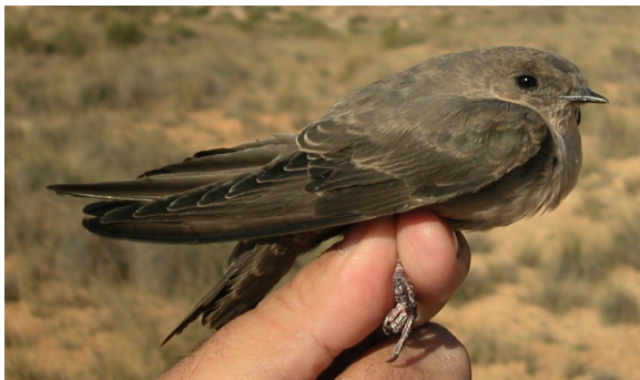
Crag Martin. Autumn. 1st year (25-X).