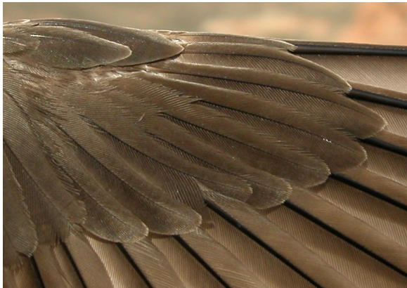
Crag Martin. Spring. 2nd year: pattern and wear of primary coverts (20-III).