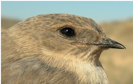
Crag Martin. Spring. Head pattern and iris colour: top adult (20-III); middle 2nd year (20-III); bottom juvenile (18-VII).