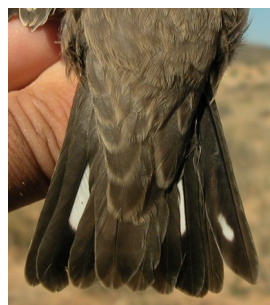
Crag Martin. Spring. Tail wear and pattern of the outermost tail feather: top left adult (20-III); top right 2nd year (20-III); left juvenile (18-VII).