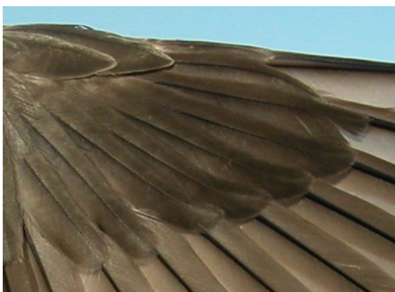
Crag Martin. Spring. Juvenile: pattern and wear of primary coverts (18-VII).