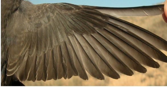
Crag Martin. Autumn. 1st year: pattern of wing (25-X).