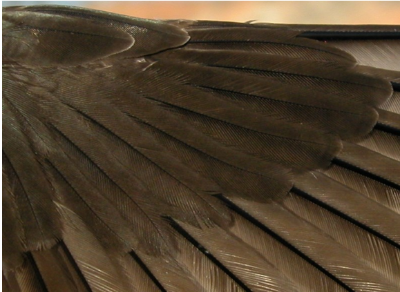
Crag Martin. Spring. Adult: pattern and wear of primary coverts (20-III).