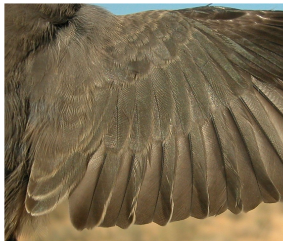
Crag Martin. Autumn. 1st year: pattern and wear of secondaries (25-X).