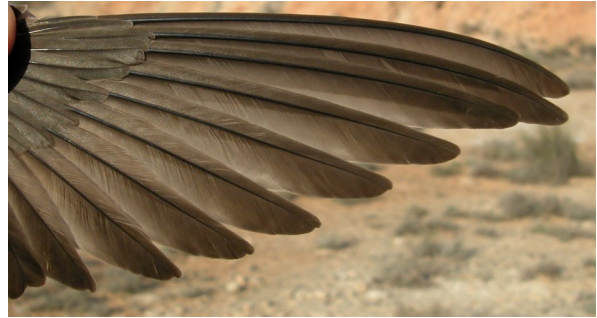
Crag Martin. Spring. Adult: pattern and wear of primaries (20-III).