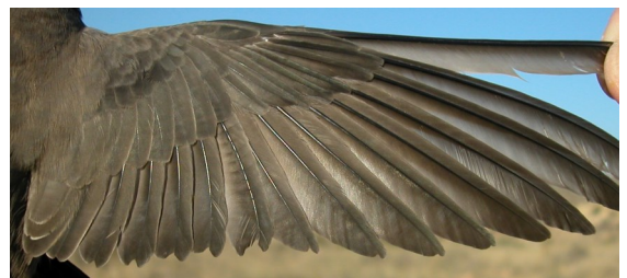
Crag Martin. Autumn. Adult: pattern of wing (25-X).