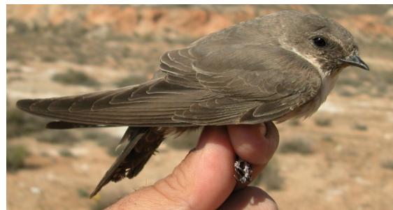
Crag Martin. Spring. 2nd year (20-III).

■ Summer visitor ■ Resident ■ Wintering ■ On passage