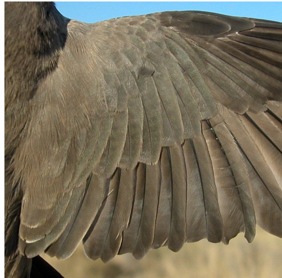
Crag Martin. Autumn. Adult: pattern and wear of secondaries (25-X).