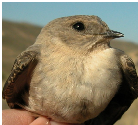
Crag Martin. Spring. Breast pattern: top left adult (20-III); top right 2nd year (20-III); left juvenile (18-VII).