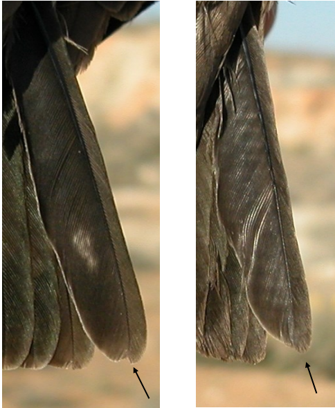
Crag Martin. Ageing. Pattern of tip of the outermost tail feathers: left adult; right juvenile.