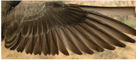
Crag Martin. Spring. Juvenile: pattern of wing (18-VII).