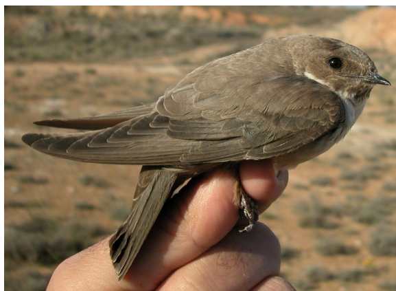
Crag Martin. Spring. Adult (20-III).