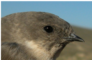
Crag Martin. Autumn. Head pattern: top adult (25-X); bottom 1st year (25-X).