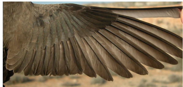
Crag Martin. Spring. Adult: pattern of wing (20-III).