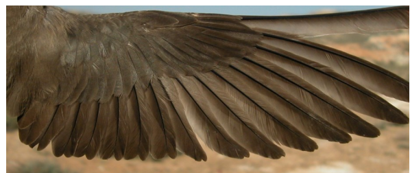
Crag Martin. Spring. 2nd year without juvenile pale patches: pattern of wing (20-III).