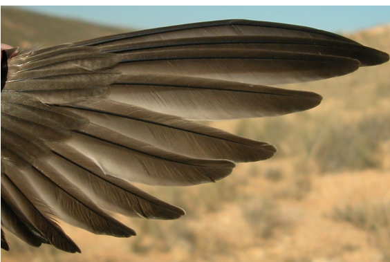
Crag Martin. Autumn. 1st year: pattern and wear of primaries (25-X).