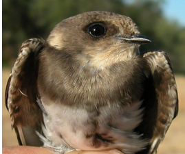
Sand Martin. Breast pattern: top left in spring (09-IV); top right adult in summer (31-VII); left juvenile (07-VII).