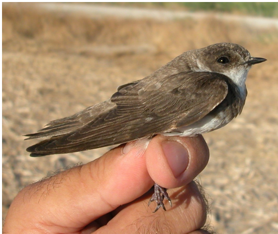
Sand Martin. Summer. Adult (31-VII)