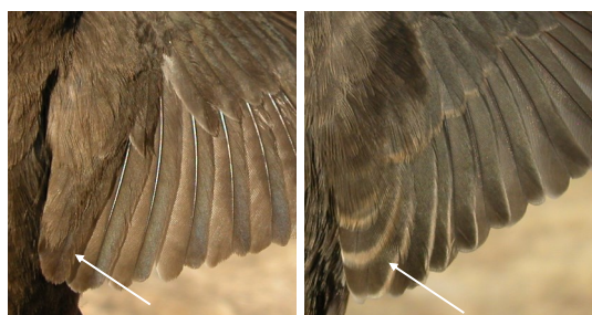
Sand Martin. Ageing. Pattern of tertials: left adult; right juvenile.