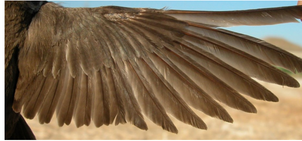
Sand Martin. Summer. Adult: pattern of wing (31-VII).