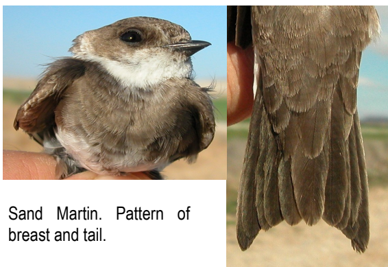
Sand Martin. Pattern of breast and tail.

12-13 cm. Grey brown upperparts; white underparts; with a grey brown breast band; tail short and forked.