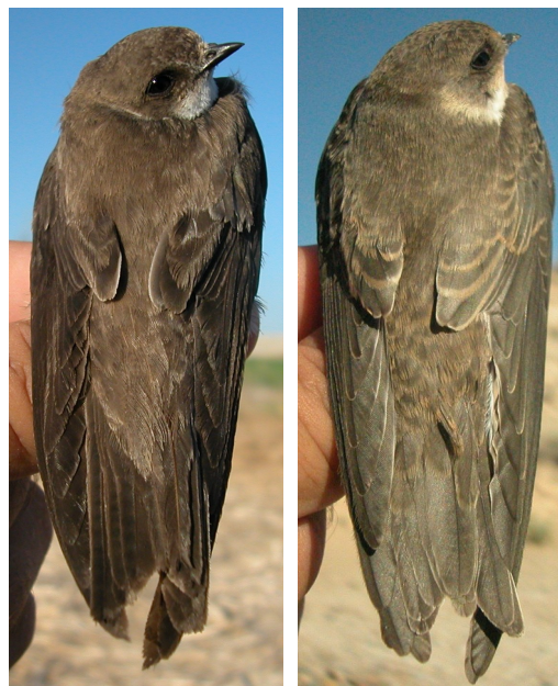
Sand Martin. Ageing. Pattern of upperparts: left adult; right juvenile.

In spring , after postbreeding/postjuvenile moults, ageing is not possible using plumage pattern. Some retained feathers can rarely be found until early summer, but feather generation unknown.