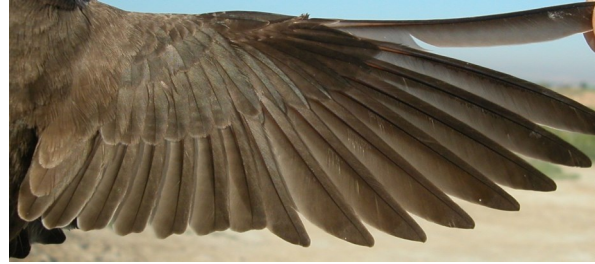
Sand Martin. Spring: pattern of wing (09-IV).