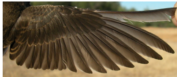
Sand Martin. Summer. Juvenile: pattern of wing (07-VII).