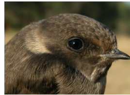
Sand Martin. Head pattern: top left in spring (09-IV); top right adult in summer (31-VII); left juvenile (07-VII).