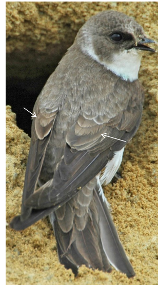
Sand Martin. Spring. Upperpart pattern: left with complete moult (09-IV); right with retained tertials (V)