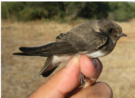
Sand Martin. Summer. Juvenile (22-VII).