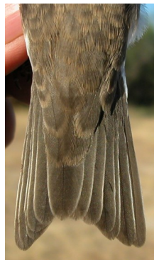
Sand Martin. Rump pattern and tail wear: top left in spring (09-IV); top right adult in summer (31-VII); left juvenile (07-VII).