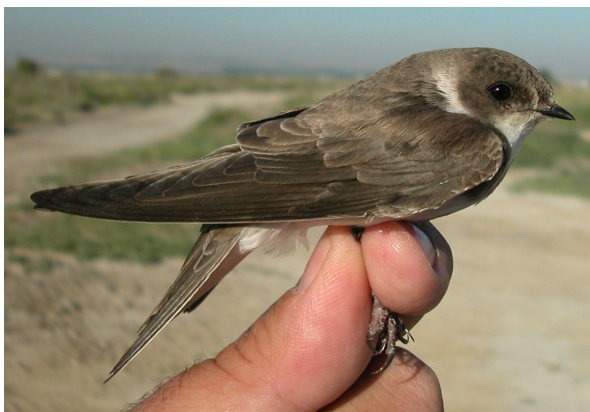
Sand Martin. Spring (09-IV).