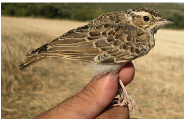
Woodlark. Juvenile (30-VII).