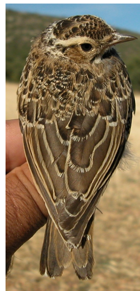
Woodlark. Upperpart pattern: left adult (26-I); right juvenile (30-VII)