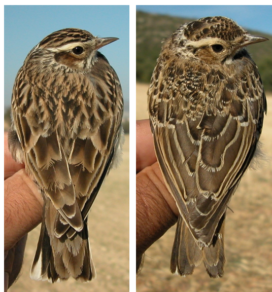
Woodlark. Ageing. Patern of upperparts: left adult; right juvenile.