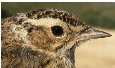
Woodlark. Head pattern: top adult (26-I); bottom juvenile (30-VII)