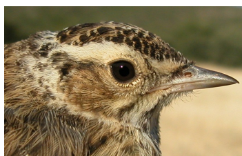
Woodlark. Ageing. Patern of head: top adult; bottom juvenile.