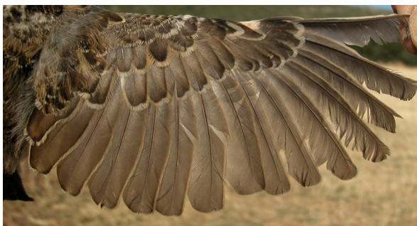
Woodlark. Juvenile: pattern of wing (30-VII)