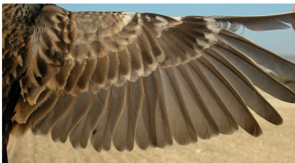
Woodlark. Adult: pattern of wing (26-I)