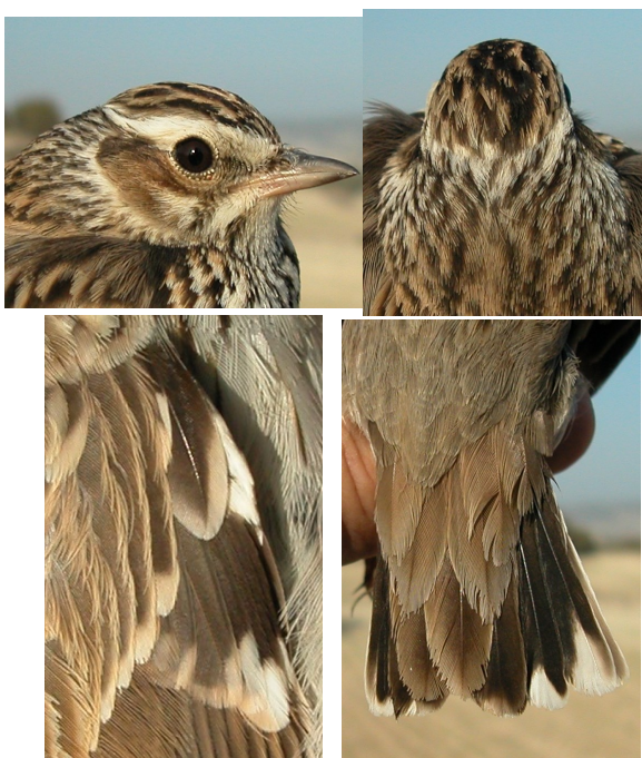
Woodlark. Pattern of head, nape, primary coverts and tail..

14-16 cm. Brown plumage, streaked dark except rump; whitish underparts; throat and breast streaked; head with a little crest and broad supercilium joining at nape; primary coverts white and black; outer tail feathers with white tips. Juveniles have pure white edges on feathers.