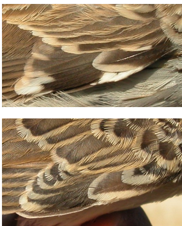
Woodlark. Pattern of primary co- verts: top adult (06-XII); bottom juve- nile (30-VII).