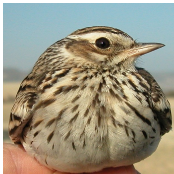
Woodlark. Breast pattern: top adult (26-I); bottom juvenile (30-VII)