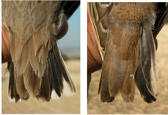
Woodlark. Tail pattern: left adult (26-I); right juvenile (30-VII)