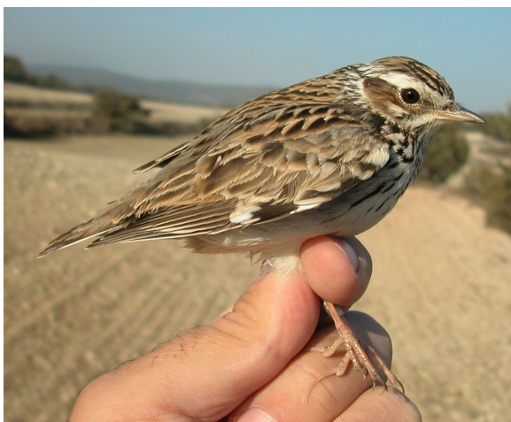
Woodlark. Adult (26-l).