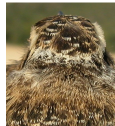
Woodlark. Nape pattern: left adult (26-I); right juvenile (30-VII)