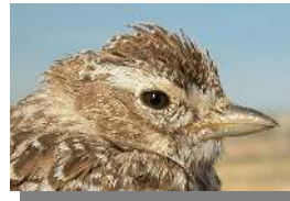
Lesser Short-toed Lark. Juvenile.