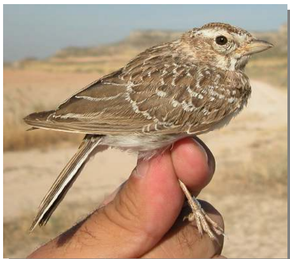
Lesser Short-toed Lark. Juvenile (28-VI)