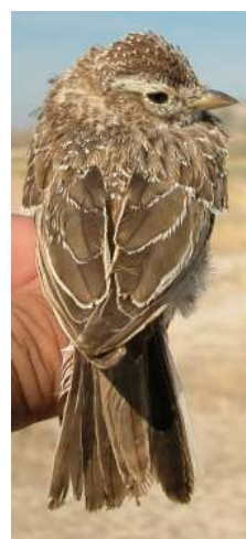
Lesser Short-toed Lark. Upperpart pattern: left adult (04-V); right juvenile (28-VI)