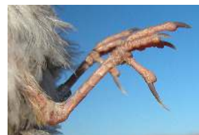
Lesser Short-toed Lark. Legs colour: left adult (04-V); right juvenile (06-VII).