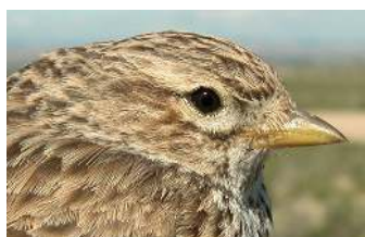
Lesser Short-toed Lark. Pattern of head and bill: top adult (04-V); bottom juvenile (28-VI)