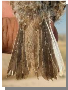
Lesser Short-toed Lark. Tail pattern: left adult (04-V); right juvenile (28-VI).