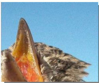
Lesser Short-toed Lark. Spring. Colour inside of upper mandible.