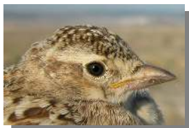
Short-toed Lark. Juvenile.