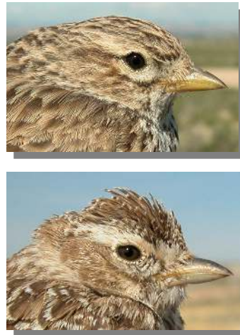
Lesser Short-toed Lark. Ageing. Pattern of head: top adult; bottom juvenile.