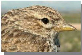
Lesser Short-toed Lark. Adult.