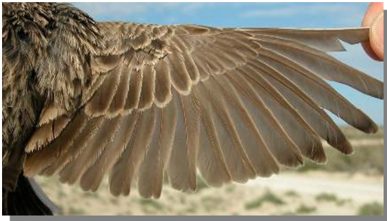
Lesser Short-toed Lark. Adult: pattern of wing (04-V).