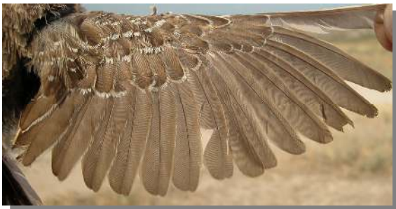
Lesser Short-toed Lark. Juvenile: pattern of wing (28-VI).