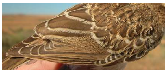
Lesser Short-toed Lark. Wing formula: tertials don't cloak primary tips: top adult (04-V); bottom juvenile (06-VII).