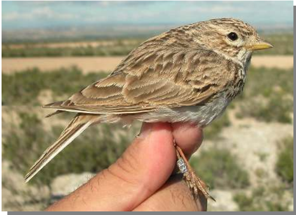
Lesser Short-toed Lark. Adult (04-V).