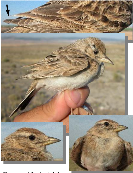
Short-toed Lark. Adult.