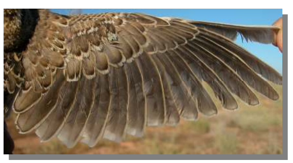
Calandra Lark. Juvenile: pattern of wing (06-VII)