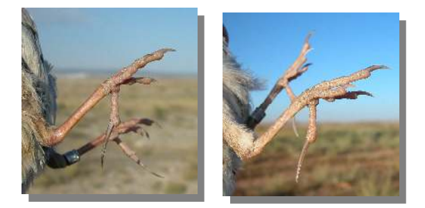
Calandra Lark. Legs colour: left adult (07-VII); right juvenile (06-VII)