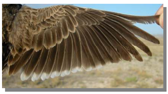
Calandra Lark. Adult: pattern of wing (07-VII).

Calandra Lark. Upperpart pattern: left adult (07-VII); right juvenile (06-VII)