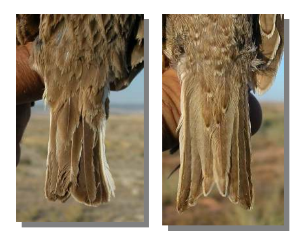
Calandra Lark. Tail pattern: left adult (07-VII); right juvenile (06-VII)