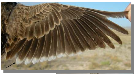
Calandra Lark. Pattern of wing and head.

After postbreeding/postjuvenile moults ageing is not possible using plumage pattern.