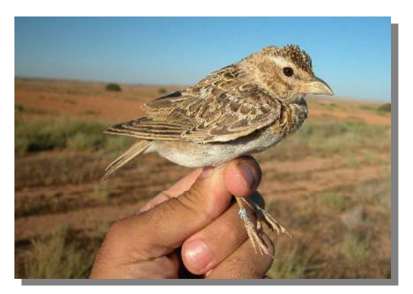
Calandra Lark. Juvenile (06-VII)