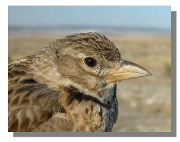
Calandra Lark. Head pattern: top adult (07-VII); bottom juvenile (06-VII)