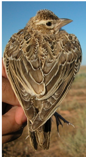
Calandra Lark. Upperpart pattern: left adult (07-VII); right juvenile (06-VII)