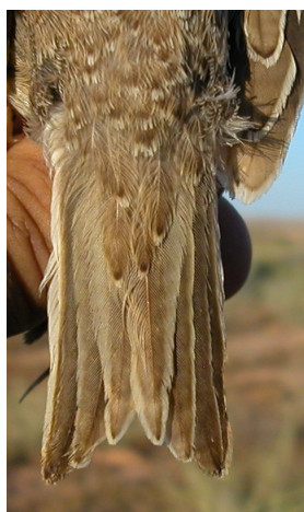
Calandra Lark. Tail pattern: left adult (07-VII); right juvenile (06-VII)