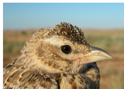
Calandra Lark. Ageing. Pattern of head: top adult; bottom juvenile.