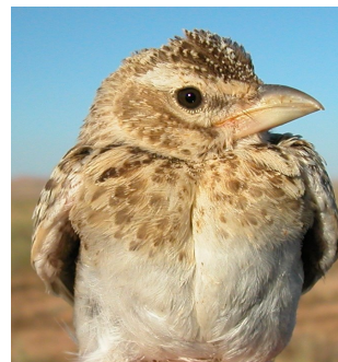
Calandra Lark. Breast pattern: top adult (07-VII); bottom juvenile (06-VII)