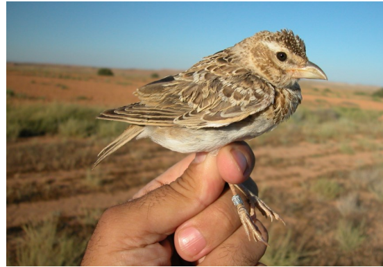
Calandra Lark. Juvenile (06-VII)