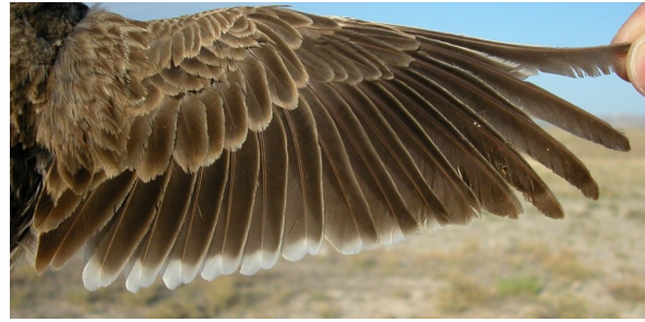
Calandra Lark. Adult: pattern of wing (07-VII).