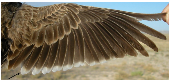
Calandra Lark. Pattern of wing and head.

18-20 cm. Brown upperparts, with pale edges; head without crest; with pale supercilium; strong and thick bill; upper breast softly streaked, with two dark patches on both sides; wings with a pale band on tips of secondaries; dark underwing coverts. Juveniles with feathers on body and wing edged whitish; dark patches on neck little conspicuous.