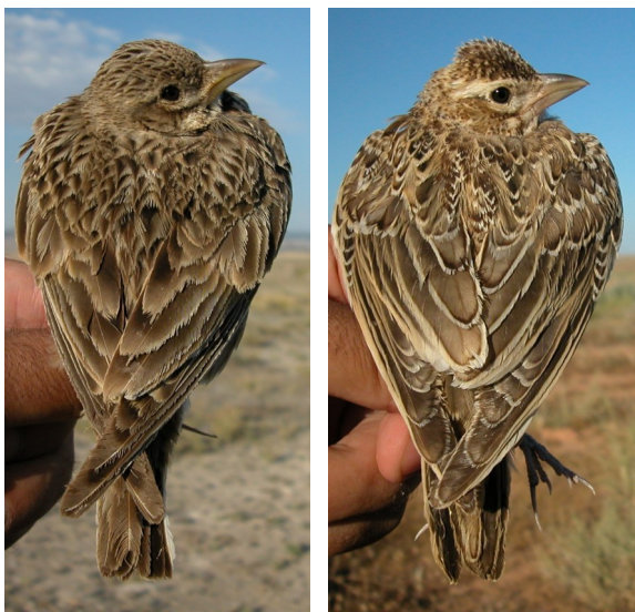
Calandra Lark. Ageing. Pattern of upperparts: left adult; right juvenile.