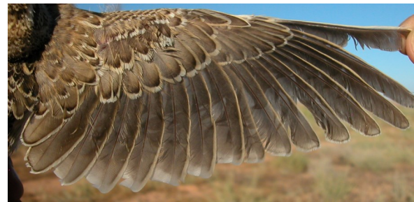
Calandra Lark. Juvenile: pattern of wing (06-VII)