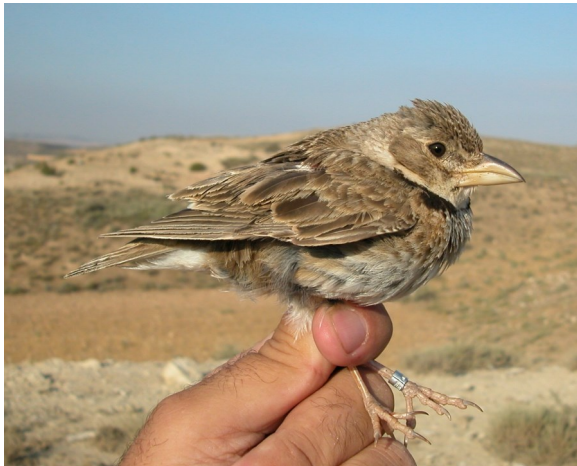
Calandra Lark. Adult (27-VII).