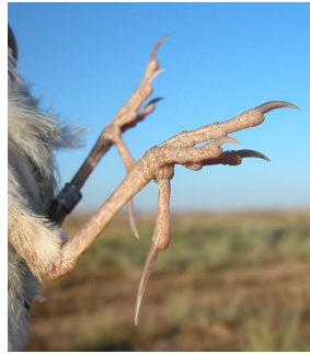
Calandra Lark. Legs colour: left adult (07-VII); right juvenile (06-VII)