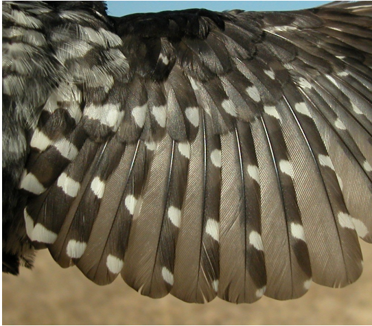
Lesser Spotted Woodpecker. Juvenile. Female: pattern of secondaries (05-I).