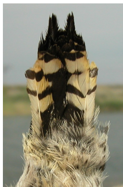
Lesser Spotted Woodpecker. Pattern of upperparts and undertail coverts.