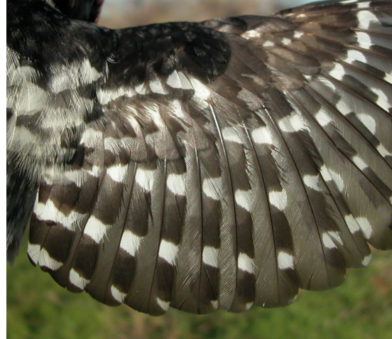
Lesser Spotted Woodpecker. 2nd year. Male: pattern of secondaries (05-I).