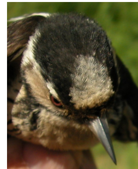
Lesser Spotted Woodpecker. Adult. Sexing. Pattern of crown: left male; right female.