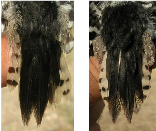
Lesser Spotted Woodpecker. Juvenile. Tail pattern: left male (23-VI); right female (14-VII).