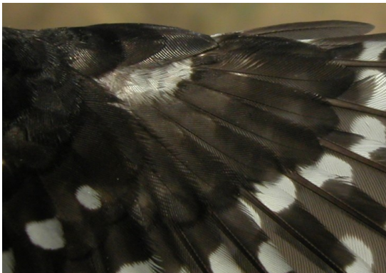
Lesser Spotted Woodpecker. Adult. Male: pattern of primary coverts with all feathers moulted (09-X).