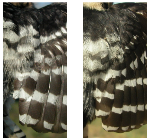
Lesser Spotted Woodpecker. 2nd year. Pattern of tertials: left male (05-I); right female (05-I).