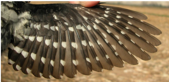
Lesser Spotted Woodpecker. Adult. Female: pattern of wing (02-XI).