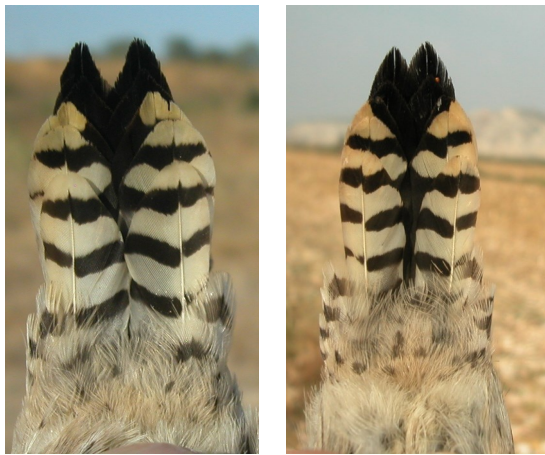
Lesser Spotted Woodpecker. Adult. Pattern of undertail coverts: left male (09-X); right female (02-XI).