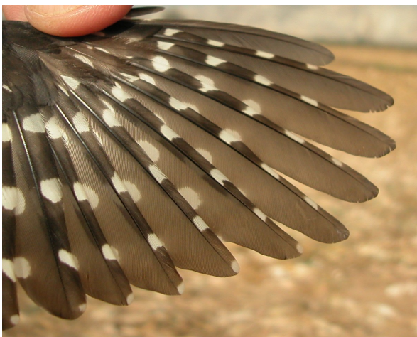
Lesser Spotted Woodpecker. Adult. Female: pattern of primaries (02-XI).