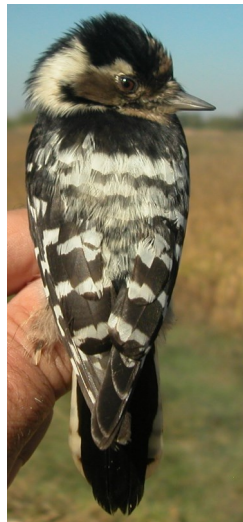
Lesser Spotted Woodpecker. 2nd year. Upperparts pattern: left male (05-I); right female (05-I).