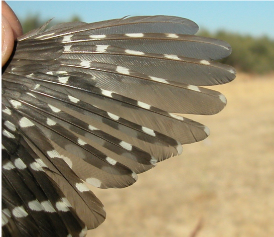
Lesser Spotted Woodpecker. Juvenile. Female: pattern of primaries (05-I).