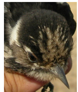
Lesser Spotted Woodpecker. Juvenile. Sexing. Pattern of crown: left male; right female.