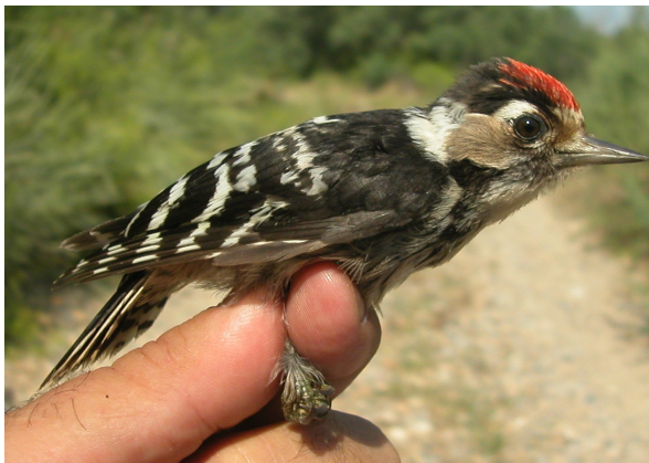
Lesser Spotted Woodpecker. Juvenile. Male (23-VI).