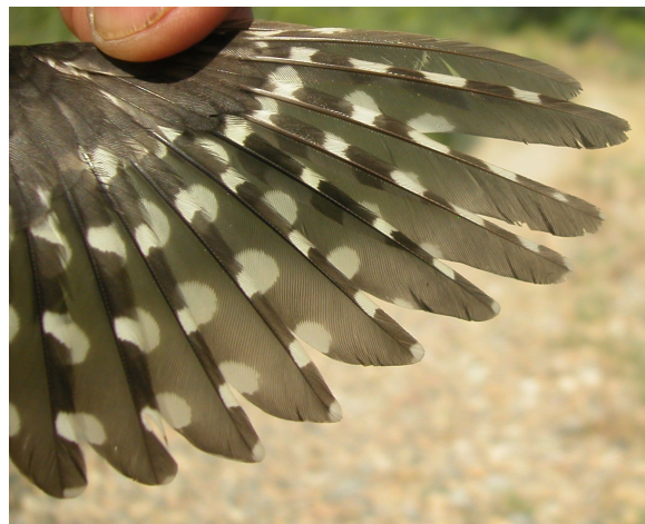
Lesser Spotted Woodpecker. Juvenile. Male: pattern of primaries (23-VI).