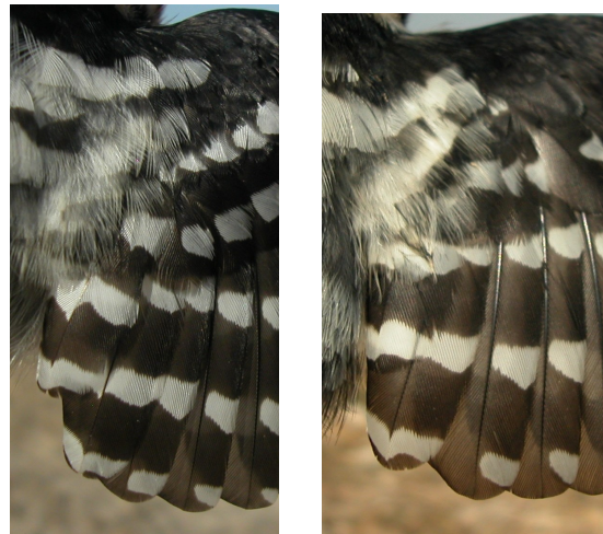
Lesser Spotted Woodpecker. Adult. Pattern of tertials: left male (09-X); right female (02-XI).