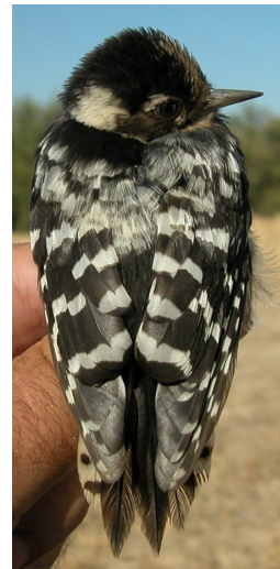
Lesser Spotted Woodpecker. Juvenile. Upperparts pattern: left male (23-VI); right female (14-VII).