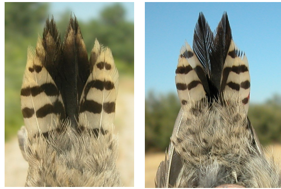
Lesser Spotted Woodpecker. Juvenile. Pattern of tertials: left male (23-VI); right female (14-VII).