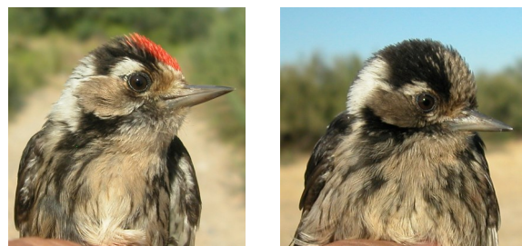
Lesser Spotted Woodpecker. Juvenile. Breast pattern: left male (23-VI); right female (14-VII).