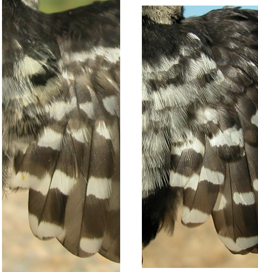
Lesser Spotted Woodpecker. Juvenile. Pattern of tertials: left male (23-VI); right female (14-VII).