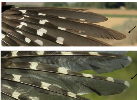
Lesser Spotted Woodpecker Ageing. Pattern of tips of primaries: top adult; bottom juvenile

Adult without moult limits on wing coverts ( CAUTION: sometimes with some brownish primary covert retained); outer primaries without white spots on tips; iris reddish-brown to red.