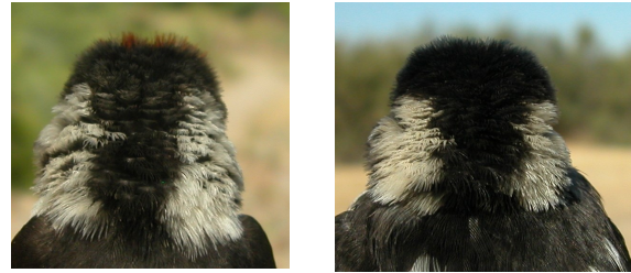
Lesser Spotted Woodpecker. Juvenile. Nape pattern: left male (23-VI); right female (14-VII).