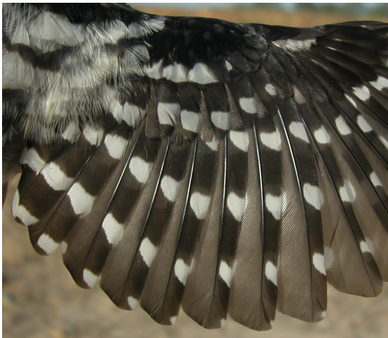
Lesser Spotted Woodpecker. Adult. Male: pattern of secondaries (09-X).