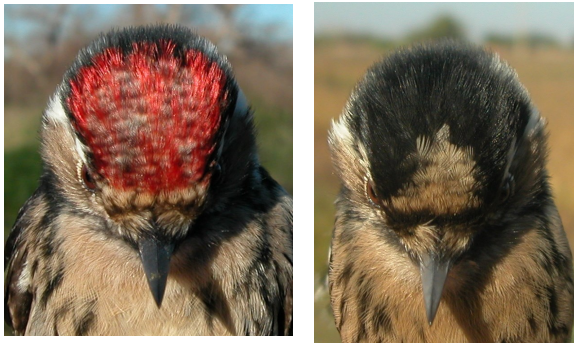
Lesser Spotted Woodpecker. 2nd year. Crown pattern: left male (05-I); right female (05-I).