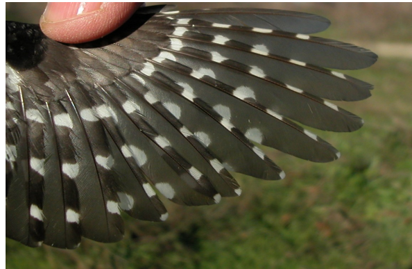
Lesser Spotted Woodpecker. 2nd year. Male: pattern of primaries (05-I).