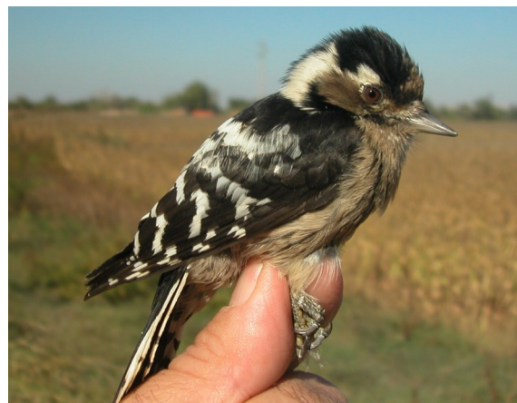
Lesser Spotted Woodpecker. 2nd year. Female (05-I).