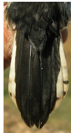
Lesser Spotted Woodpecker. 2nd year. Tail pattern: left male (05-I); right female (05-I).