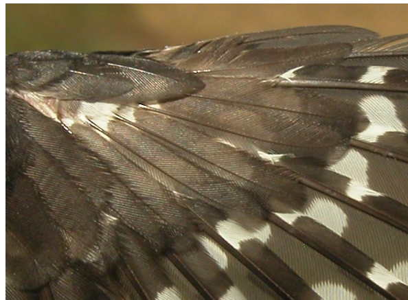
Lesser Spotted Woodpecker. 2nd year. Female: pattern of primary coverts (05-I).