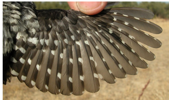
Lesser Spotted Woodpecker. Juvenile. Female: pattern of wing (05-I).