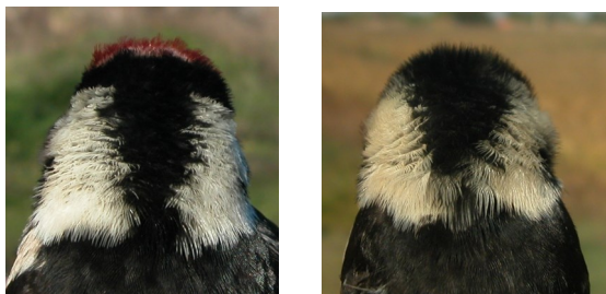
Lesser Spotted Woodpecker. 2nd year. Nape pattern: left male (05-I); right female (05-I).