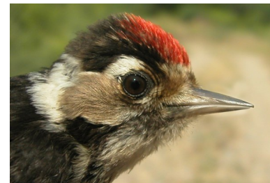
Lesser Spotted Woodpecker. Juvenile. Head pattern and iris colour: top male (23-VI); bottom female (14-VII).