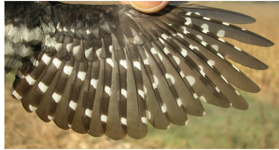
Lesser Spotted Woodpecker. 2nd year. Female: pattern of wing (05-I).