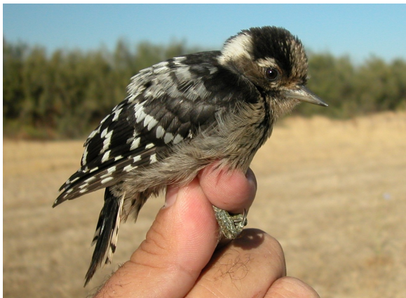
Lesser Spotted Woodpecker. Juvenile. Female (14-VII).