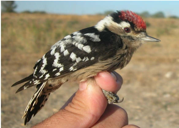
Lesser Spotted Woodpecker. Adult. Male (09-X).