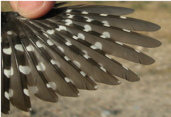
Lesser Spotted Woodpecker. Adult. Male: pattern of primaries (09-X).