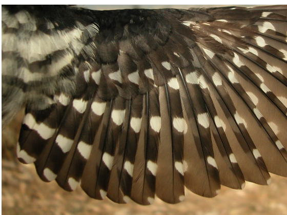
Lesser Spotted Woodpecker. Adult. Female: pattern of secondaries (02-XI).