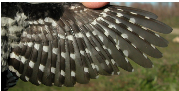
Lesser Spotted Woodpecker. 2nd year. Male: pattern of wing (05-I).