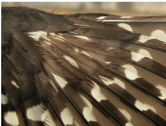
Lesser Spotted Woodpecker. Adult. Female: pattern of primary coverts with some feathers retained (02-XI).