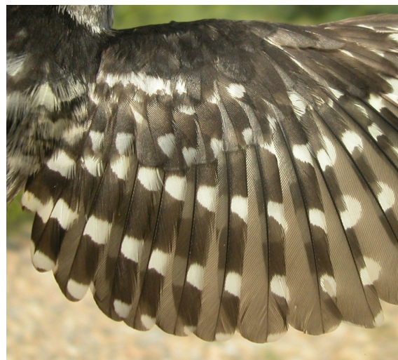
Lesser Spotted Woodpecker. Juvenile. Male: pattern of secondaries (23-VI).