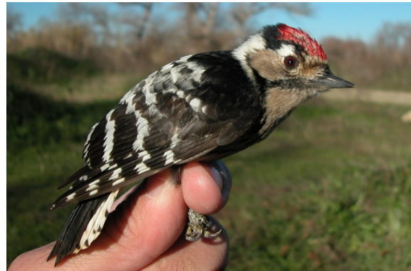
Lesser Spotted Woodpecker. 2nd year. Male (05-I).