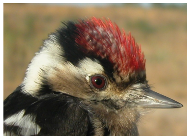
Lesser Spotted Woodpecker. Adult. Head pattern and iris colour: top male (09-X); bottom female (02-XI).