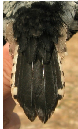
Lesser Spotted Woodpecker. Adult. Tail pattern: left male (09-X); right female (02-XI).