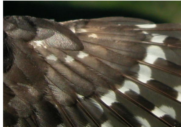
Lesser Spotted Woodpecker. 2nd year. Male: pattern of primary coverts (05-I).