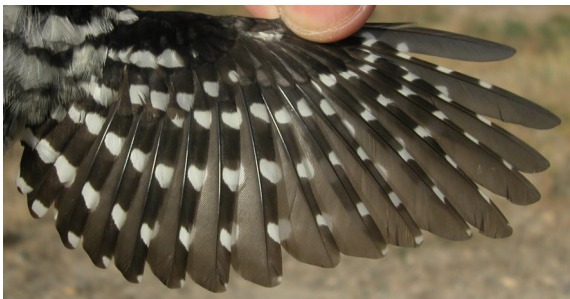
Lesser Spotted Woodpecker. Adult. Male: pattern of wing (09-X).