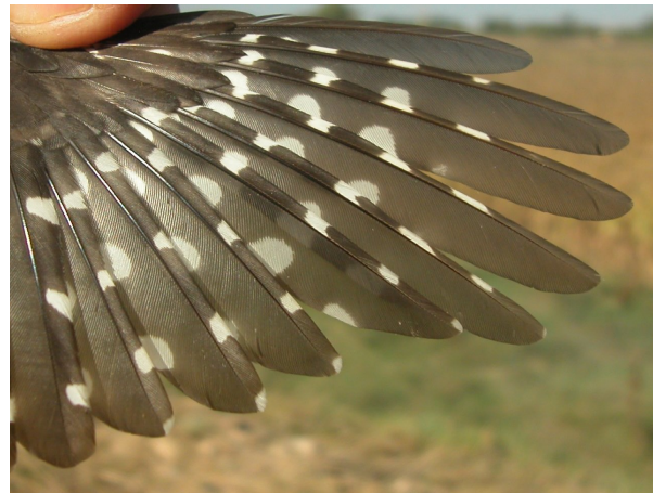
Lesser Spotted Woodpecker. 2nd year. Female: pattern of primaries (05-I).