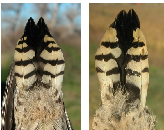
Lesser Spotted Woodpecker. 2nd year. Pattern of undertail coverts: left male (05-I); right female (05-I).