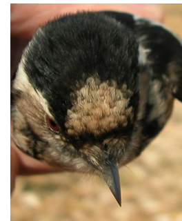
Lesser Spotted Woodpecker. Adult. Crown pattern: left male (09-X); right female (02-XI).