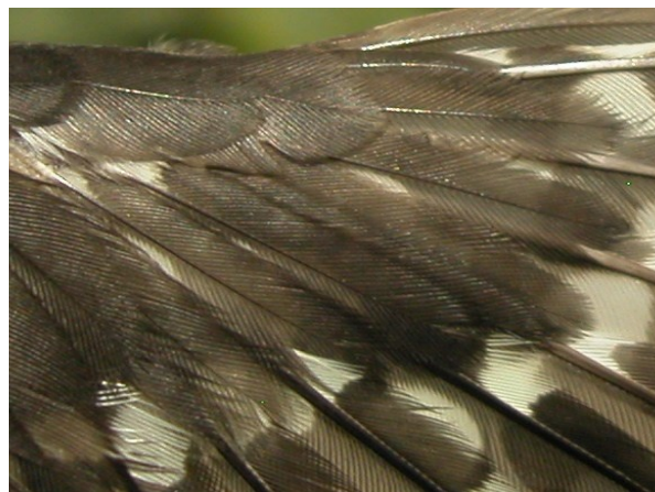
Lesser Spotted Woodpecker. Juvenile. Male: pattern of primary coverts (23-VI).