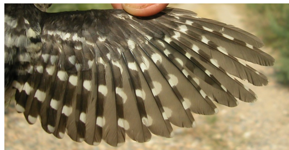
Lesser Spotted Woodpecker. Juvenile. Male: pattern of wing (23-VI).