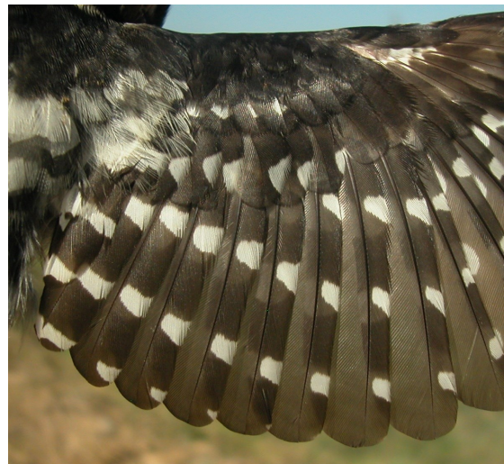
Lesser Spotted Woodpecker. 2nd year. Female: pattern of secondaries (05-I).