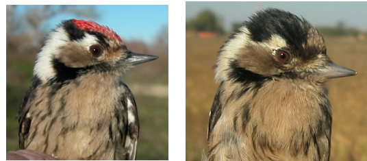
Lesser Spotted Woodpecker. 2nd year. Breast pattern: left male (05-I); right female (05-I).