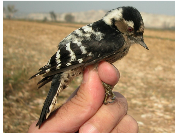
Lesser Spotted Woodpecker. Adult. Female (02-XI).