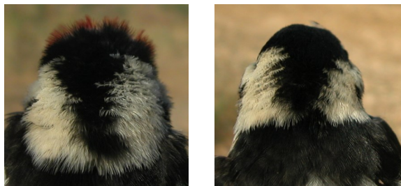
Lesser Spotted Woodpecker. Adult. Nape pattern: left male (09-X); right female (02-XI).