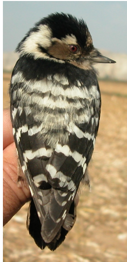
Lesser Spotted Woodpecker. Adult. Upperparts pattern: left male (09-X); right female (02-XI).