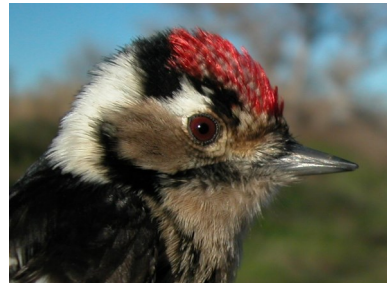
Lesser Spotted Woodpecker. 2nd year. Head pattern and iris colour: top male (05-I); bottom female (05-I).