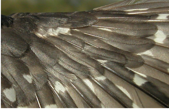
Lesser Spotted Woodpecker. Juvenile. Female: pattern of primary coverts (05-I).