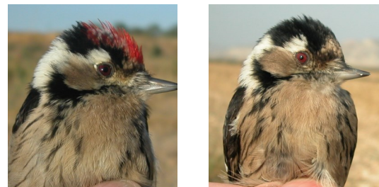
Lesser Spotted Woodpecker. Adult. Breast pattern: left male (09-X); right female (02-XI).