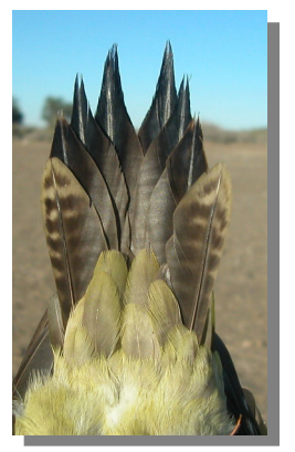
Green Woodpecker. Adult. Pattern of undertail coverts: left male (18-IV); right female (30-I).