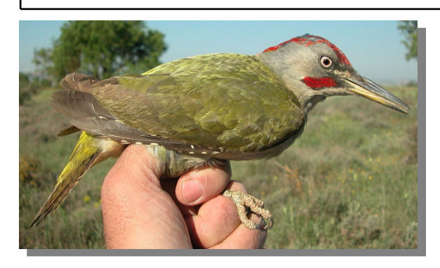
Green Woodpecker. Adult. Male (18-IV).