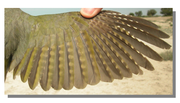
Green Woodpecker. 2nd year. Female: pattern of wing (17-V).