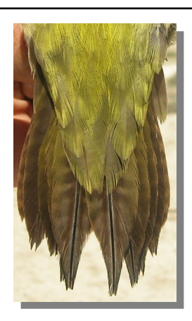
Green Woodpecker. 2nd year. Tail pattern: left male (18-IV); right female (17-V).