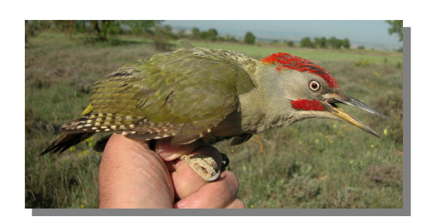
Green Woodpecker. 2nd year. Male (18-IV).