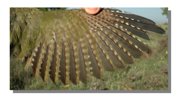
Green Woodpecker. 2nd year. Male: pattern of wing (18-IV).