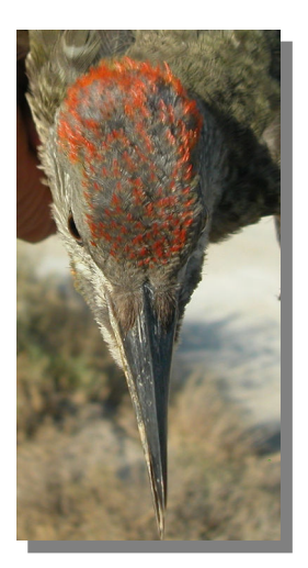
Green Woodpecker. Juvenile. Crown pattern: left male (08-VIII); right male/female (08-VIII).