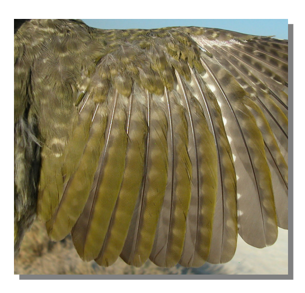
Green Woodpecker. Juvenile. Male/female: pattern of secondaries (08-VIII).