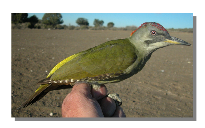
Green Woodpecker. Adult. Female (30-I).