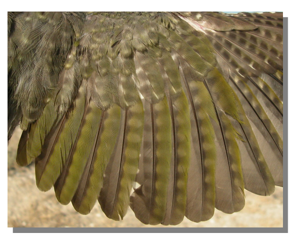
Green Woodpecker. Juvenile. Male: pattern of secondaries (08-VIII).