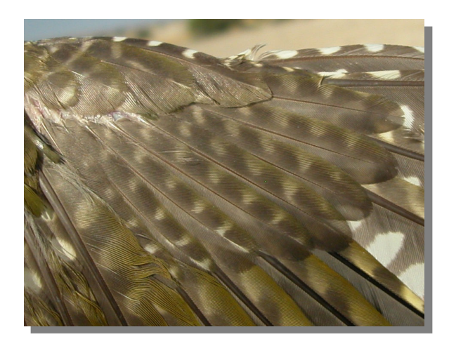
Green Woodpecker. Juvenile. Male/female: pattern of primary coverts (08-VIII).