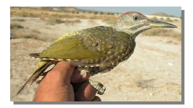
Green Woodpecker. Juvenile. Male/female (08-VIII).