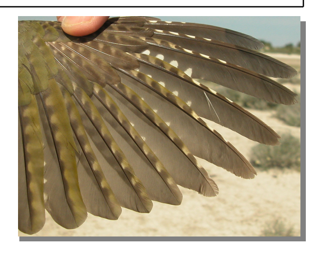
Green Woodpecker. 2nd year. Female: pattern of primaries (17-V).