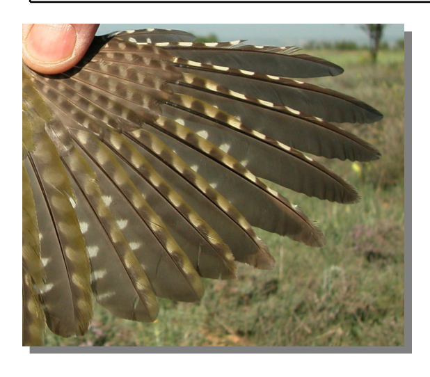
Green Woodpecker. Adult. Male: pattern of primaries (18-IV).