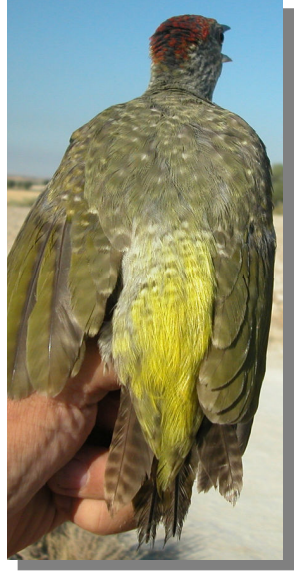
Green Woodpecker. Juvenile. Upperpart pattern: left male (08-VIII); right male/female (08-VIII).