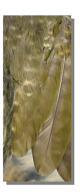
Green Woodpecker. Juvenile. Pattern of tertials: left male (08-VIII); right male/female (08-VIII).