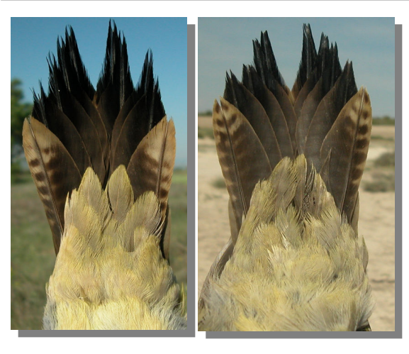
Green Woodpecker. 2nd year. Pattern of undertail coverts: left male (18-IV); right female (17-V).