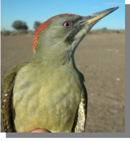
Green Woodpecker. Adult. Breast pattern: left male (18-IV); right female (30-I).