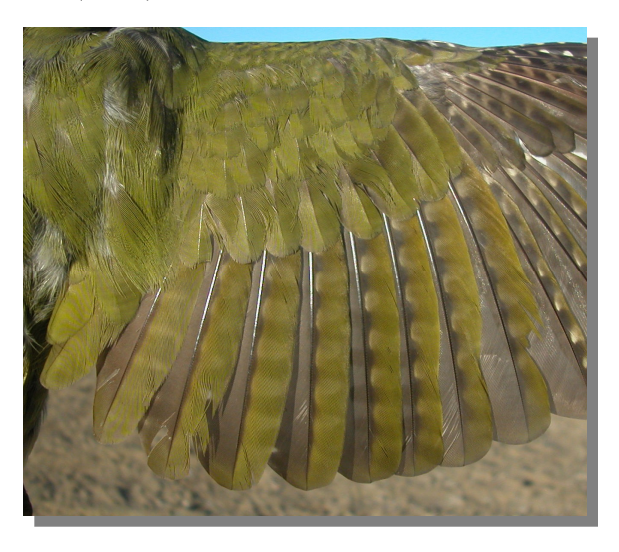
Green Woodpecker. Adult. Female: pattern of secondaries (30-I).