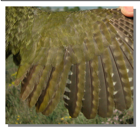
Green Woodpecker. Adult. Male: pattern of secondaries (18-IV).