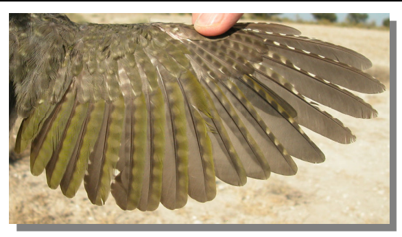
Green Woodpecker. Juvenile. Male: pattern of wing (08-VIII).