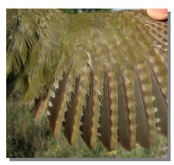
Green Woodpecker. 2nd year. Male: pattern of secondaries (18-IV).