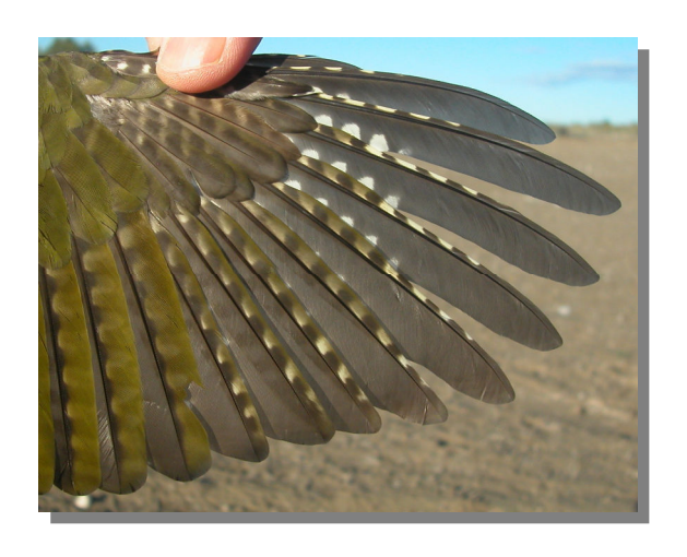
Green Woodpecker. Adult. Female: pattern of primaries (30-I).