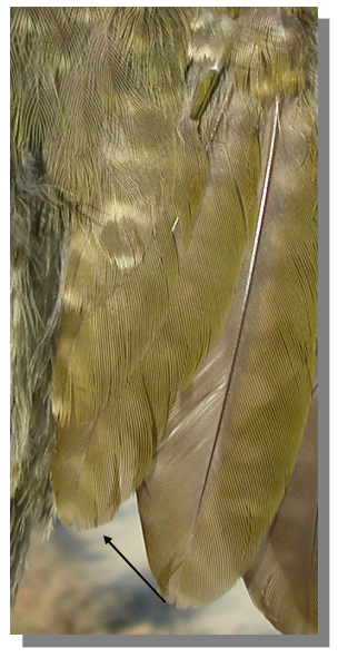
Green Woodpecker. Ageing. Pattern of tertials: left adult; right juvenile.