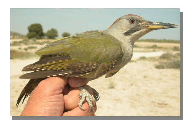
Green Woodpecker. 2nd year. Female (17-V).