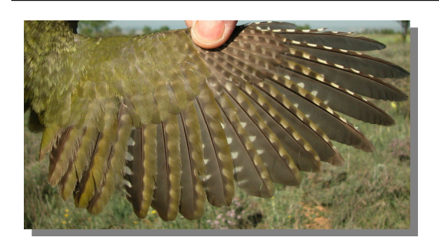
Green Woodpecker. Adult. Male: pattern of wing (18 -IV).