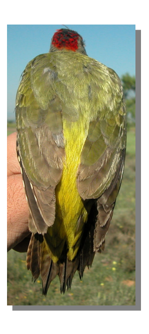
SIMILAR SPECIES This species is unmistakable