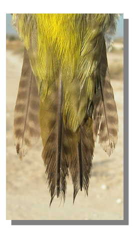
Green Woodpecker. Juvenile. Tail pattern: left male (08-VIII); right male/female (08-VIII).