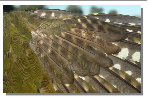
Green Woodpecker. Adult. Female: pattern of primary coverts (30-I).