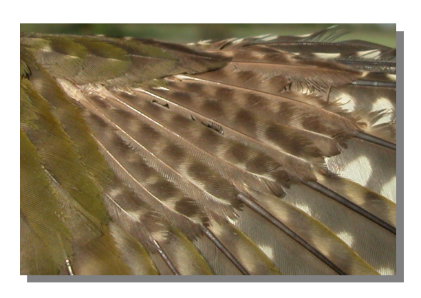
Green Woodpecker. 2nd year. Male: pattern of primary coverts (18-IV).