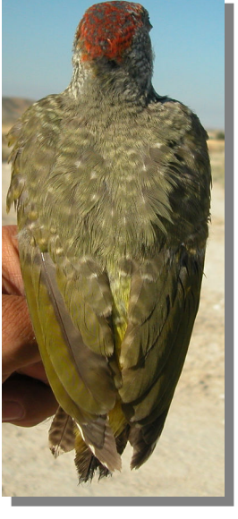
Green Woodpecker. Ageing. Pattern of upperparts: left adult; right juvenile.