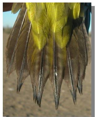
Green Woodpecker. Adult. Tail pattern: left male (18 -IV); right female (30-I).