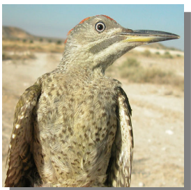
Green Woodpecker. Ageing. Pattern of breast: left adult; right juvenile.