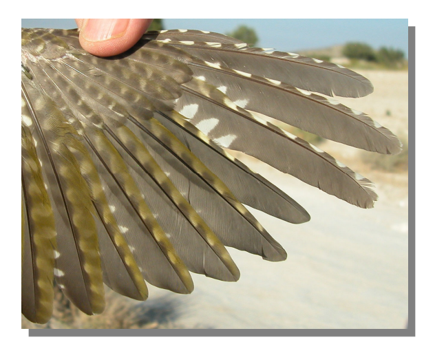
Green Woodpecker. Juvenile. Male/female: pattern of primaries (08-VIII).