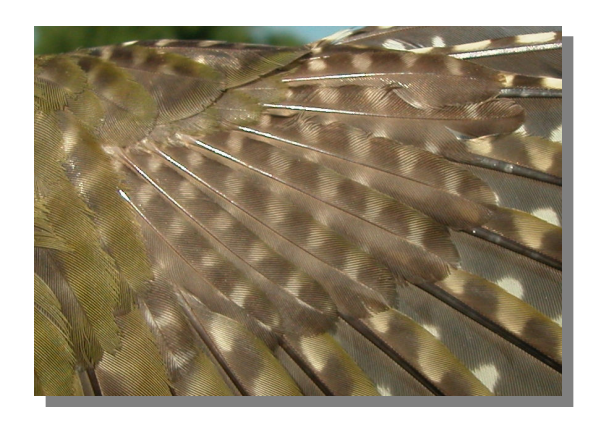
Green Woodpecker. Adult. Male: pattern of primary coverts (18-IV).