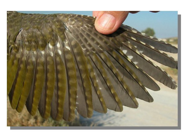
Green Woodpecker. Juvenile. Male/female: pattern of wing (08-VIII).