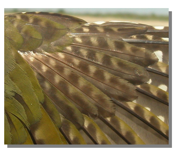
Green Woodpecker. 2nd year. Female: pattern of primary coverts (17-V).