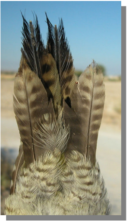
Green Woodpecker. Juvenile. Pattern of undertail coverts: left male (08-VIII); right male/female (08-VIII).