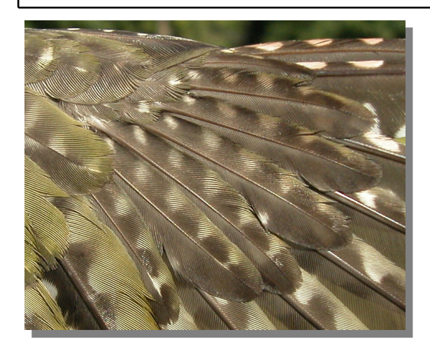
Green Woodpecker. Juvenile. Male: pattern of primary coverts (08-VIII).