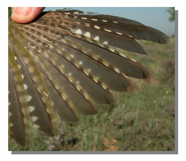
Green Woodpecker. 2nd year. Male: pattern of primaries (18-IV).