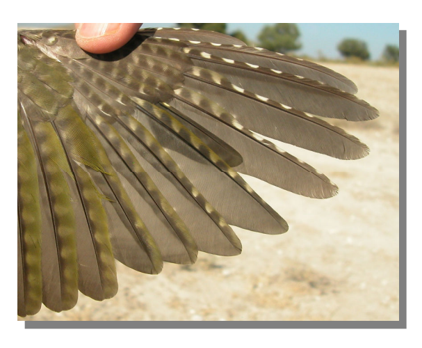
Green Woodpecker. Juvenile. Male: pattern of primaries (08-VIII).