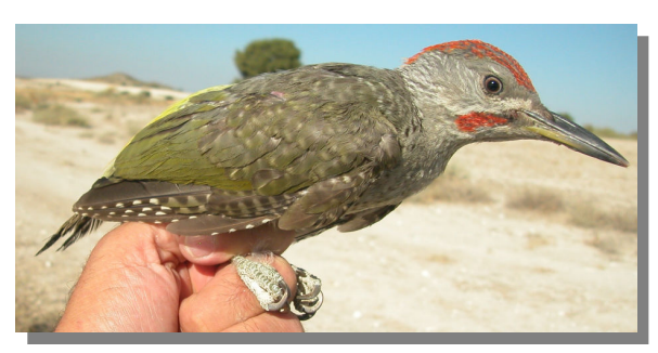
Green Woodpecker. Juvenile. Male (08-VIII).