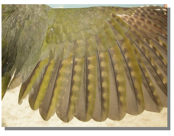
Green Woodpecker. 2nd year. Female: pattern of secondaries (17-V).