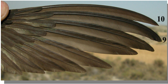
Common Swift. Wing formula: usually 9th primary longer than the 10th.