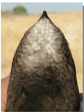
Common Swift. Throat pattern: small white patch.