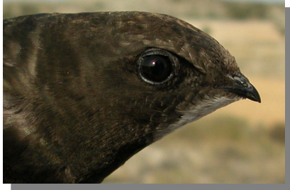
Common Swift. Head pattern: dark head with poorly noticeably dark area around the eye.

Check the head pattern, pale patch on throat, flank pattern, plumage tone, tail pattern and wing formula.