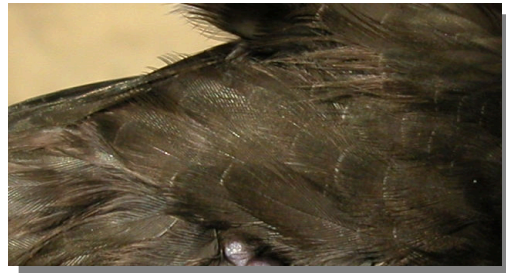
Common Swift. Pattern of flanks: feathers with white edge on tips poorly marked.