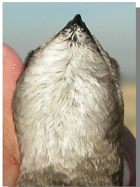
Pallid Swift. Throat pattern: large white patch.