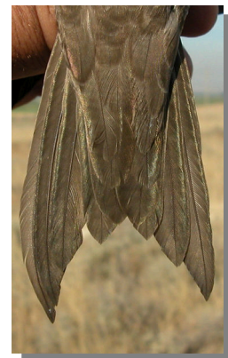
Pallid Swift. Tail pattern: with short fork.