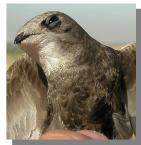
Pallid Swift. Plumage tone: quite pale feathers.