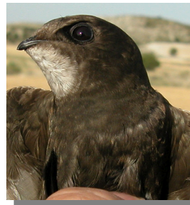
Common Swift. Plumage tone: quite dark feathers.