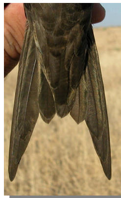
Common Swift. Tail pattern: with long fork.