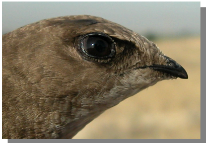
Pallid Swift. Head pattern: pale head with noticeably dark area around the eye.