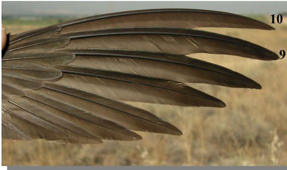
Pallid Swift. Wing formula: usually 9th primary of the same length as the 10th.