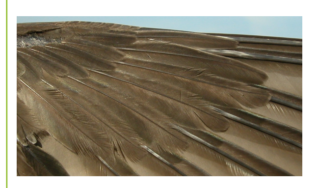
Alpine Swift. 2nd year: pattern of primary coverts (10-VII)