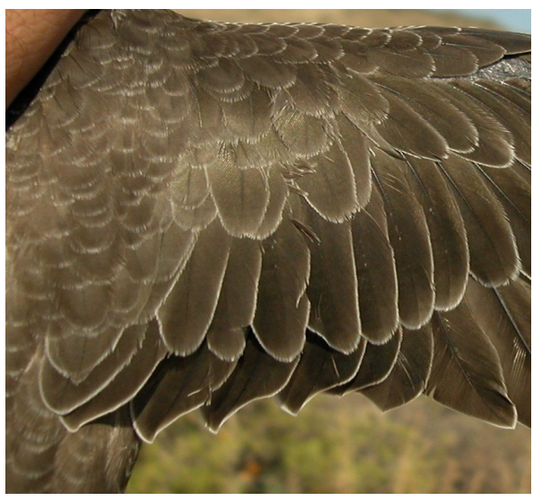
Alpine Swift. Juvenile: pattern of wing coverts and secondaries (21-VIII)