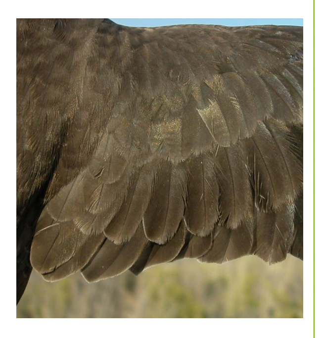
Alpine Swift. Adult: pattern of wing coverts and secondaries (10-VII)