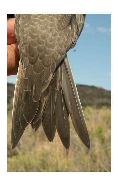
Alpine Swift. Juvenile: pattern of the outermost tail feather (21-VIII)