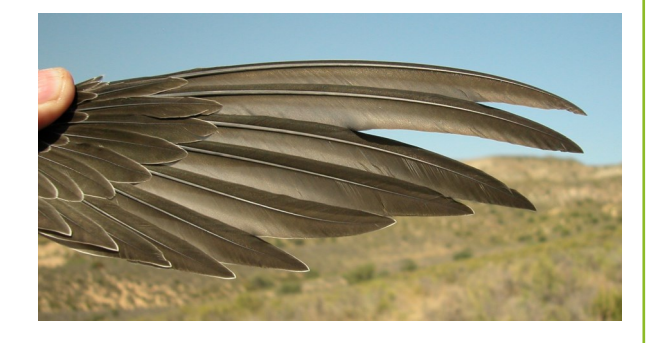
Alpine Swift. Juvenile: pattern of primaries (21-VIII)