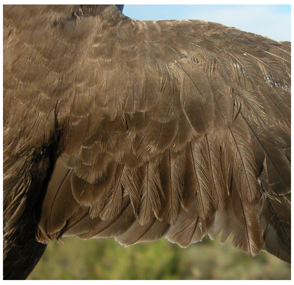
Alpine Swift. 2nd year: pattern of wing coverts and secondaries (10-VII)