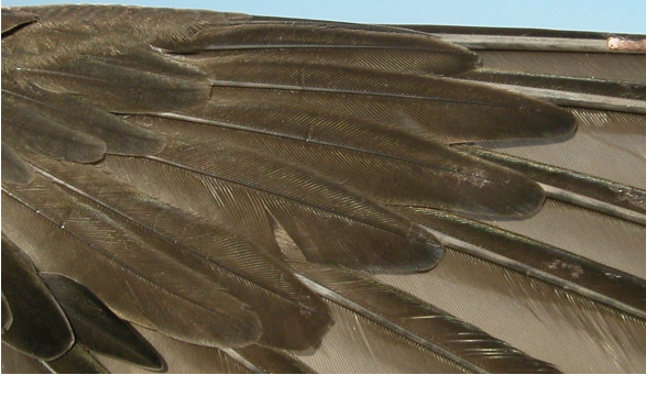
Alpine Swift. Adult: pattern of primary coverts (10-VII)