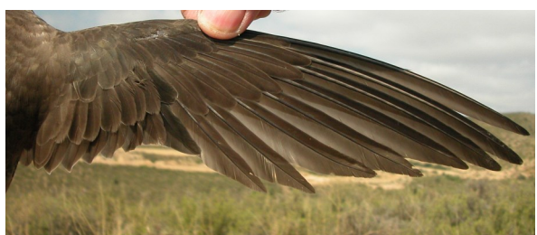
Alpine Swift. Adult: pattern of wing (10-VII).

http://blascozumeta.com http://www.aranzadi.eus