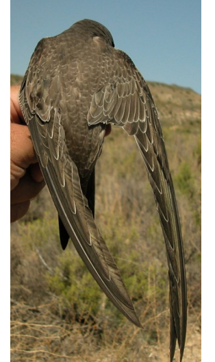
Alpine Swift. Upperpart pattern: top left adult (10-VII); top right 2nd year (10-VII); left juvenile (21-VIII)