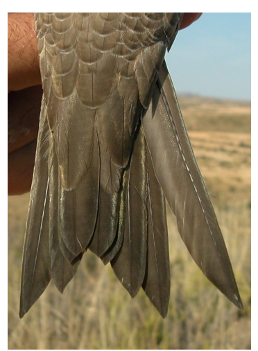
Alpine Swift. 2nd year: pattern of the outermost tail feather (10-VII)