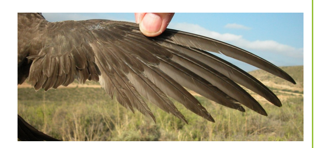
Alpine Swift. 2nd year: pattern of wing (10-VII).