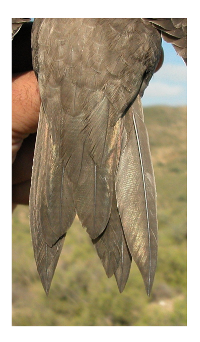
Alpine Swift. Adult: pattern of the outermost tail feather (10-VII)