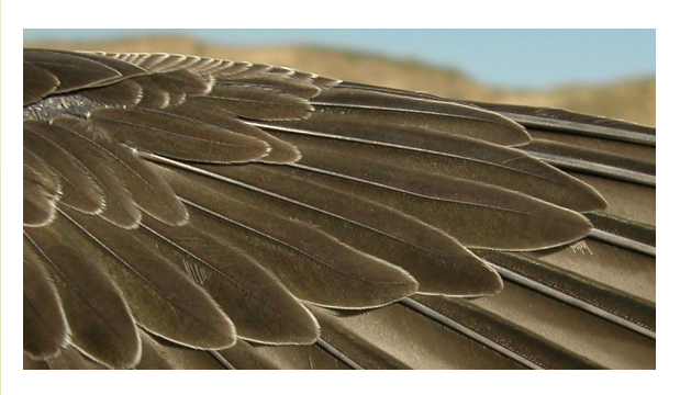
Alpine Swift. Juvenile: pattern of primary coverts (21-VIII)