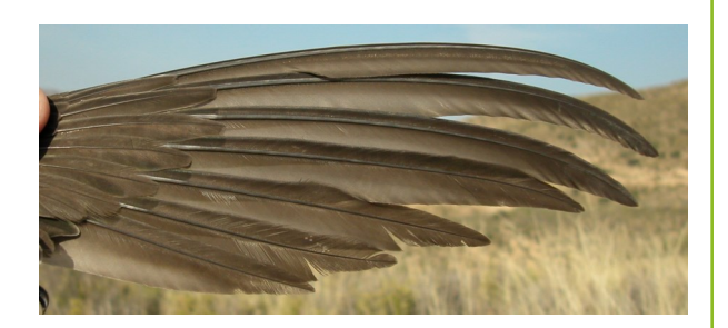
Alpine Swift. 2nd year: pattern of primaries (10-VII)