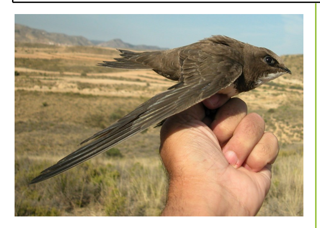
Alpine Swift. Adult (10-VII).