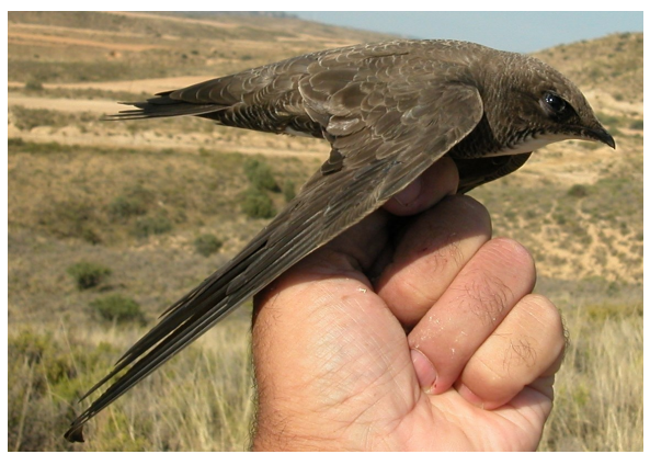
Alpine Swift. 2nd year (10-VII).