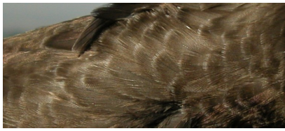
Pallid Swift. Flank pattern: top adult (01-VII); middle 2nd year (01-VII); bottom juvenile (01-VII)