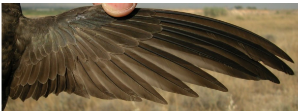
Pallid Swift. Adult with complete moult: pattern of wing (01-VII)