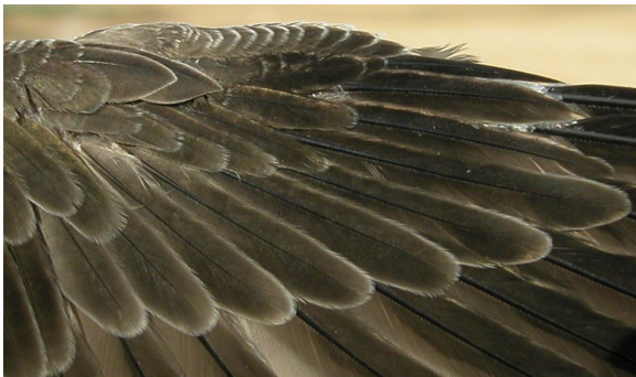
Pallid Swift. Juvenile: pattern of primary coverts (01-VII)