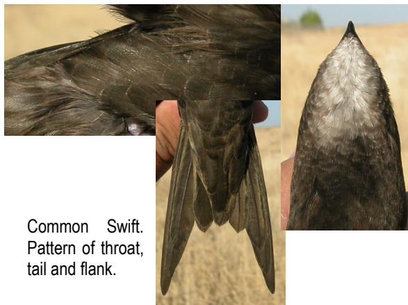
Common Swift. Pattern of throat, tail and flank.

Very similar to Common Swift , with smaller pale patch on throat, flanks with only a little pale streaked, darker plumage and more forked tail.