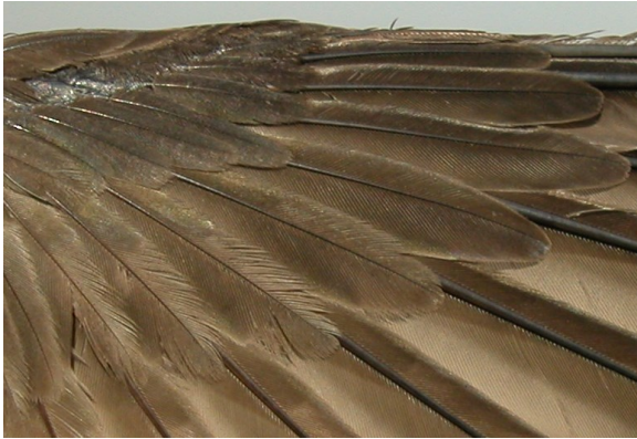
Pallid Swift. 2nd year: pattern of primary coverts (01-VII)