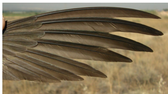
Pallid Swift. Adult with complete moult: pattern of primaries (01-VII)