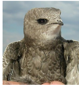
Pallid Swift. Breast pattern: top left adult (01-VII); top right 2nd year (01-VII); left juvenile (01-VII)