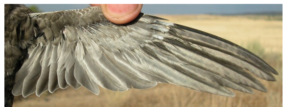
Pallid Swift. Juvenile: pattern of wing (01-VII)