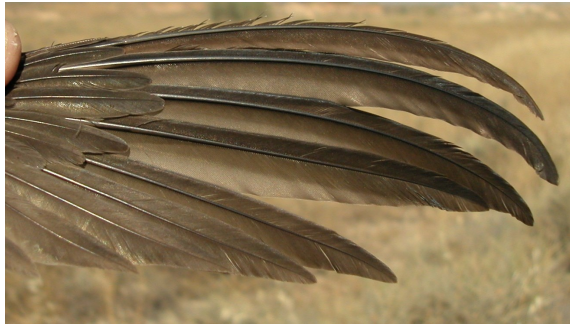
Pallid Swift. 2nd year: pattern of primaries (01-VII)