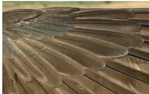
Pallid Swift. Adult with complete moult: pattern of primary coverts (01-VII)