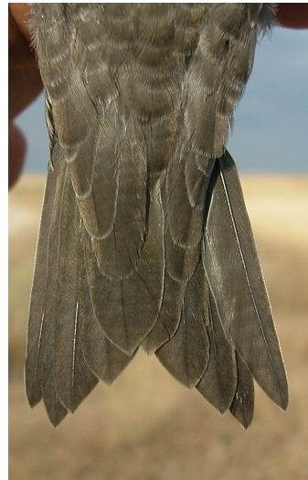
Pallid Swift. Juvenile: pattern of tail and the outermost feather (01-VII)