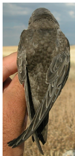
Pallid Swift. Upperpart pattern: top left adult (01-VII); top right 2nd year (01-VII); left juvenile (01-VII)