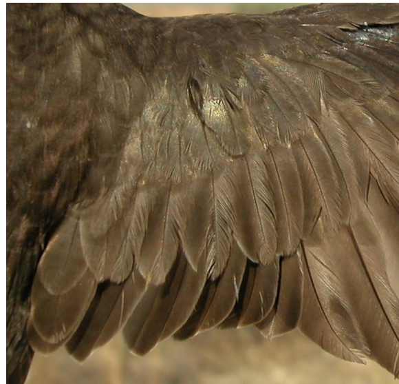
Pallid Swift. 2nd year: pattern of secondaries and wing coverts (01-VII)