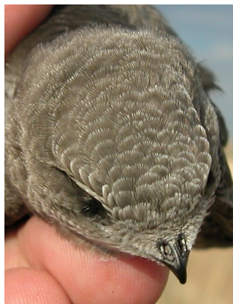
Pallid Swift. Crown pattern: top left adult (01-VII); top right 2nd year (01-VII); left juvenile (01-VII)