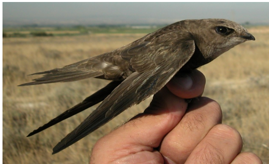
Pallid Swift. Adult (01-VII).