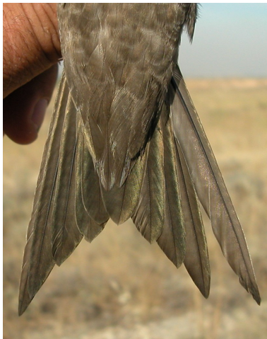
Pallid Swift. Adult: pattern of tail and the outermost feather (01-VII)