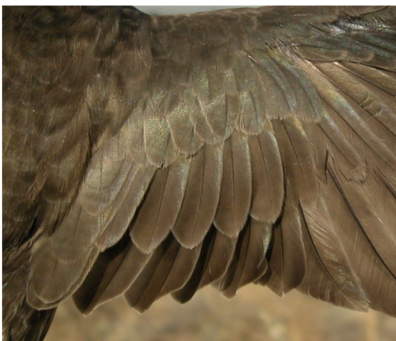
Pallid Swift. Adult: pattern of secondaries and wing coverts (01-VII)