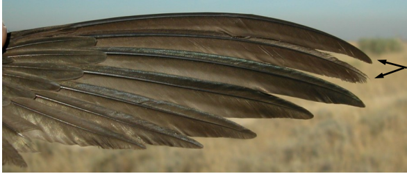
Pallid Swift. Adult with retained feathers: pattern of primaries (01-VII)