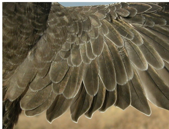
Pallid Swift. Juvenile: pattern of secondaries and wing coverts (01-VII)