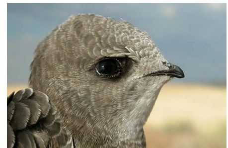
Pallid Swift. Head pattern: top adult (01-VII); middle 2nd year (01-VII); bottom juvenile (01-VII)