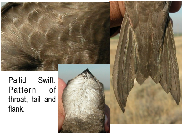
Pallid Swift. Pattern of throat, tail and flank.

14-16 cm. Plumage brown-greyish; whitish throat; feathers on flanks with diffuse pale edges; secondaries lighter above than the rest of the wing; long and arched wings; forked tail.