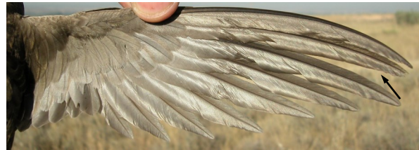
Pallid Swift. Adult with retained feathers: pattern of wing (01-VII)