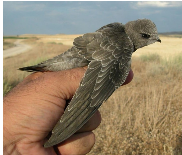
Pallid Swift. Juvenile (01-VII).