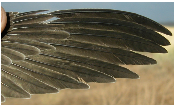
Pallid Swift. Juvenile: pattern of primaries (01-VII)