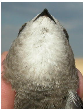
Pallid Swift. Throat pattern: top left adult (01-VII); top right 2nd year (01-VII); left juvenile (01-VII)