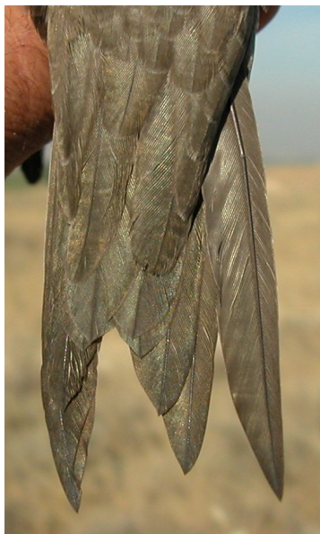
Pallid Swift. 2nd year: pattern of tail and the outermost feather (01-VII)