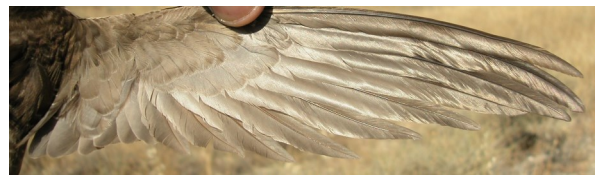
Pallid Swift. 2nd year: pattern of wing (01-VII)