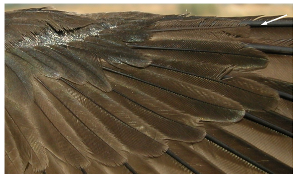
Pallid Swift. Adult with retained feathers: pattern of primary coverts (01-VII)