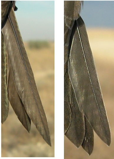
Pallid Swift. Ageing. Pattern of the outermost tail feather: left adult (01-VII); right juvenile (01-VII).