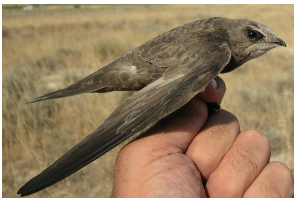
Pallid Swift. 2nd year (01-VII).