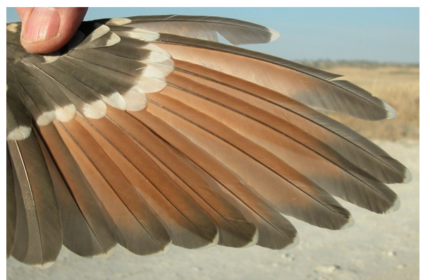
Great Spotted Cuckoo. Juvenile: pattern of primaries (02-VI).