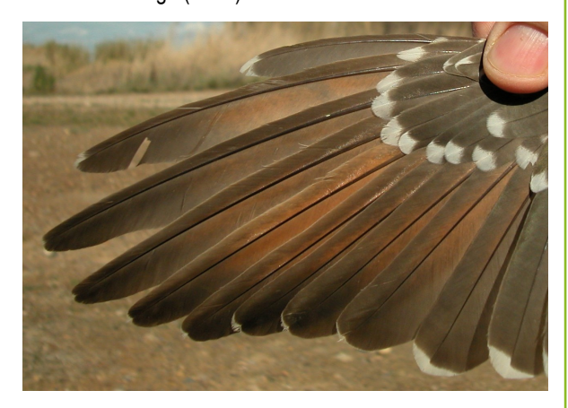
Great Spotted Cuckoo. 2nd year: pattern of primaries with reddish tinge (08-IV)