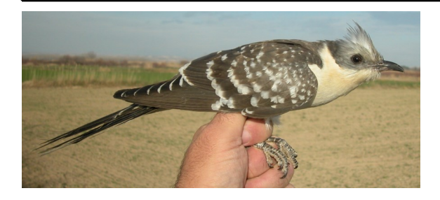
Great Spotted Cuckoo. Adult (28-II)