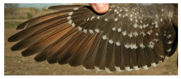
Great Spotted Cuckoo. 2nd year with reddish tinge on primaries and complete moult: pattern of wing (08-IV)