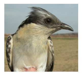
Great Spotted Cuckoo. Ageing. Pattern of throat and breast: top adult; bottom juvenile.