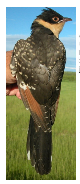
Great Spotted Cuckoo. Upperparts pattern: top left adult (28-II); top right 2nd year (08-IV); left juvenile (02-VI).