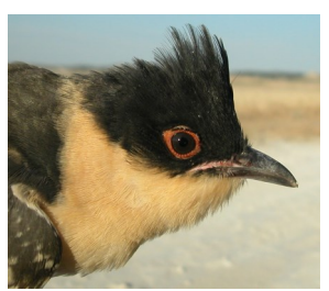
Great Spotted Cuckoo. Ageing. Pattern of head: top adult; bottom juveni-