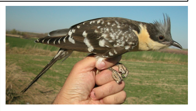
Great Spotted Cuckoo. 2nd year with soft ochre tinge on primaries (22-III)