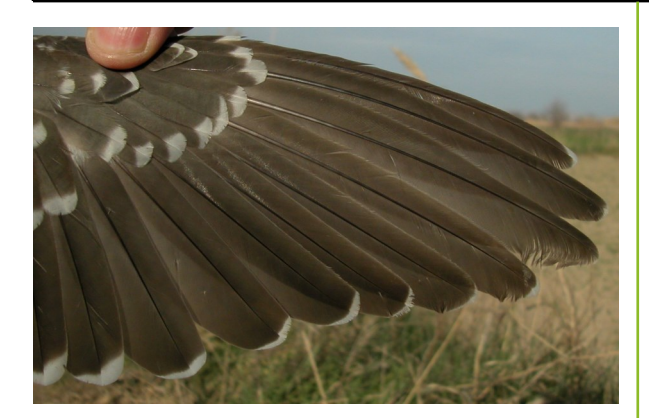
Great Spotted Cuckoo. Adult: pattern of primaries (28-II)