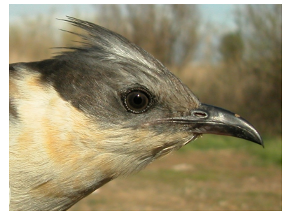
Great Spotted Cuckoo. Head pattern: top adult (28-II); middle 2nd year (08-IV); bottom juvenile (02-VI).