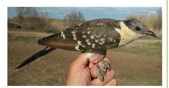
Great Spotted Cuckoo. 2nd year with ochre tinge on primaries (08-IV)