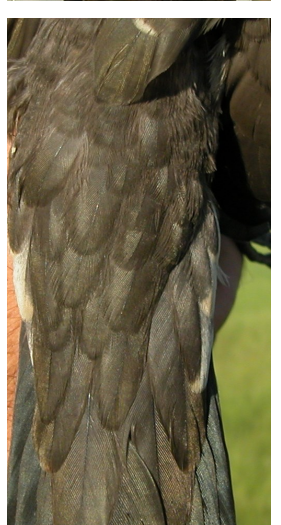
Great Spotted Cuckoo. Rump pattern: top left adult (28-II); top right 2nd year (08-IV); left juvenile (02-VI).