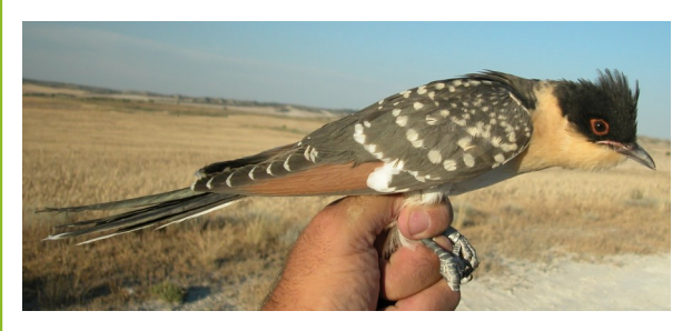
Great Spotted Cuckoo. Juvenile (02-VI)