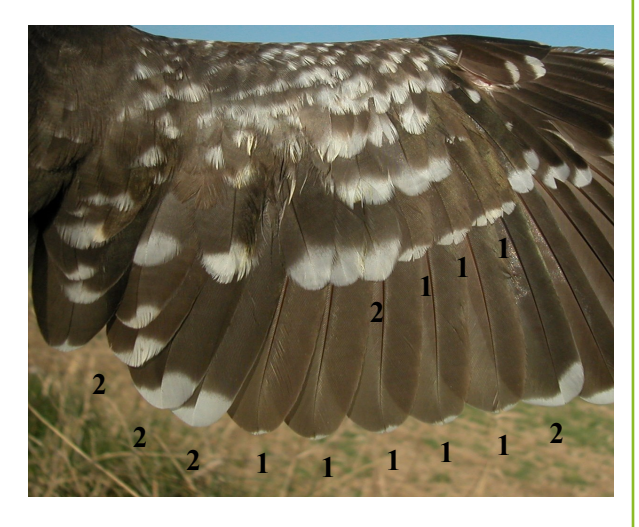
Great Spotted Cuckoo. 2nd year with retained feathers: pattern of secondaries and wing coverts (1 juvenile feathers, 2 adult feathers) (08-IV)