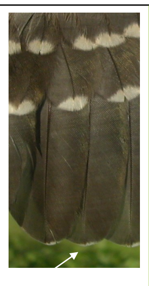
Great Spotted Cuckoo. Ageing. Pattern of secondaries: left adult; right juvenile.