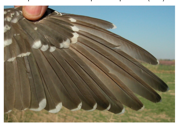
Great Spotted Cuckoo. 2nd year: pattern of primaries with soft reddish tinge (22-III).