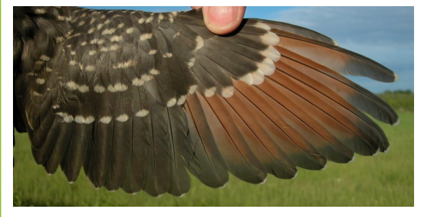
Great Spotted Cuckoo. Juvenile: pattern of wing (02-VI)