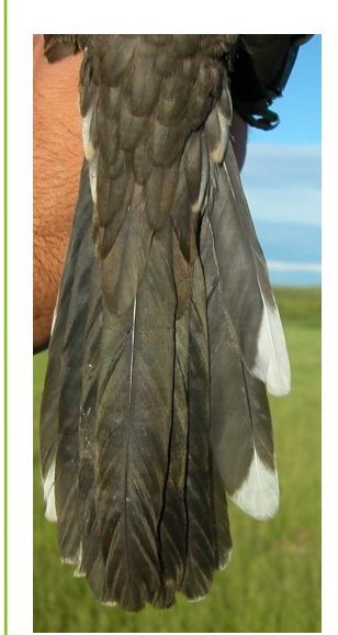
Great Spotted Cuckoo. Tail pattern: top left adult (28-II); top right 2nd year (08-IV); left juvenile (02-VI).