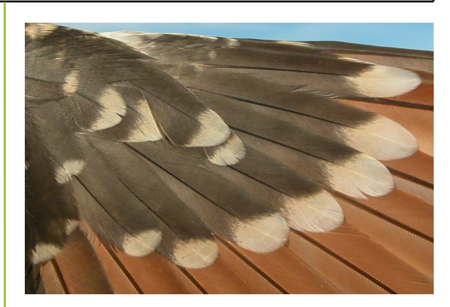
Great Spotted Cuckoo. Juvenile: pattern of primary coverts (02-VI)