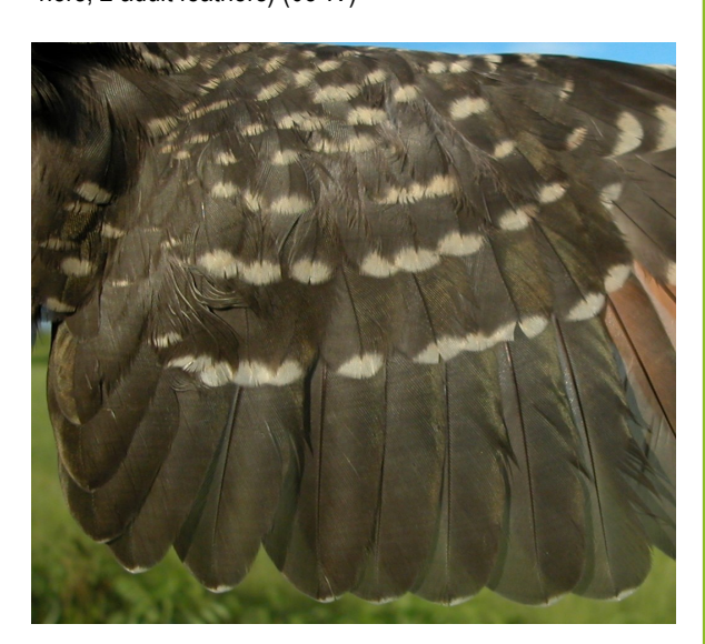
Great Spotted Cuckoo. Juvenile: pattern of secondaries and wing coverts (02-VI)