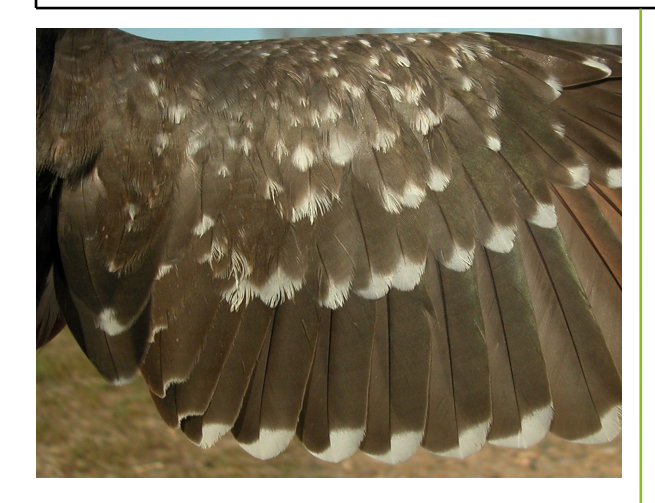
Great Spotted Cuckoo. 2nd year with complete moult: pattern of secondaries and wing coverts (08-IV)