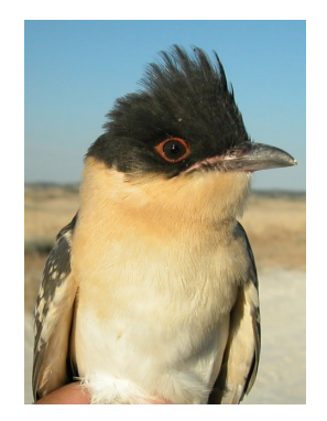
Great Spotted Cuckoo. Breast pattern: top left adult (28-II); top right 2nd year (08-IV); left juvenile (02-VI).