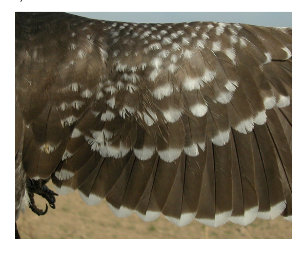
Great Spotted Cuckoo. Adult with complete moult: pattern of secondaries and wing coverts (28-II)