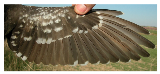
Great Spotted Cuckoo. 2nd year with soft reddish tinge on primaries and partial moult: pattern of wing (08-IV)