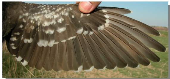
Great Spotted Cuckoo. 2nd year with soft reddish tinge on primaries and partial moult: pattern of wing (08-IV)