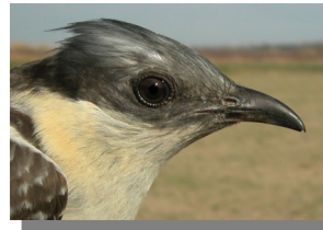
Great Spotted Cuckoo. Ageing. Pattern of head: top adult; bottom juvenile.

Adult with grey crown; upperparts grey spotted white; throat and breast pale yellow; grey primaries; secondaries with a big white spot at tip. CAUTION: if some secondary remains unmoulted, then there are two ages of feathers although all them have tips with a similar big white spot.