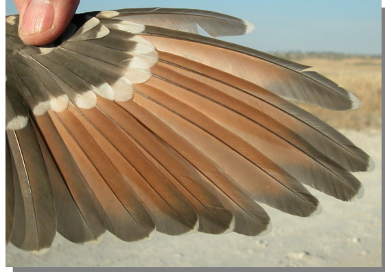
Great Spotted Cuckoo. Juvenile: pattern of primaries (02-VI).