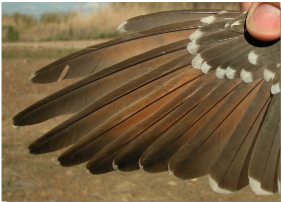
Great Spotted Cuckoo. 2nd year: pattern of primaries with reddish tinge (08-IV)