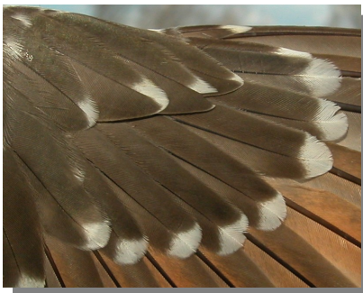
Great Spotted Cuckoo. 2nd year: pattern of primary coverts (08-IV)