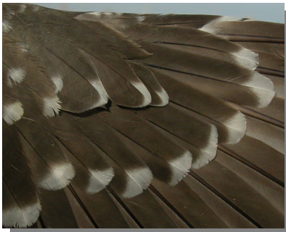
Great Spotted Cuckoo. Adult: pattern of primary coverts (28-II)