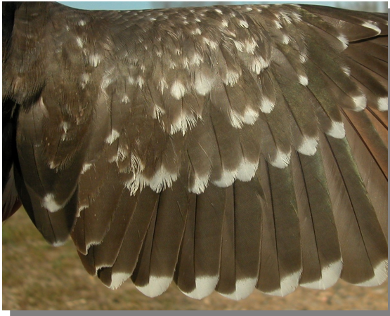
Great Spotted Cuckoo. 2nd year with complete moult: pattern of secondaries and wing coverts (08-IV)