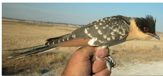
Great Spotted Cuckoo. Juvenile (02-VI)