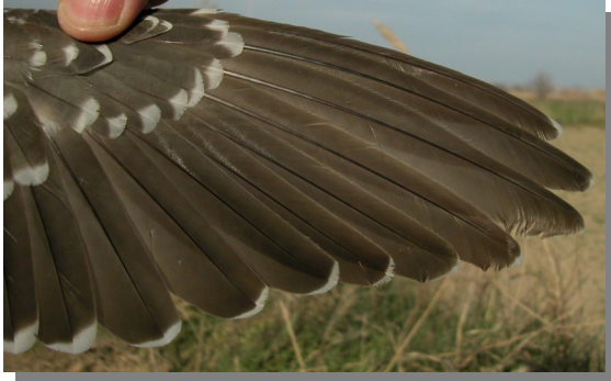
Great Spotted Cuckoo. Adult: pattern of primaries (28-II)