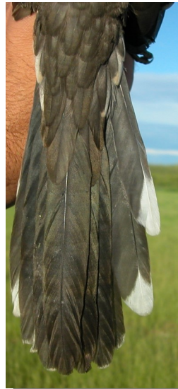
Great Spotted Cuckoo. Tail pattern: top left adult (28-II); top right 2nd year (08-IV); left juvenile (02-VI).