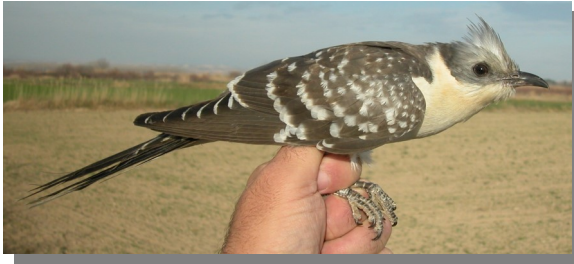
Great Spotted Cuckoo. Adult (28-II)