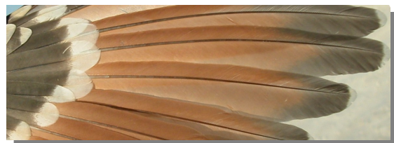
Great Spotted Cuckoo. Ageing. Pattern of primaries: top adult; bottom juvenile.