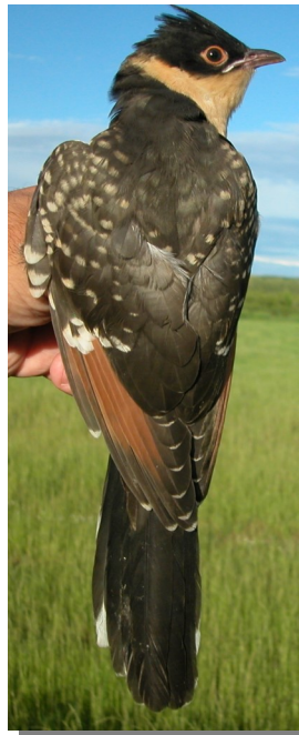
Great Spotted Cuckoo. Upperparts pattern: top left adult (28-II); top right 2nd year (08-IV); left juvenile (02-VI).