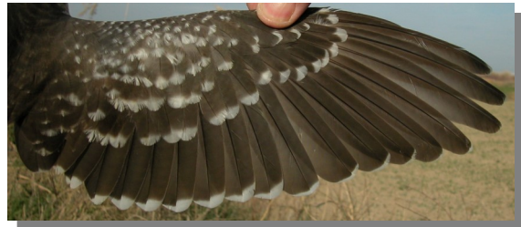
Great Spotted Cuckoo. Adult with complete moult: pattern of wing (28-II)