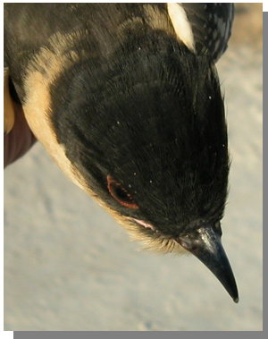
Great Spotted Cuckoo. Crown pattern: top left adult (28-II); top right 2nd year (08-IV); left juvenile (02-VI).