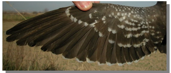
Great Spotted Cuckoo. Adult with retained feathers: pattern of wing (28-II)