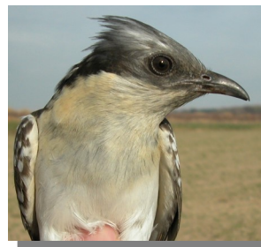
Great Spotted Cuckoo. Ageing. Pattern of throat and breast: top adult; bottom juvenile.