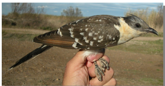
Great Spotted Cuckoo. 2nd year with ochre tinge on primaries (08-IV)

Summer visitor. Very common in the Ebro Basin and scarce in other parts of the Region.