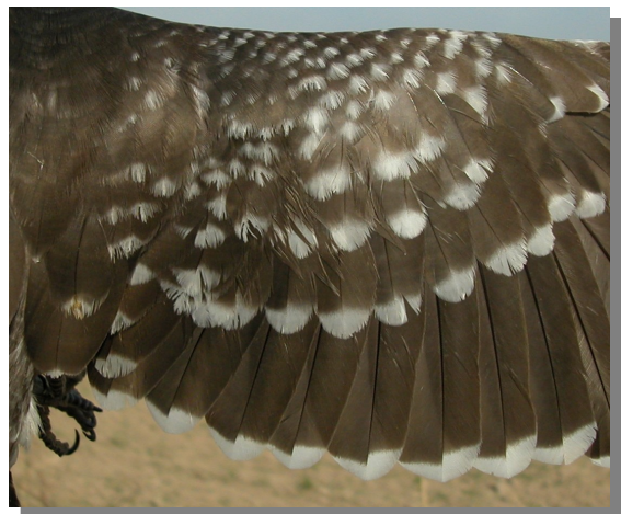
Great Spotted Cuckoo. Adult with complete moult: pattern of secondaries and wing coverts (28-II)