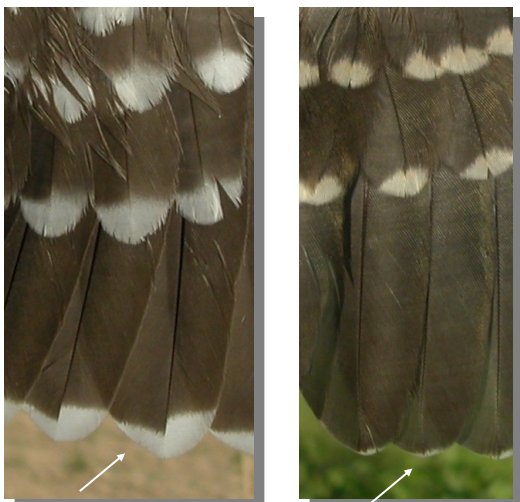
Great Spotted Cuckoo. Ageing. Pattern of secondaries: left adult; right juvenile.