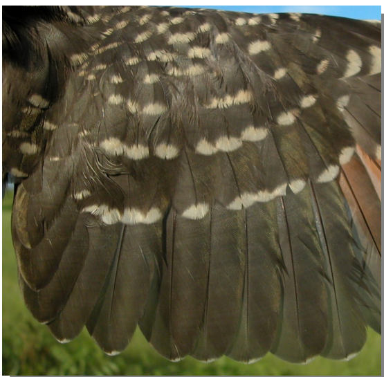
Great Spotted Cuckoo. Juvenile: pattern of secondaries and wing coverts (02-VI)