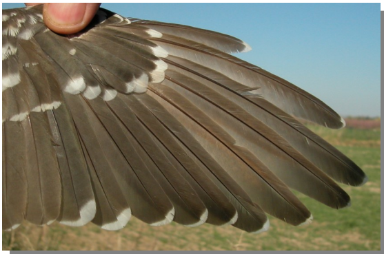
Great Spotted Cuckoo. 2nd year: pattern of primaries with soft reddish tinge (22-III).