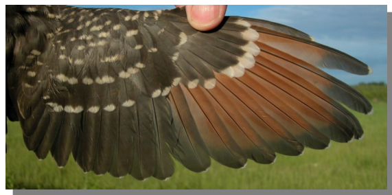
Great Spotted Cuckoo. Juvenile: pattern of wing (02-VI)