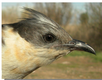
Great Spotted Cuckoo. Head pattern: top adult (28-II); middle 2nd year (08-IV); bottom juvenile (02-VI).