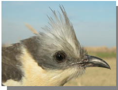
Great Spotted Cuckoo. Adult. Pattern of head.

39-45 cm. Adult with grey upperparts strongly white spotted; yellowish underparts; long tail; head with a crest; brownish primaries. Juveniles with reddish primaries; without crest on head; deep yellow underparts.