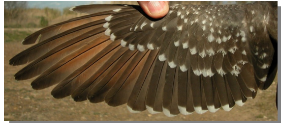
Great Spotted Cuckoo. 2nd year with reddish tinge on primaries and complete moult: pattern of wing (08-IV)