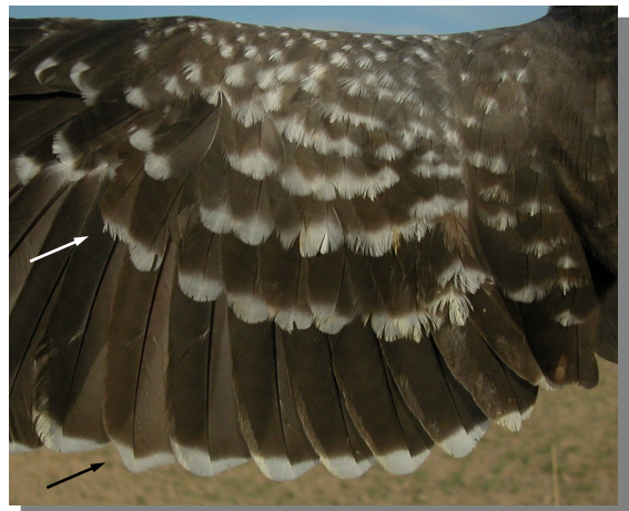
Great Spotted Cuckoo. Adult with retained feathers: pattern of secondaries and wing coverts (28-II)