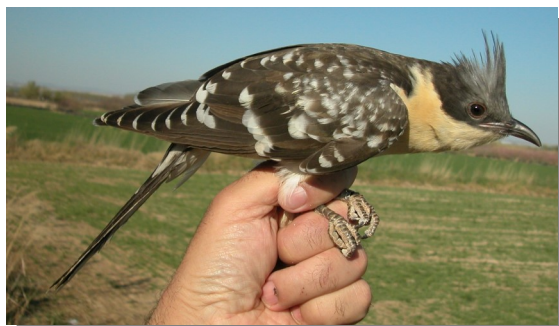
Great Spotted Cuckoo. 2nd year with soft ochre tinge on primaries (22-III)