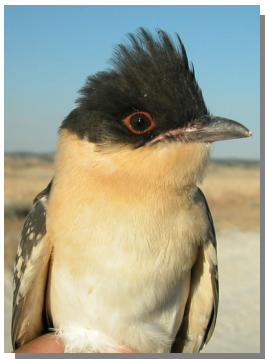
Great Spotted Cuckoo. Breast pattern: top left adult (28-II); top right 2nd year (08-IV); left juvenile (02-VI).