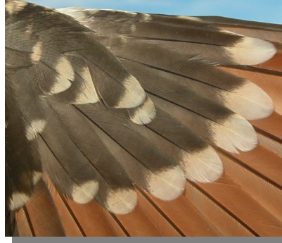
Great Spotted Cuckoo. Juvenile: pattern of primary coverts (02-VI)