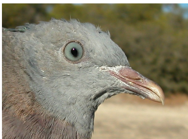
Wood Pigeon. Ageing. Pattern of head and neck: top adult; bottom juvenile.