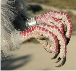
Wood Pigeon. Legs pattern: top adult (22-VI); bottom juvenile (04-VII).