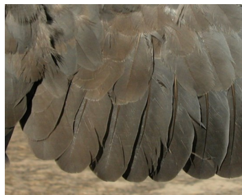
Wood Pigeon. Ageing. Pattern of secondaries: top adult, middle 2nd year; bottom juvenile.