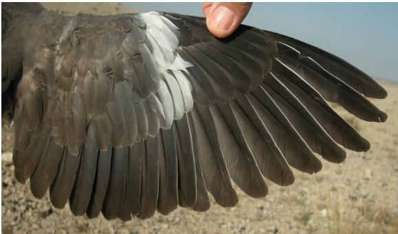
Wood Pigeon. Juvenile: pattern of wing (04-VII).