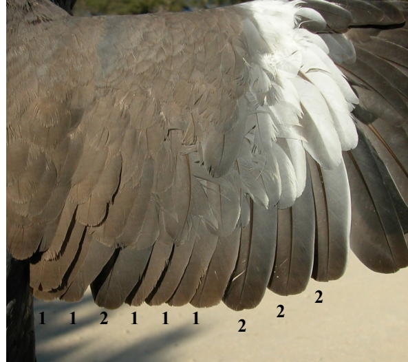
Wood Pigeon. 2nd year spring: pattern of secondaries and wing coverts (1 juvenile feathers; 2 postjuvenile feathers) (22-VI).