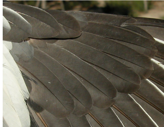
Wood Pigeon. 2nd year: pattern of primary coverts (22-VI).