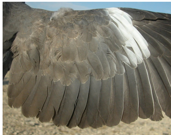
Wood Pigeon. Juvenile: pattern of secondaries and wing coverts (04-VII).