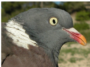
Wood Pigeon. Pattern of head and wing.

41-45 cm. Adult with grey bluish plumage; wings with a white patch; grey blue tail with a broad dark terminal band; neck with a white patch. Juvenile duller and without white patch on neck.