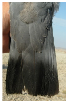
Wood Pigeon. Pattern and wear of tail: top left adult (16-VI); top right 2nd year (22-VI); left juvenile (04-VII).