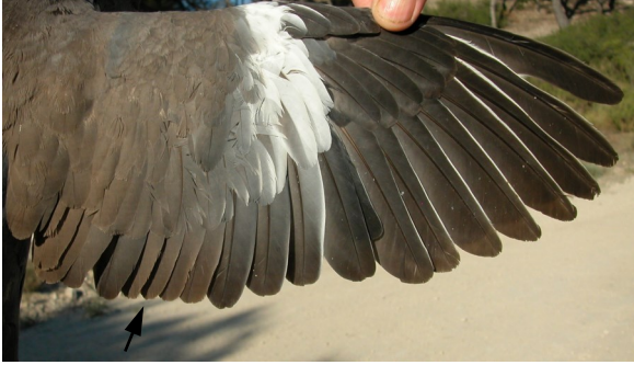
Wood Pigeon. 2nd year spring: pattern of wing (22-VI).