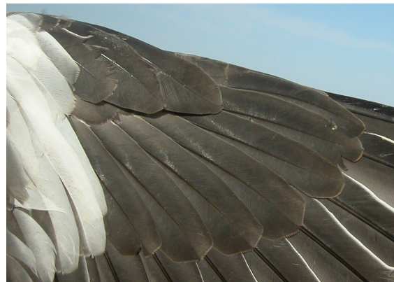
Wood Pigeon. Juvenile: pattern of primary coverts (04-VII).