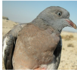
Wood Pigeon. Breast pattern and iris colour: top left adult (16-VI); top right 2nd year (22-VI); left juvenile (04-VII).