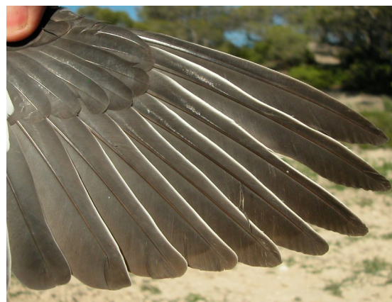
Wood Pigeon. Adult: pattern of primaries (16-VI).