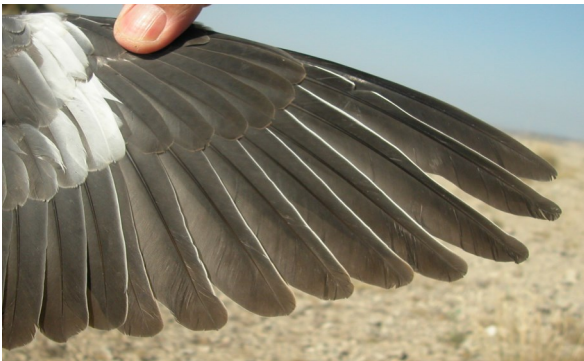
Wood Pigeon. Juvenile: pattern of primaries (04-VII).