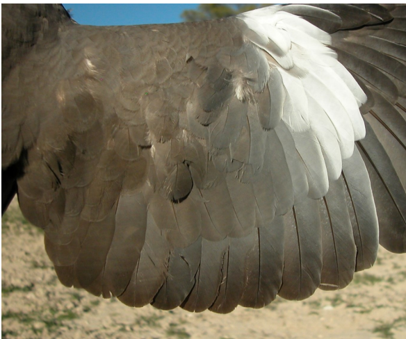
Wood Pigeon. Adult: pattern of secondaries and wing coverts (16-VI).