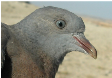
Wood Pigeon. Head pattern and iris colour: top adult (16-VI); middle 2nd year (22-VI); bottom juvenile (04-VII).