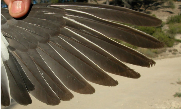
Wood Pigeon. 2nd year spring: pattern of primaries (22-VI).