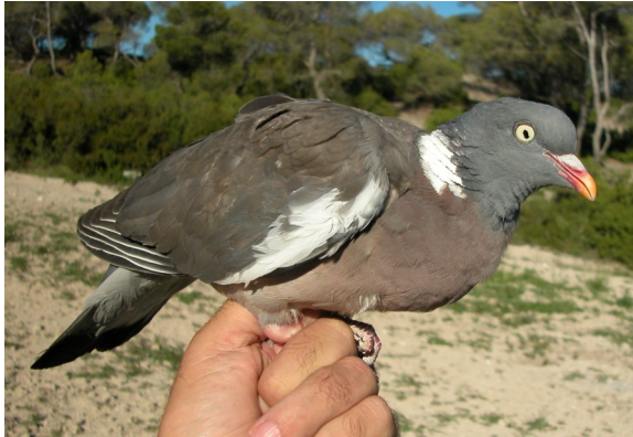
Wood Pigeon. Adult (16-VI).