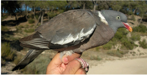
Wood Pigeon. 2nd year (22-VI).