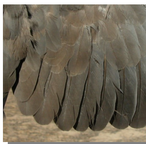
Wood Pigeon. Ageing. Pattern of secondaries: top adult, middle 2nd year; bottom juvenile.