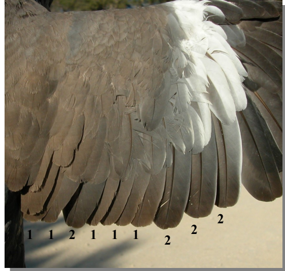
Wood Pigeon. 2nd year spring: pattern of secondaries and wing coverts (1 juvenile feathers; 2 postjuvenile feathers) (22-VI).