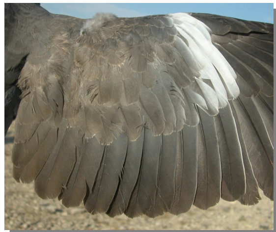
Wood Pigeon. Juvenile: pattern of secondaries and wing coverts (04-VII).