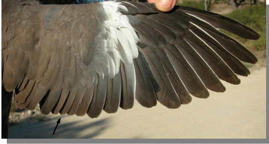
Wood Pigeon. 2nd year spring: pattern of wing (22-VI).