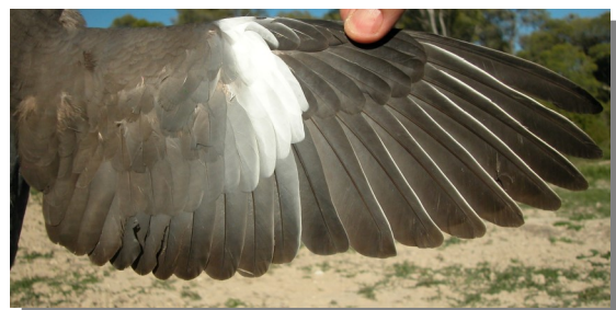
Wood Pigeon. Adult: pattern of wing (16-VI).