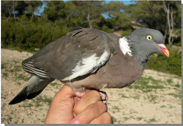
Wood Pigeon. Adult (16-VI).