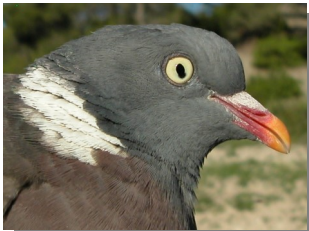
Wood Pigeon. Pattern of head and wing.

41-45 cm. Adult with grey bluish plumage; wings with a white patch; grey blue tail with a broad dark terminal band; neck with a white patch. Juvenile duller and without white patch on neck.