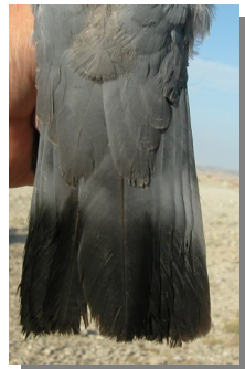
Wood Pigeon. Pattern and wear of tail: top left adult (16-VI); top right 2nd year (22-VI); left juvenile (04-VII).