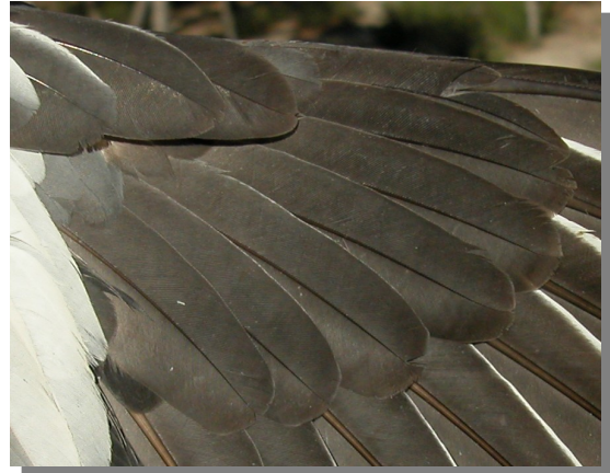
Wood Pigeon. 2nd year: pattern of primary coverts (22-VI).