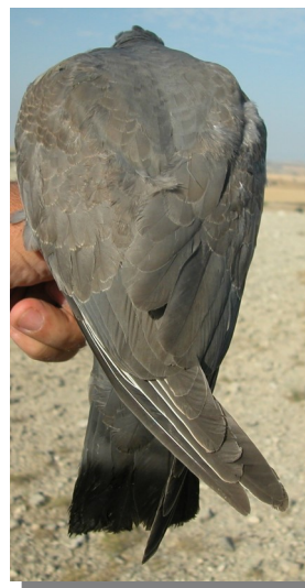
Wood Pigeon. Upper-part pattern: top left adult (16-VI); top right 2nd year (22-VI); left juvenile (04-VII).