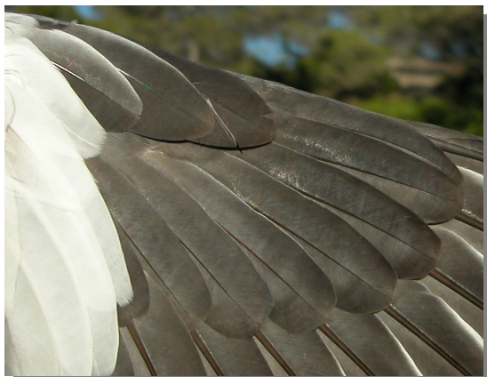
Wood Pigeon. Adult: pattern of primary coverts (16-VI).