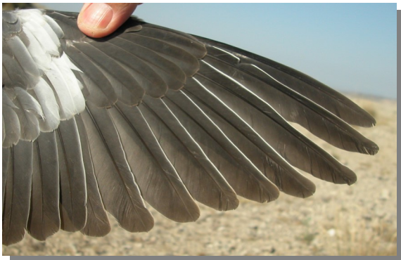
Wood Pigeon. Juvenile: pattern of primaries (04-VII).