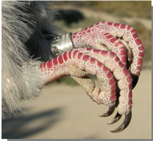
Wood Pigeon. Legs pattern: top adult (22-VI); bottom juvenile (04-VII).