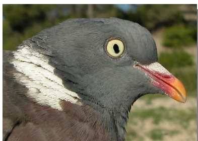
Wood Pigeon. Ageing. Pattern of head and neck: top adult; bottom juvenile.

Adult with white patch on neck; dark slate grey wing coverts lacking buff tips; if there are unmoulted secondaries have the same length than the neighbouring moulted feathers; yellow iris; reddish legs.