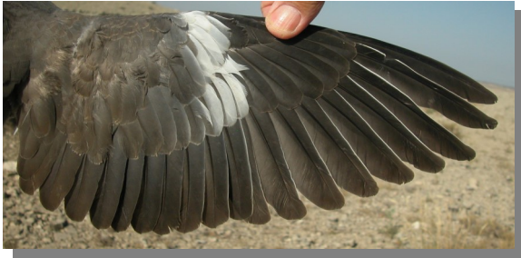
Wood Pigeon. Juvenile: pattern of wing (04-VII).