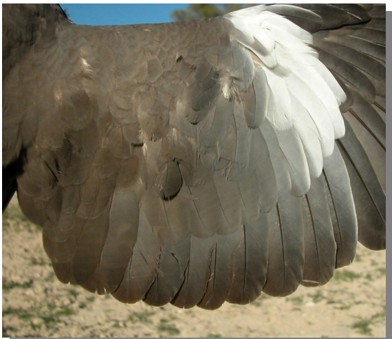
Wood Pigeon. Adult: pattern of secondaries and wing coverts (16-VI).