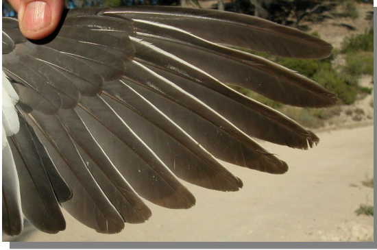
Wood Pigeon. 2nd year spring: pattern of primaries (22-VI).