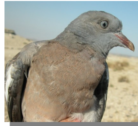
Wood Pigeon. Breast pattern and iris colour: top left adult (16-VI); top right 2nd year (22-VI); left juvenile (04-VII).