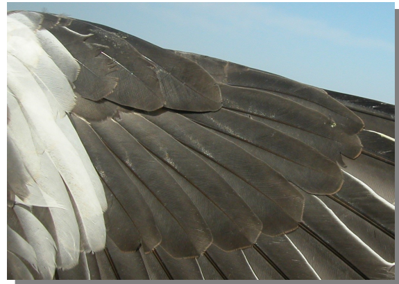
Wood Pigeon. Juvenile: pattern of primary coverts (04-VII).