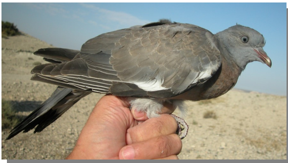
Wood Pigeon. Juvenile (04-VII)