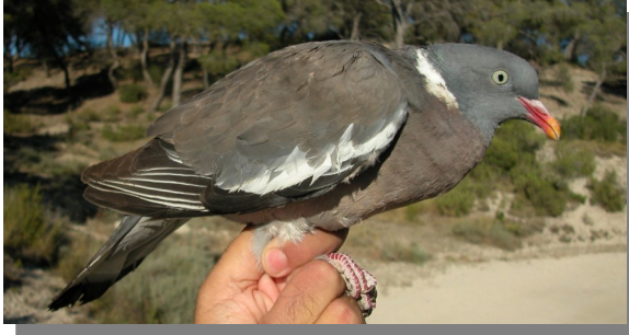
Wood Pigeon. 2nd year (22-VI).