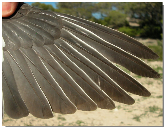
Wood Pigeon. Adult: pattern of primaries (16-VI).