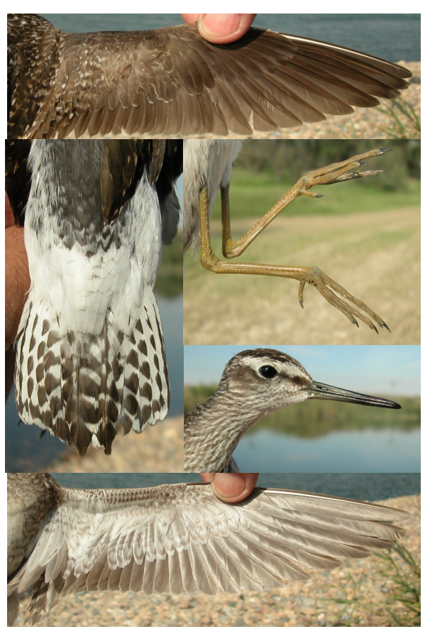
Wood Sandpiper ( Tringa glareola ): without white patch on the flight feathers; whitish underwing coverts; white rump; white tail feathers with broad dark barred; straight grey bill; green-yellowish legs.

Green Sandpiper ( Tringa ochropus ): without white patch on the flight feathers; blackish underwing coverts; white rump; white tail feathers with broad dark barred; straight green bill; greenish legs.