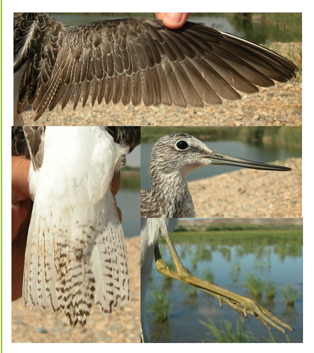
Greenshank ( Tringa nebularia ): without white patch on the flight feathers; white rump; white tail feathers with narrow dark barred; upcurved greenish bill; green legs.

Redshank ( Tringa totanus ): white patch on the bottom of the flight feathers; white rump; white tail feathers with dark broad barred; straight dark bill with red base; red legs.